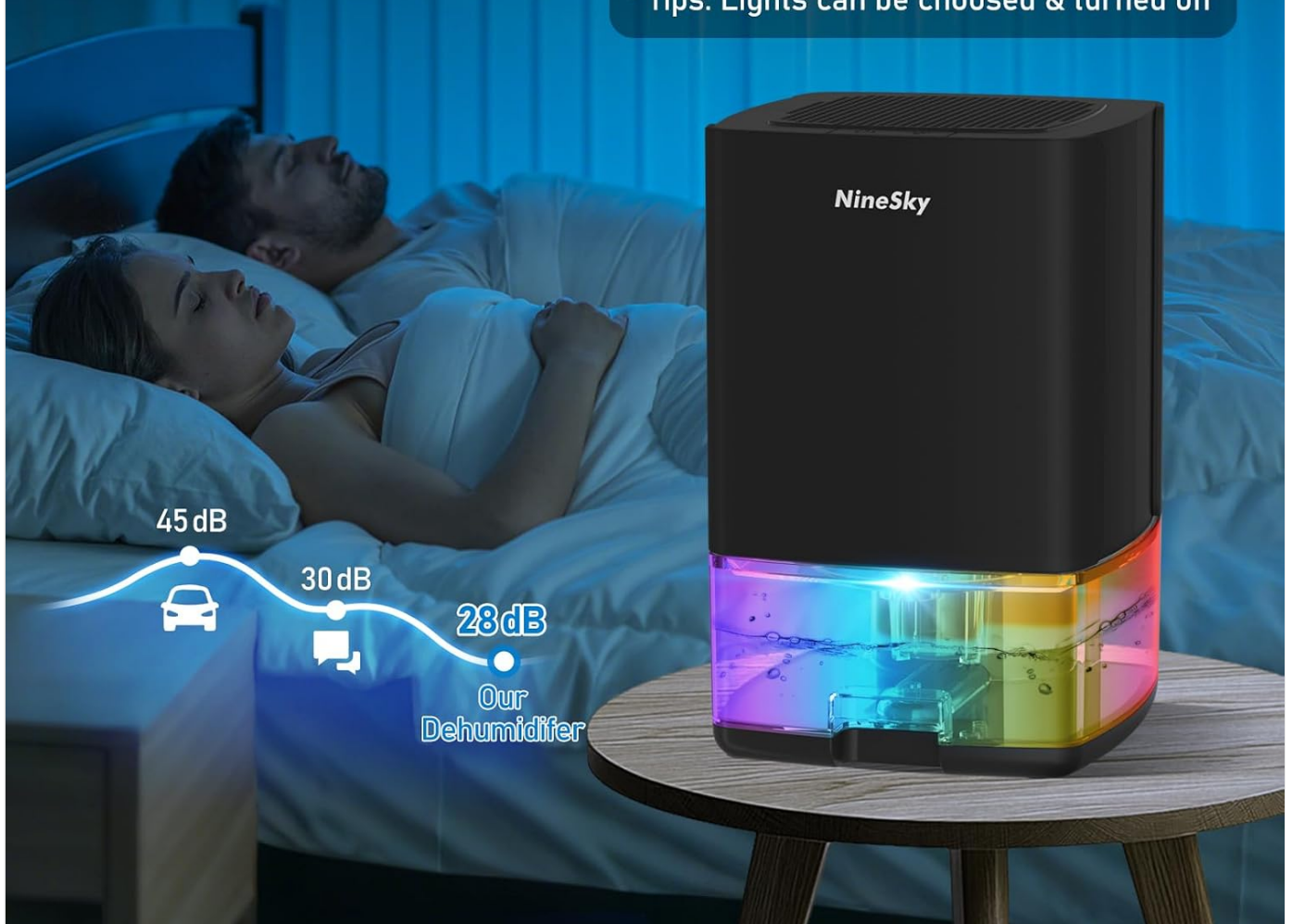
Image: The dehumidifier operating quietly in a bedroom, with its ambient lights creating a soothing atmosphere.

* Tips: Lights can be choosed & turned off