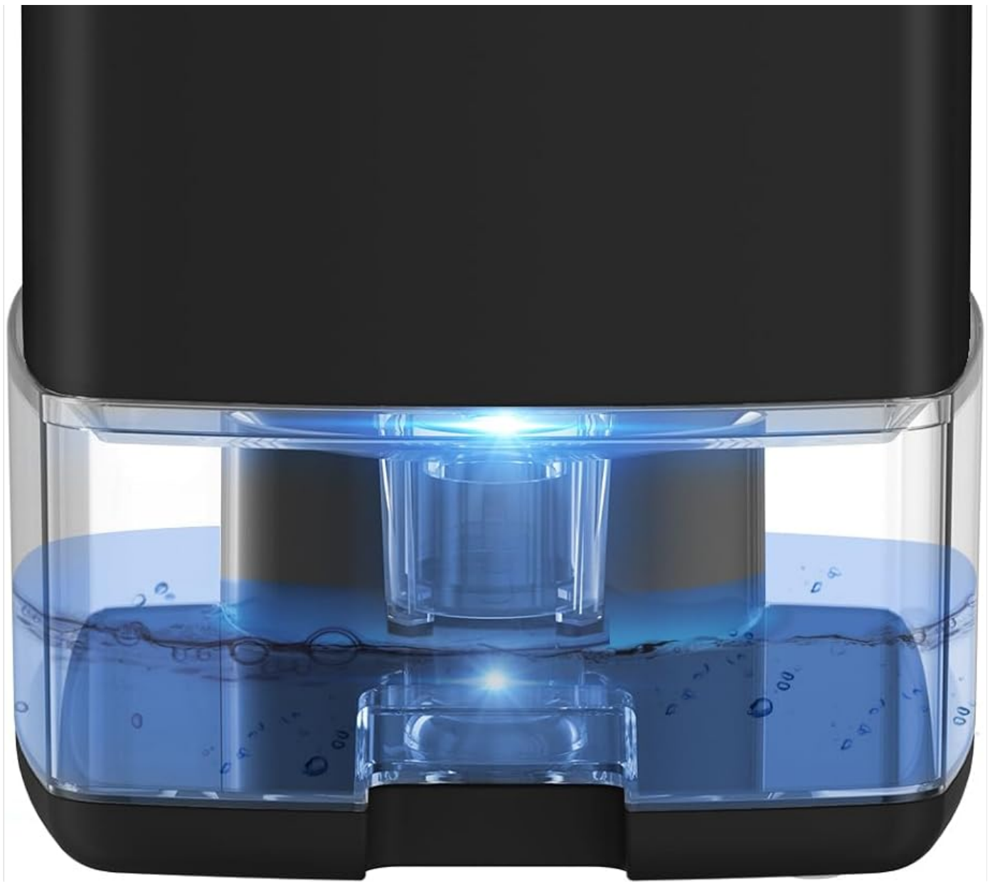
Image: Front view of the NineSky C1 Dehumidifier, showcasing its compact design and the illuminated water tank.