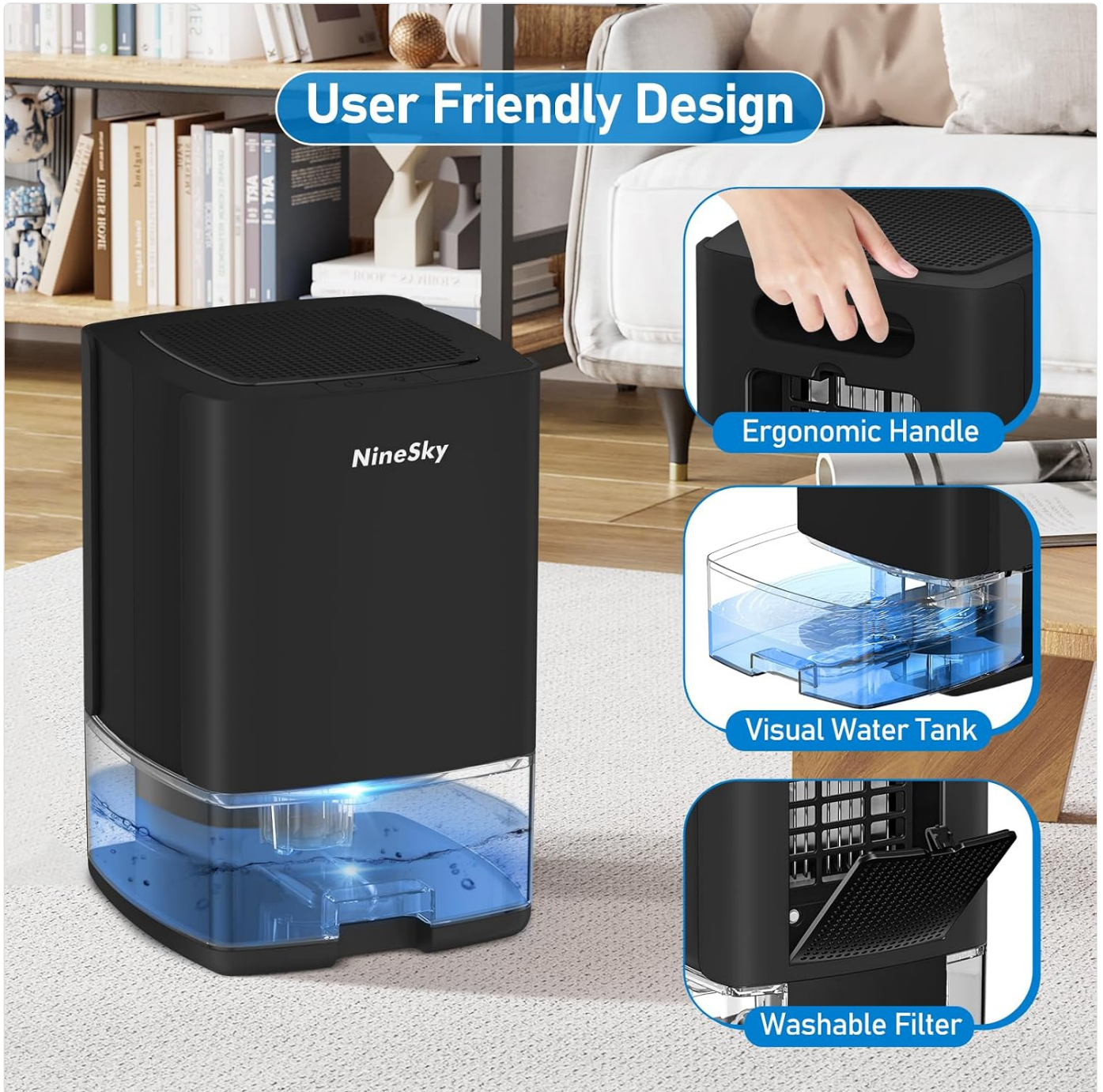
Image: Close-up view of the dehumidifier's ergonomic handle, visual water tank, and accessible washable filter for easy maintenance.