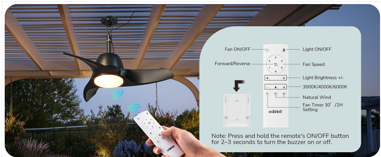
Figure 3: Remote control layout and functions.