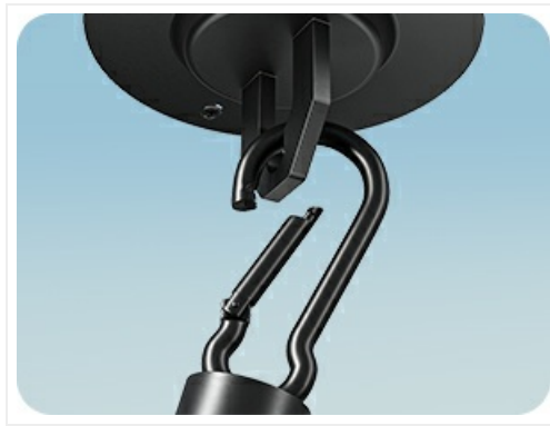
Figure 2: Simplified installation steps for the EDISHINE outdoor ceiling fan.