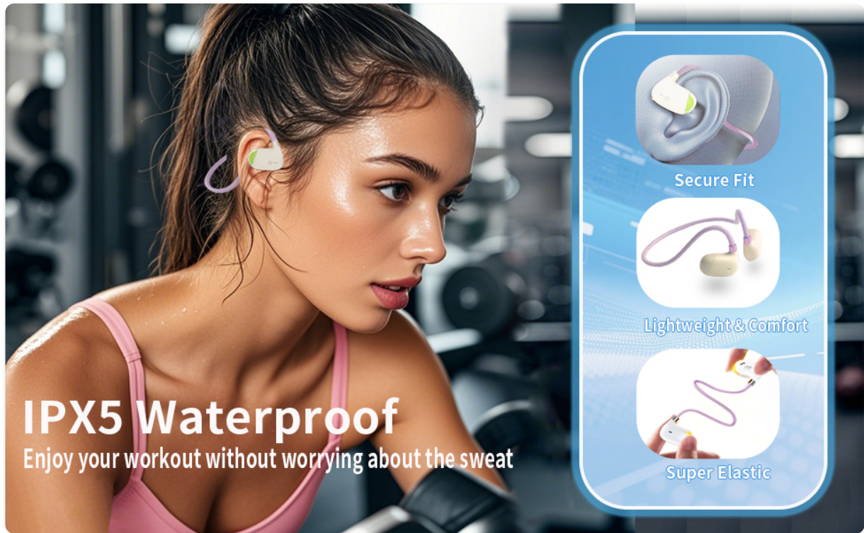
Image: The EJEAS X3 headphones are IPX5 waterproof, making them suitable for workouts and resistant to sweat.