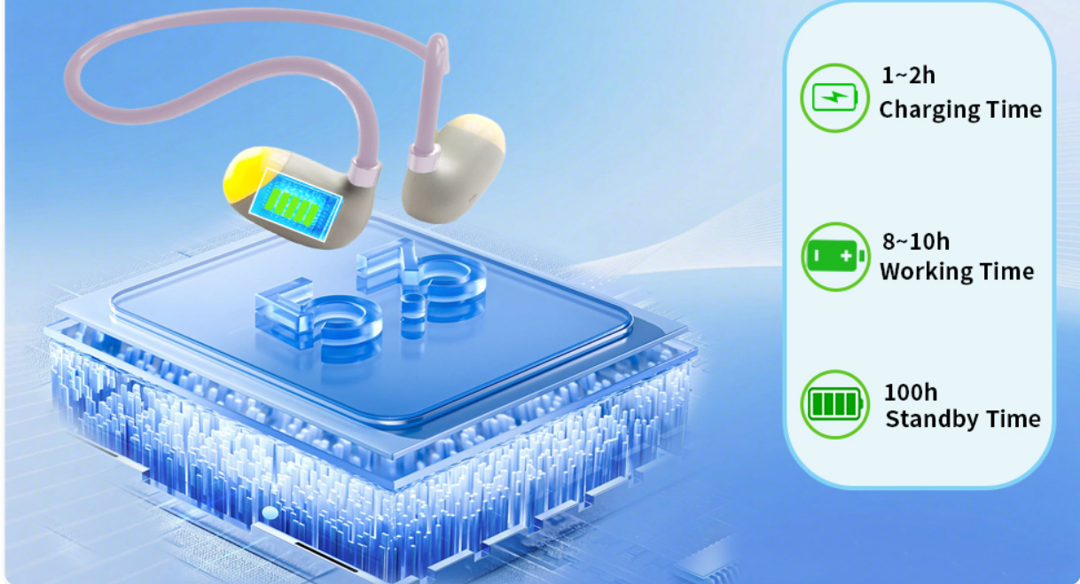
Image: Bluetooth 5.3 capabilities of the EJEAS X3, highlighting stable connection and compatibility.