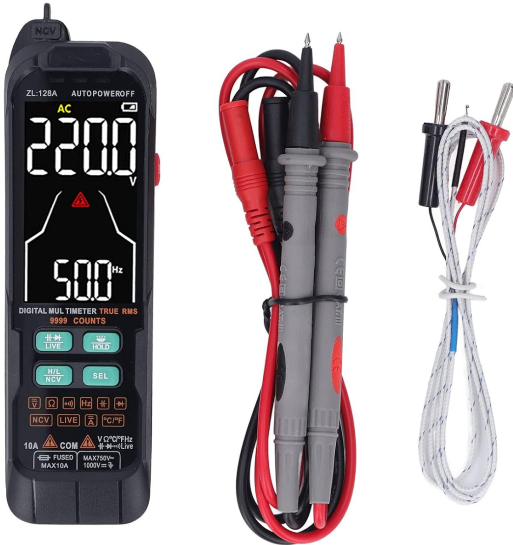
Image: The FLEXMAN Digital Multimeter displayed alongside its red and black test leads and a white temperature probe, indicating included accessories.