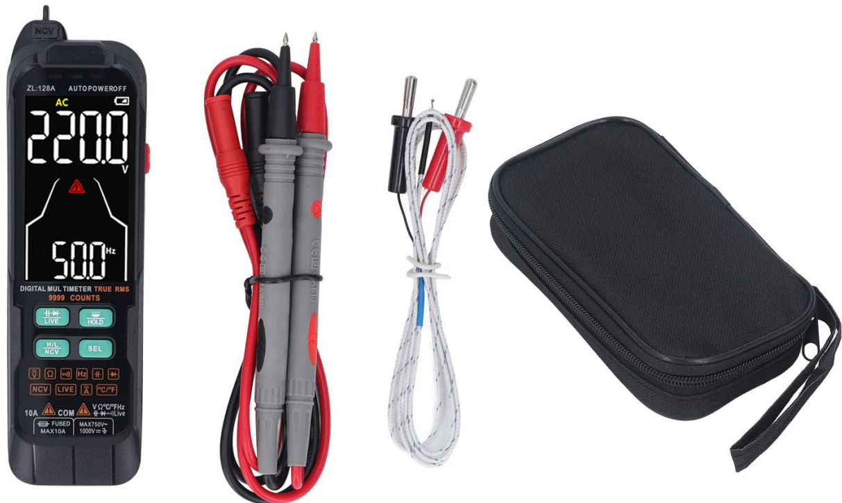
Image: Front view of the FLEXMAN Digital Multimeter, showing its display and function buttons.