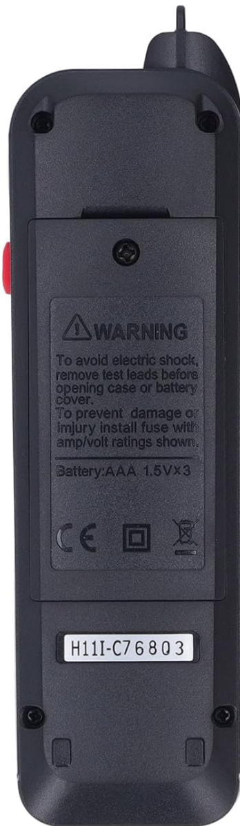
Image: Rear view of the FLEXMAN Digital Multimeter, showing the battery compartment and a warning label regarding battery replacement and safety.