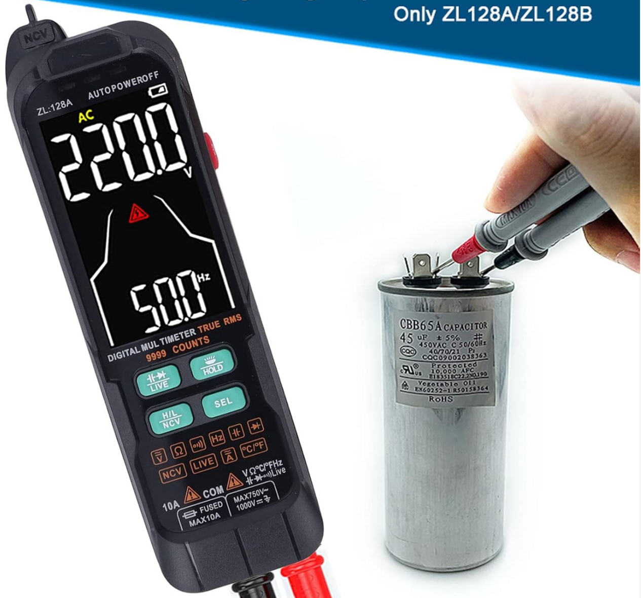
Image: The FLEXMAN Digital Multimeter displaying a capacitance measurement, with test leads connected to a capacitor.

Large range capacitance: 0-100000uF Only ZL128A/ZL128B