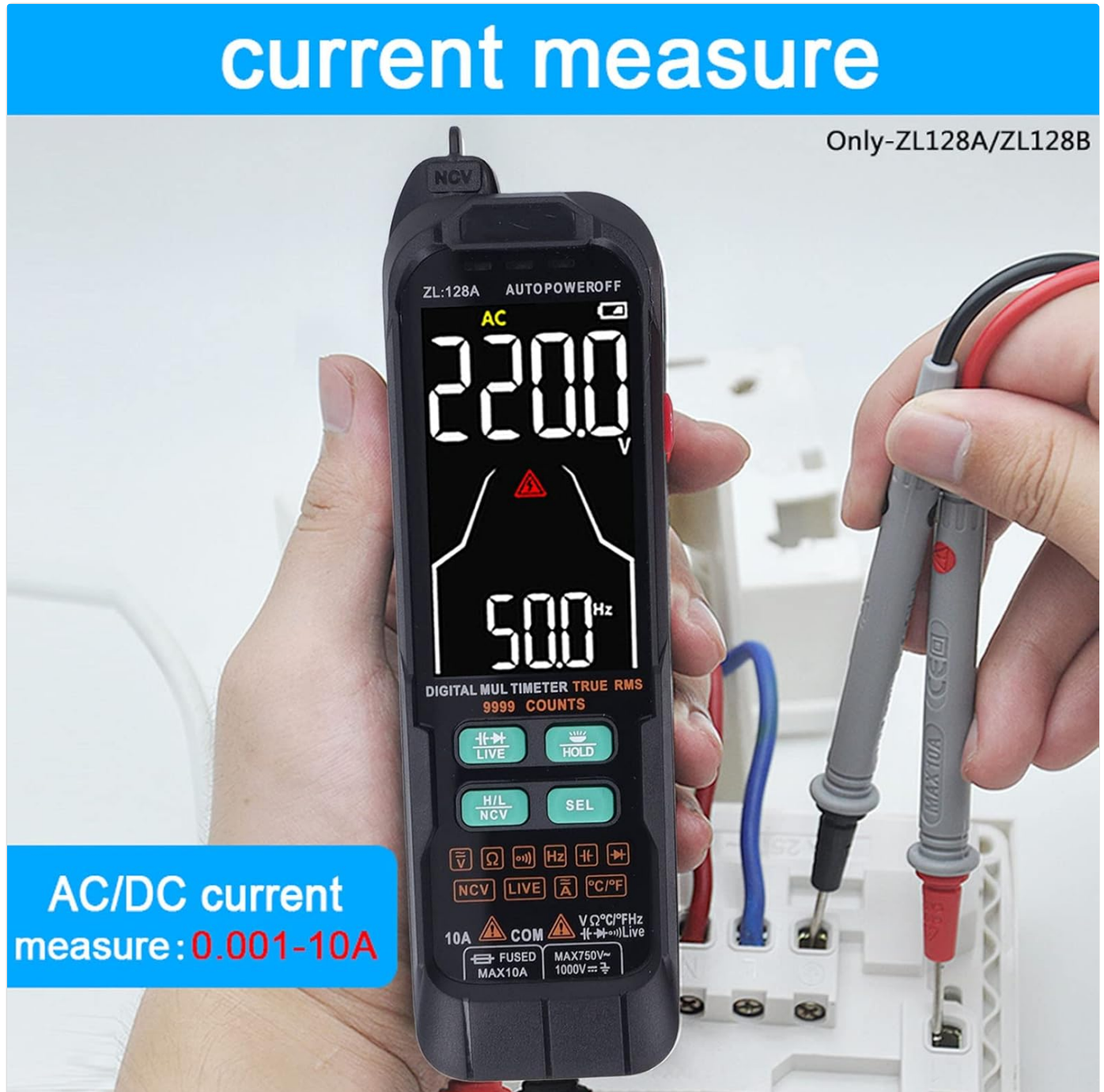
Image: The FLEXMAN Digital Multimeter with test leads connected, demonstrating a current measurement setup on an electrical outlet.