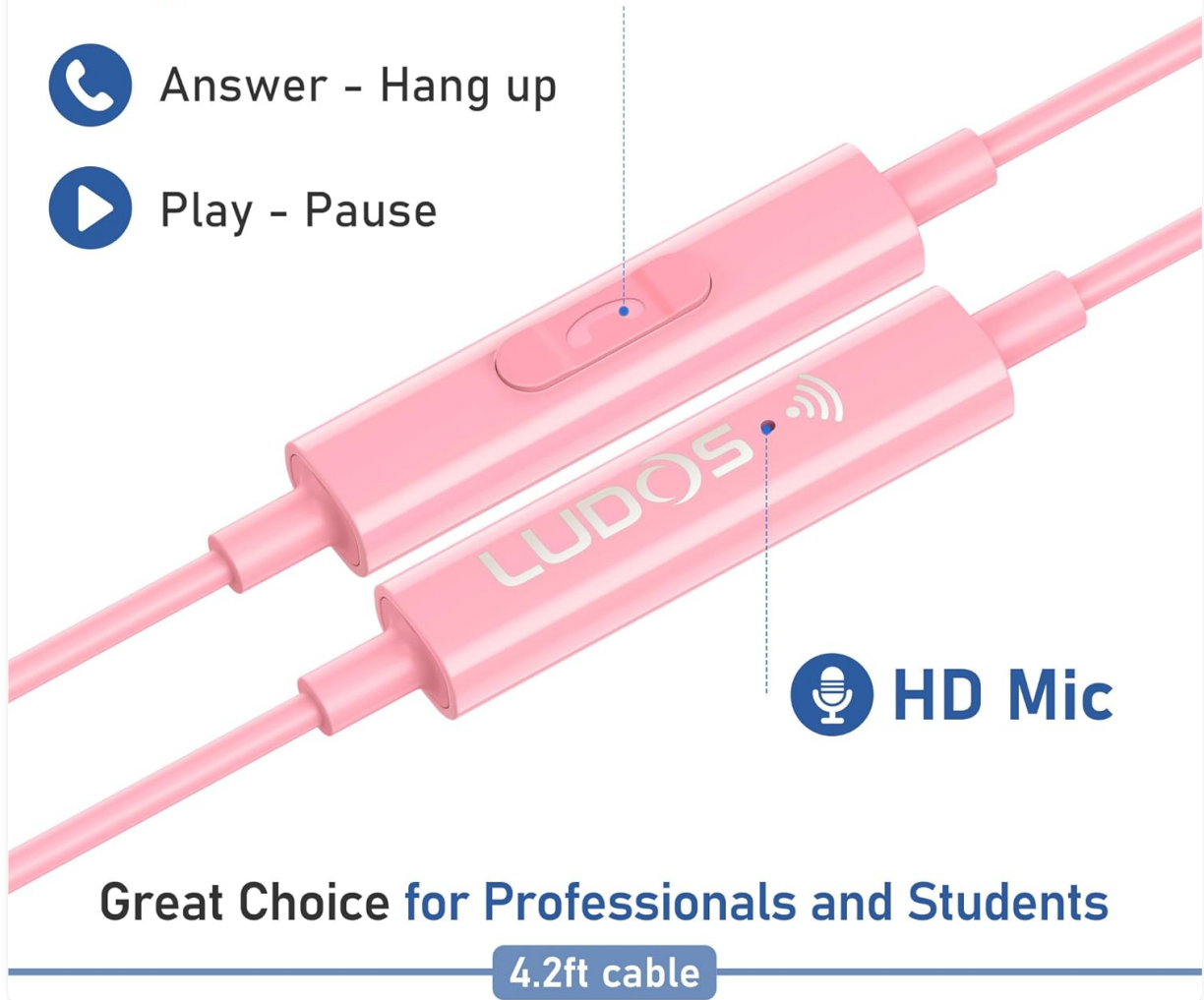
Figure 2: In-line control unit with single button functionality and HD microphone.