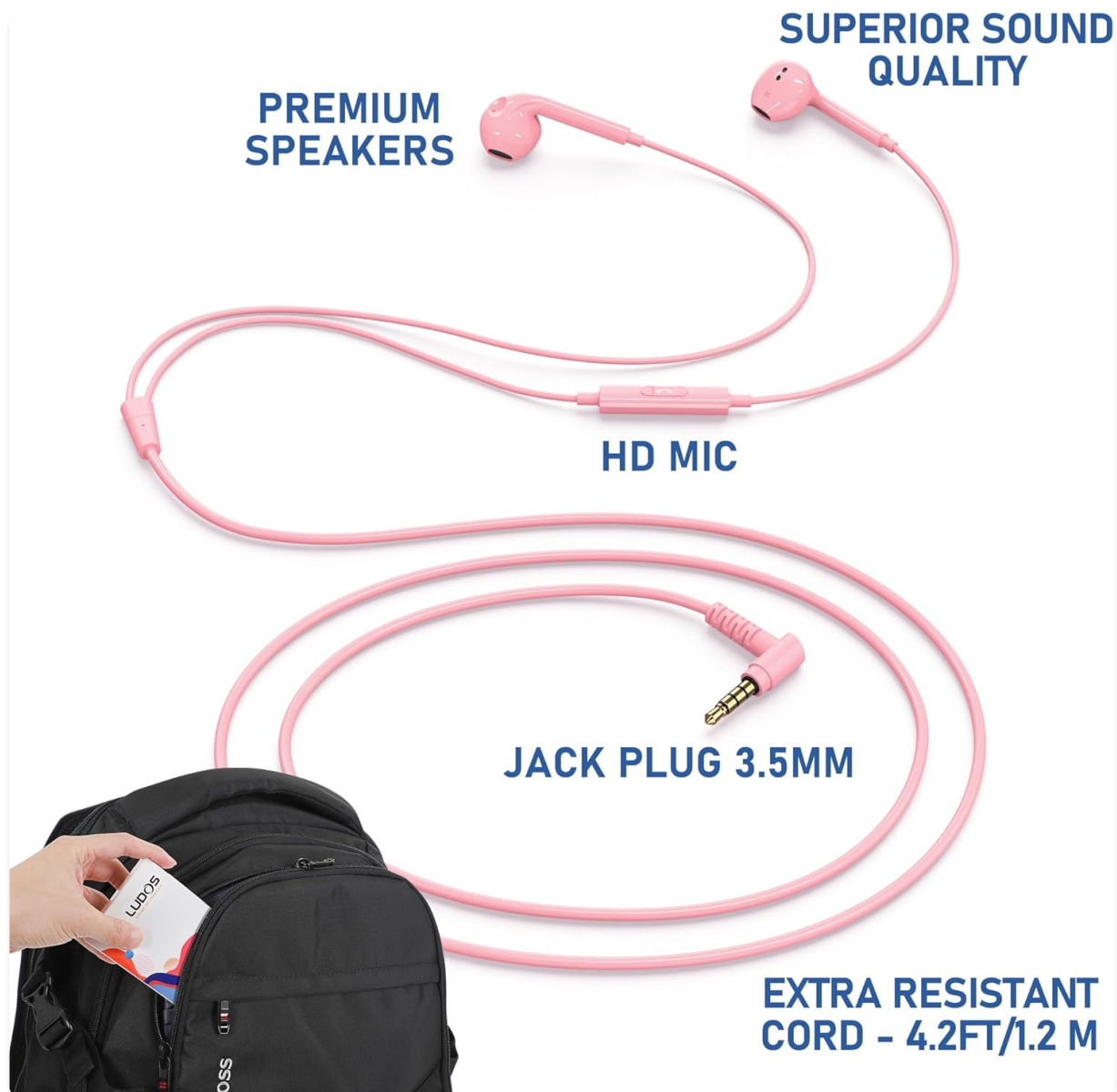
Figure 1: LUDOS ZENITH Wired Earbuds components, highlighting the 3.5mm jack, HD microphone, and earbud design.