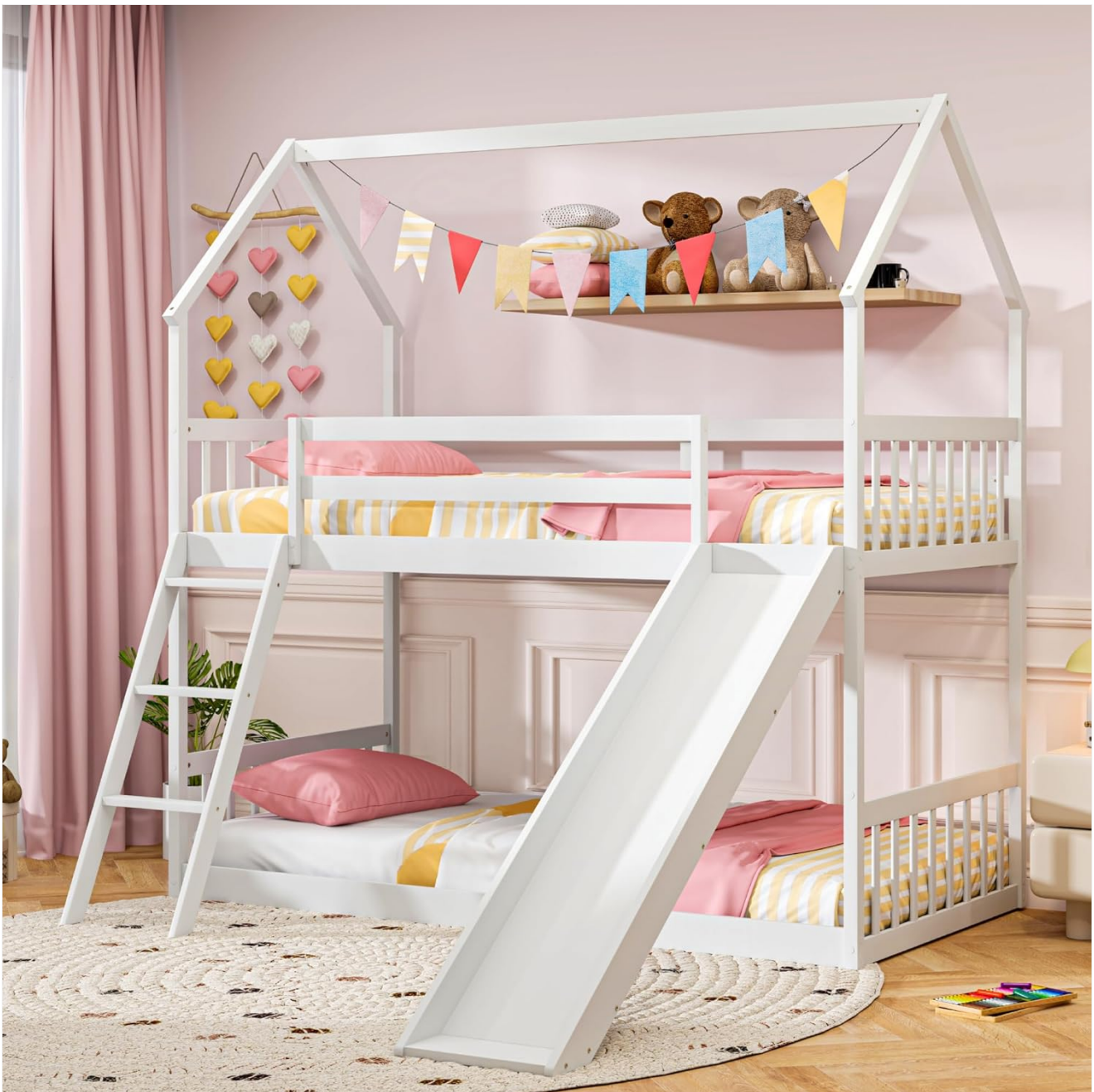
Image 1.1: The KOMFOTT Twin Over Twin House Bunk Bed, featuring a house-shaped frame, slide, and ladder.