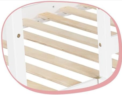
14 Robust Plywood Slats