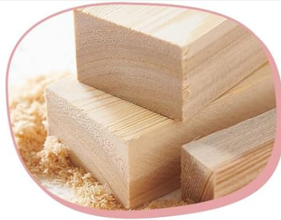
Solid Wood Frame