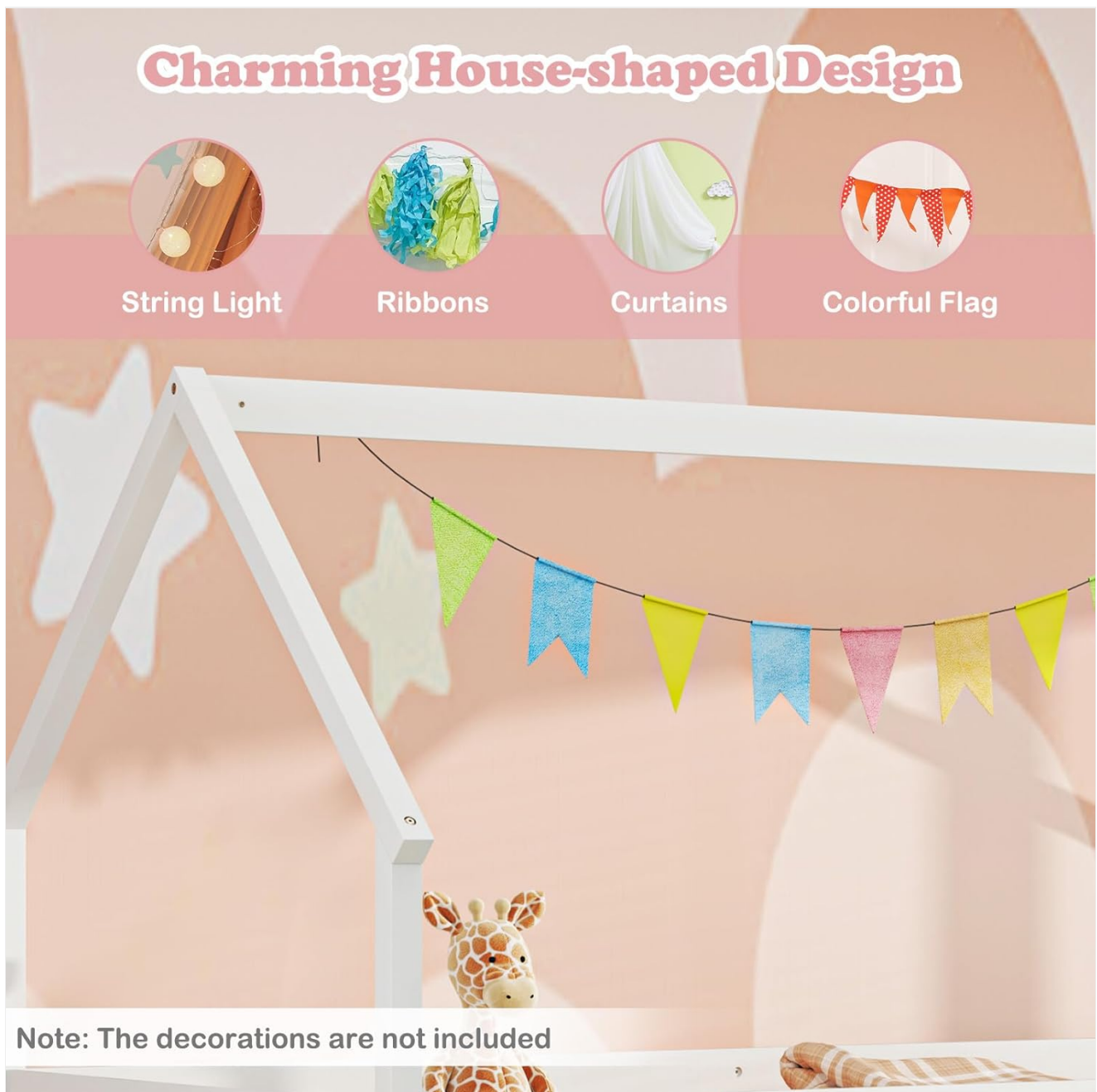
Image 5.1: The charming house-shaped design can be customized with decorations (not included).