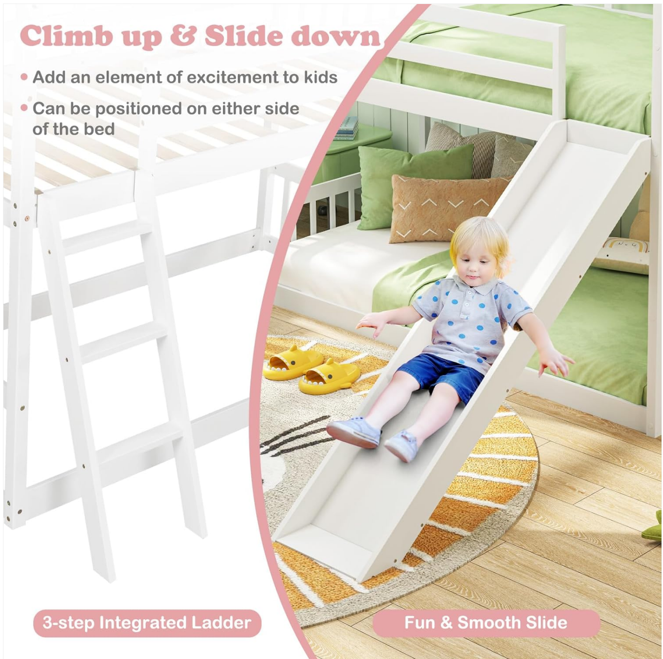
Image 4.2: The reversible 3-step integrated ladder and fun slide for access.