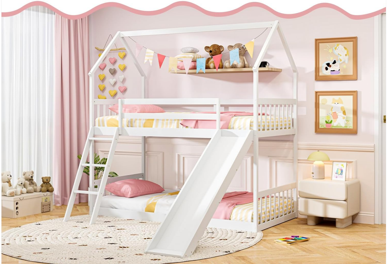
Image 4.1: Key structural features: 14 robust plywood slats, solid wood frame, and full-length guardrails.