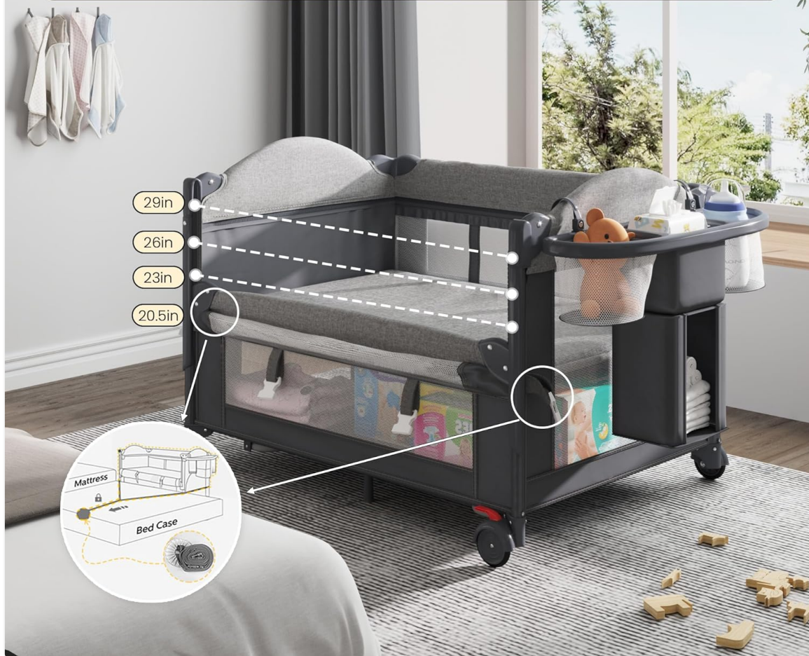
Figure 3: Bedside sleeper configuration with adjustable height and secure attachment to an adult bed.

For Safe and direct access during nighttime care