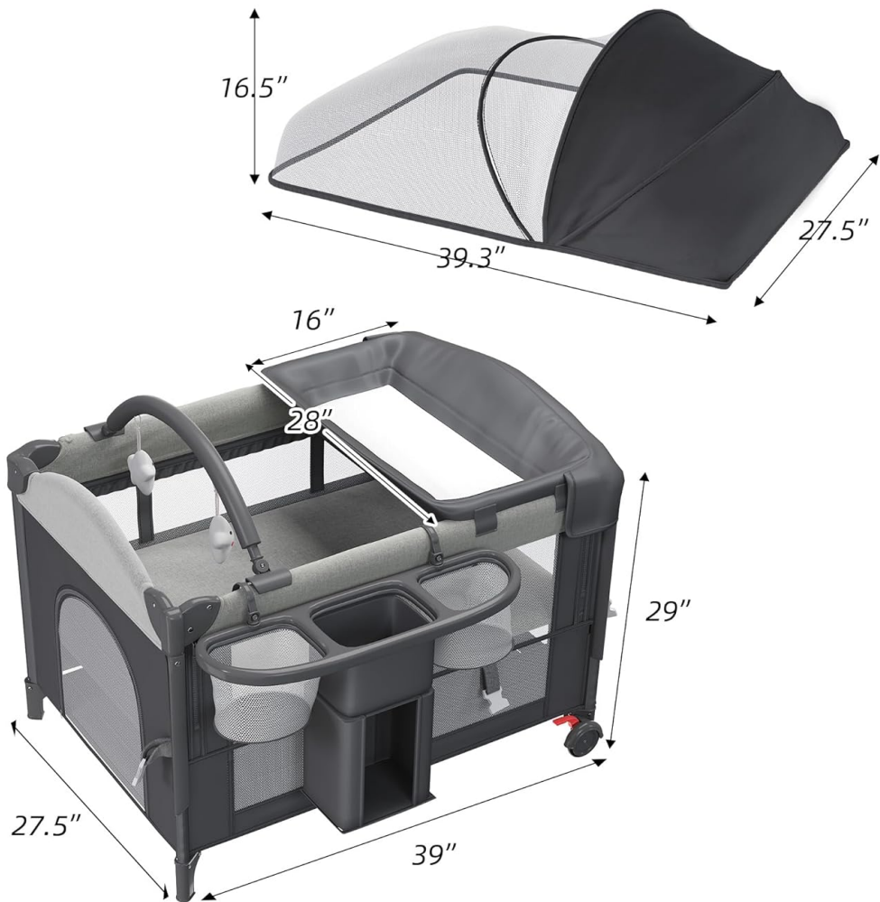
Figure 6: Key dimensions of the bassinet and mosquito net for reference.