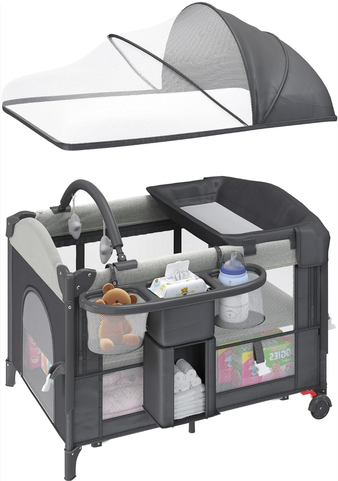
Figure 1: Overview of the HOMMOW 5-in-1 Baby Bassinet Bedside Sleeper with mosquito net and side organizer.