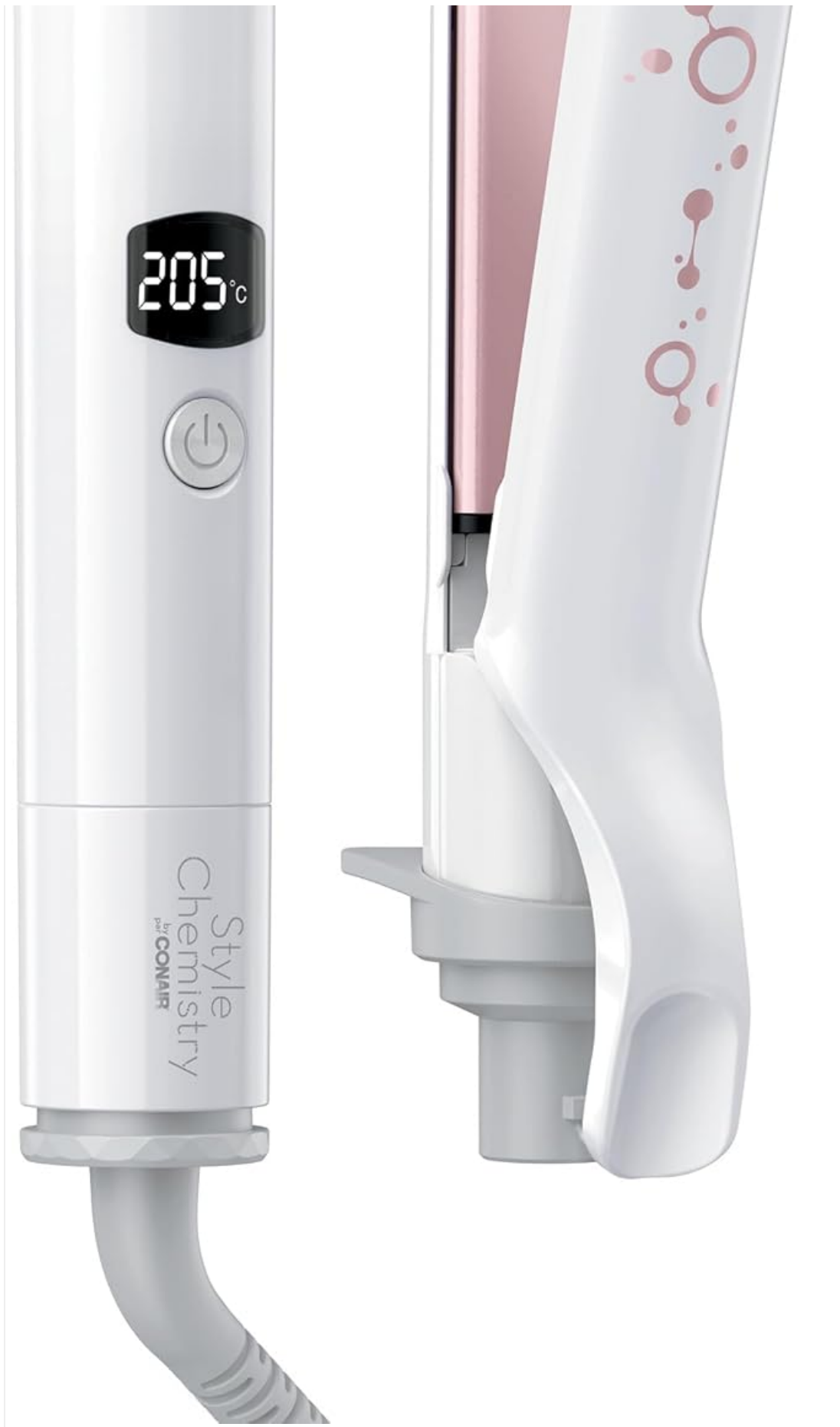
Image: Conair Style Chemistry Power Handle connected to the 1-inch Straightener attachment.