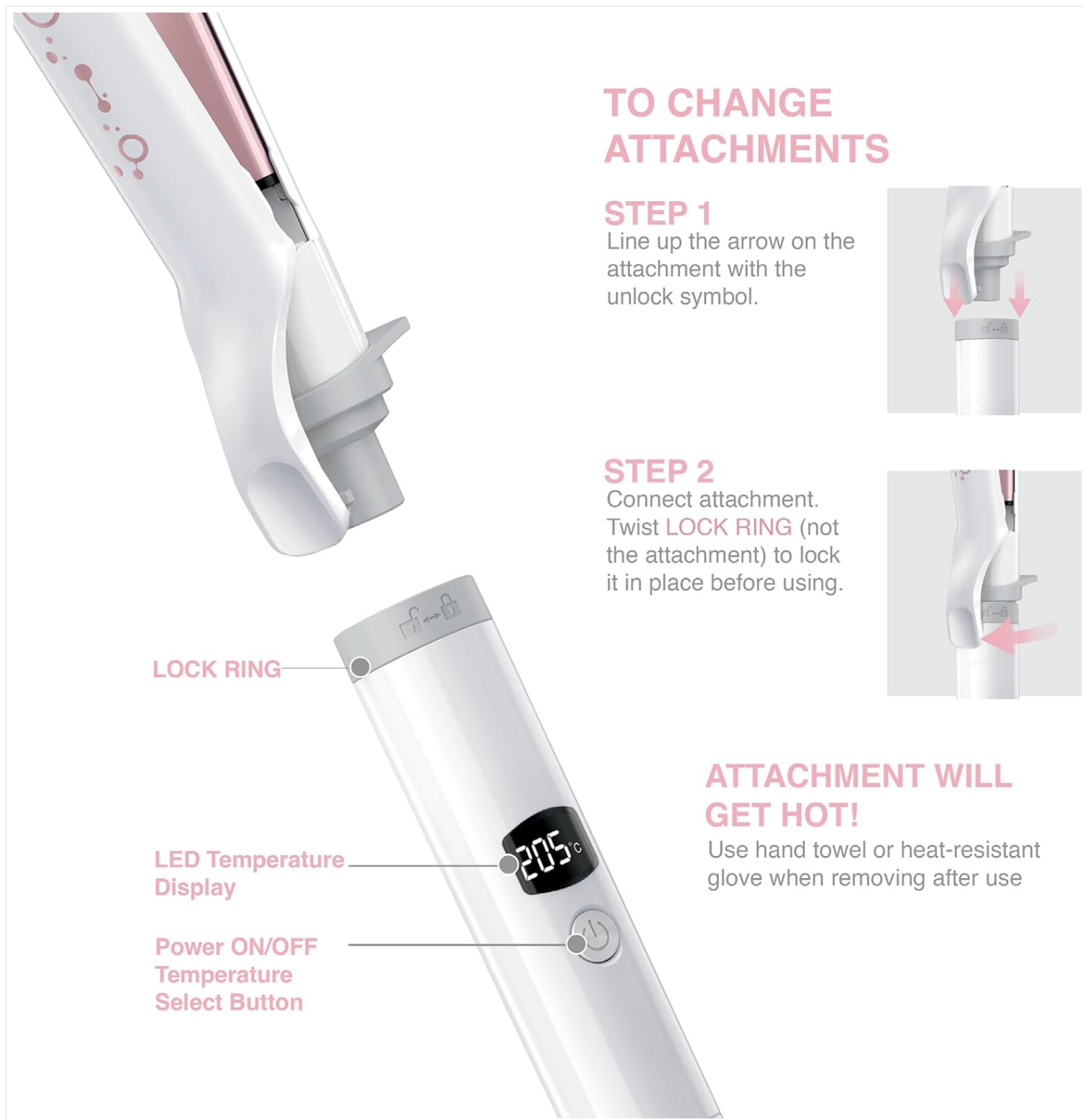
Image: Step-by-step visual guide on how to connect and lock an attachment to the Power Handle.