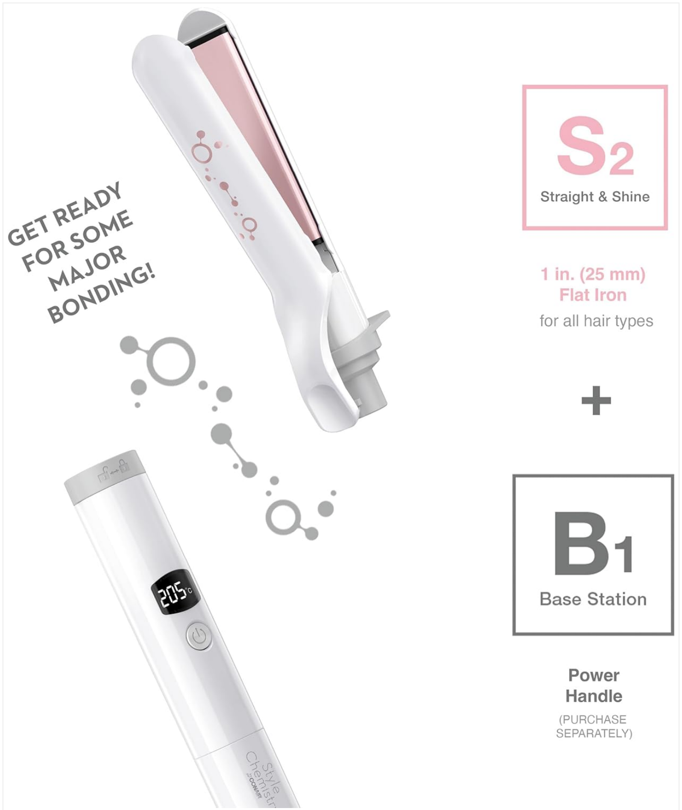
Image: Diagram showing the Power Handle and the 1-inch Straightener attachment as separate components of the Starter Pack.