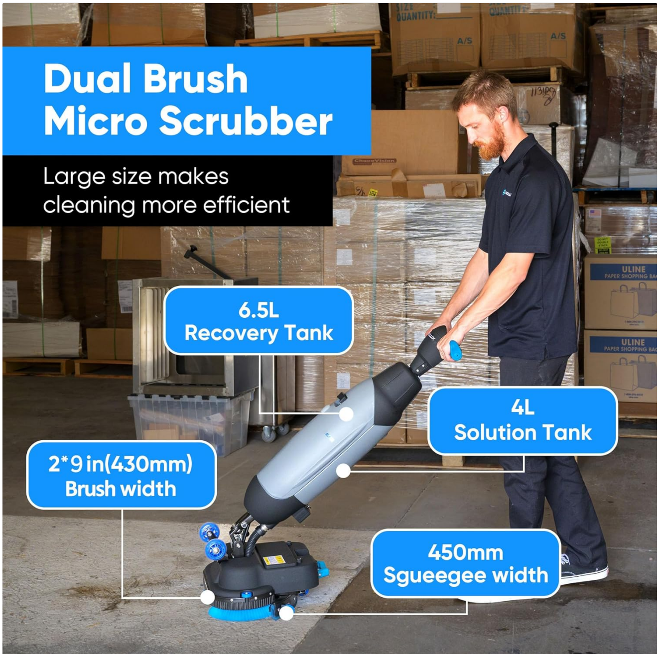
Image: Solution and recovery tanks on the unit.