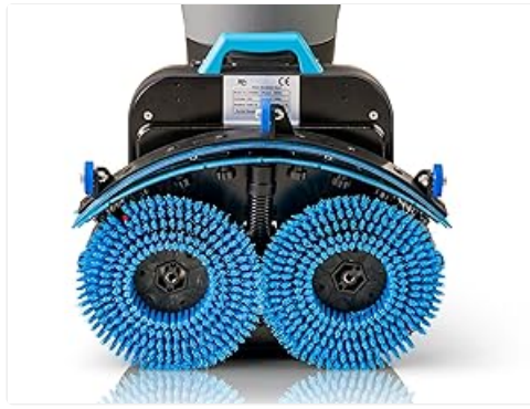
Image: Squeegee removal for maintenance.