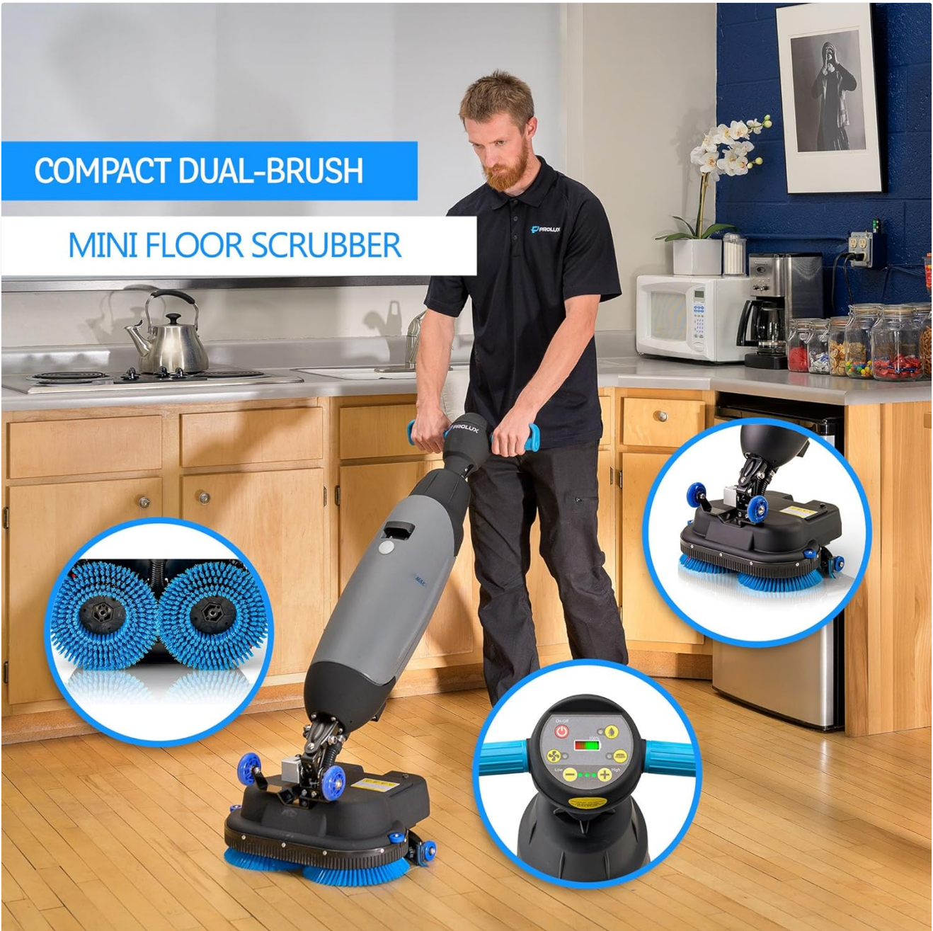
Image: Operating the floor cleaner.