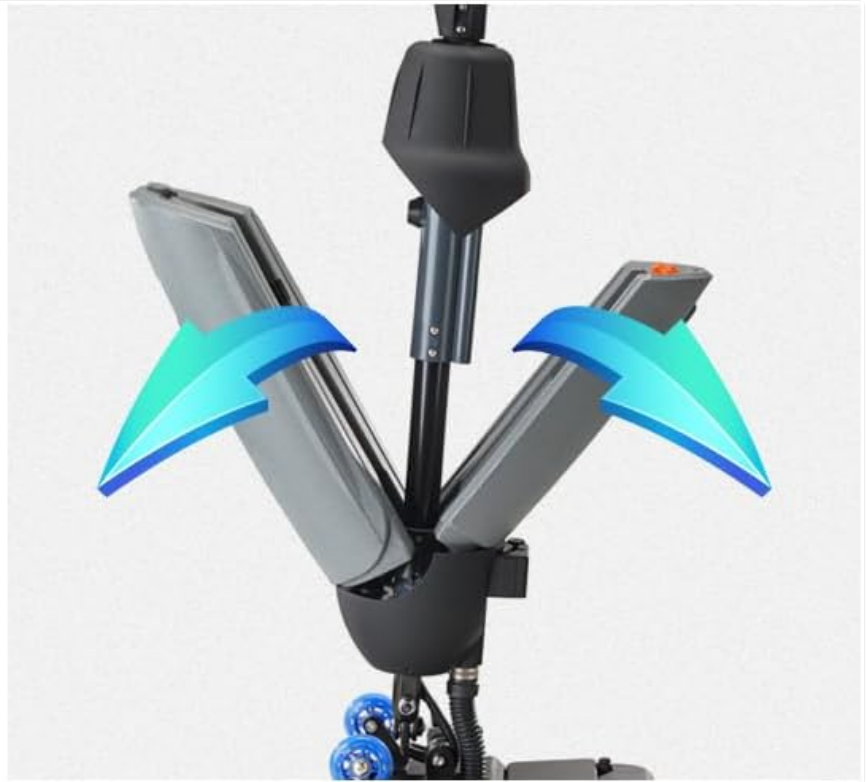
Image: Detachable water tanks for easy cleaning.