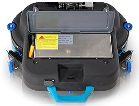
Image: Battery compartment for installation and charging.