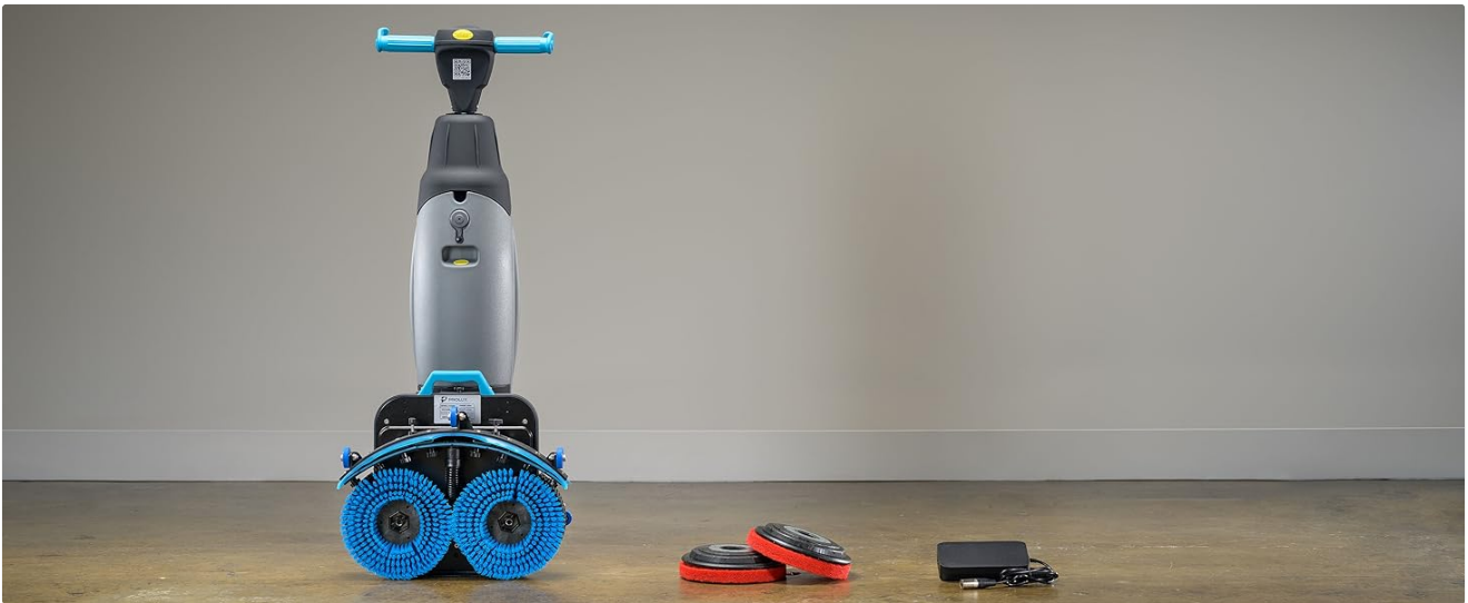
Image: Flexible operation with adjustable handle and rotatable brush head.