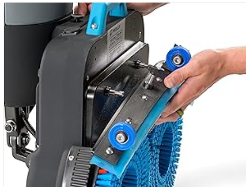
Image: Dual brushes for cleaning.