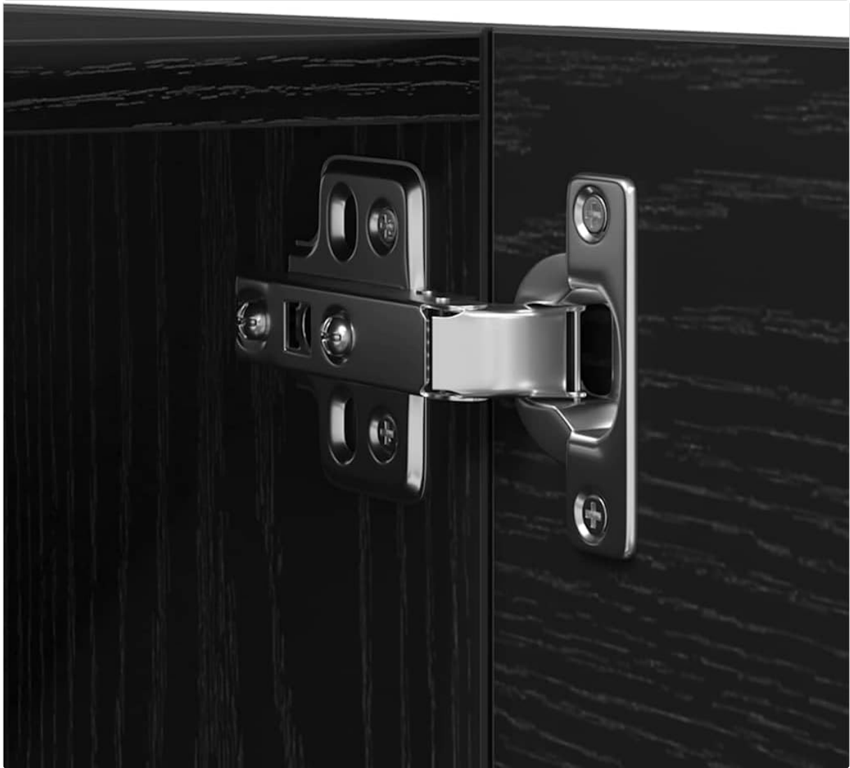
Image: A detailed view of one of the cabinet's metal hinges, showing its construction and attachment points.