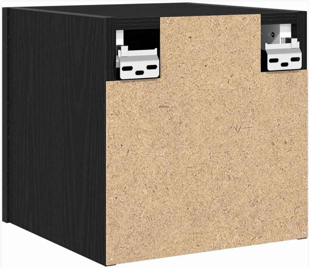
Image: The back of the cabinet, illustrating the design of the integrated mounting brackets used for wall installation.