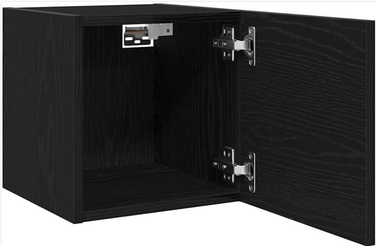
Image: The cabinet with its door open, revealing the interior storage compartment and the installed hinges.