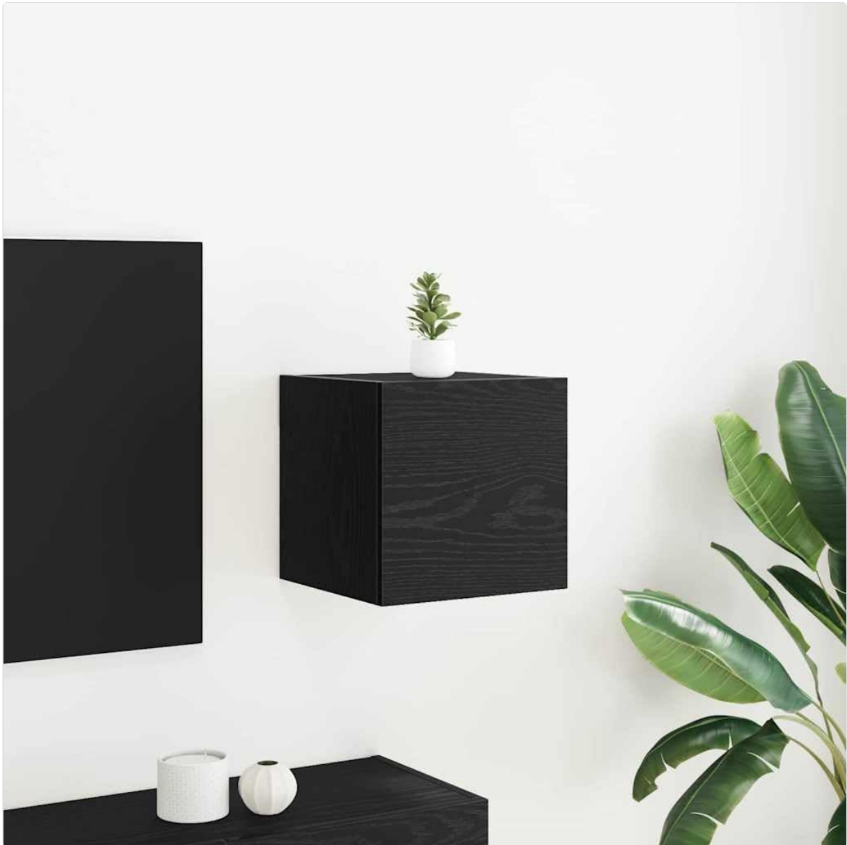
Image: The assembled vidaXL TV Cabinet, wall-mounted in a living space, showcasing its minimalist design and functional placement.