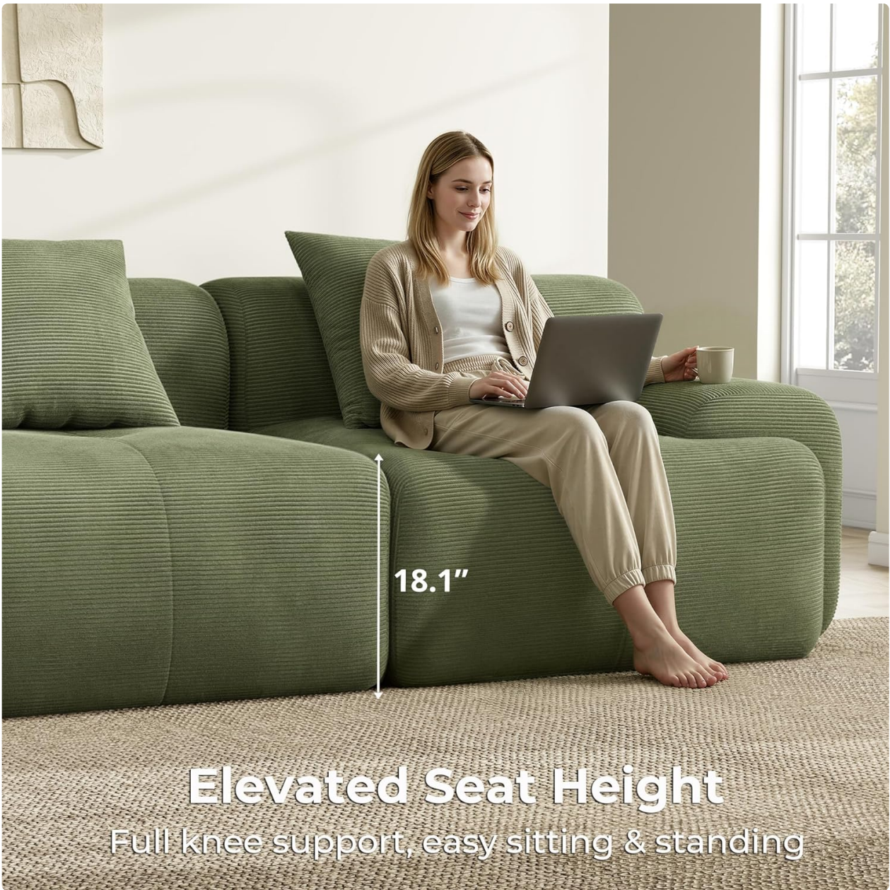
Image: Highlights the elevated seat height of 18.1 inches for comfortable sitting and standing.