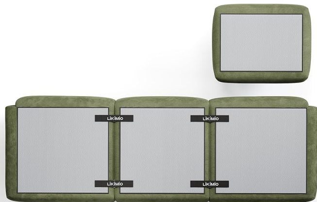
Image: Overhead view showing the anti-slip technology and straps that connect the modular pieces.

Lock modules to avoid drifting; strap-free ottoman for effortless mobility.