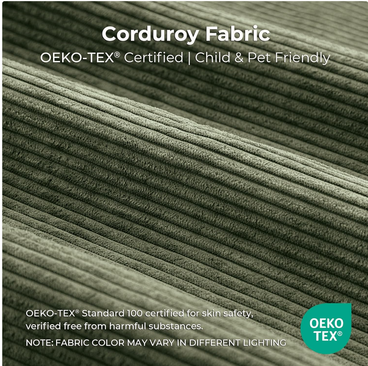
Image: Detailed view of the OEKO-TEX certified corduroy fabric, emphasizing its quality and texture.