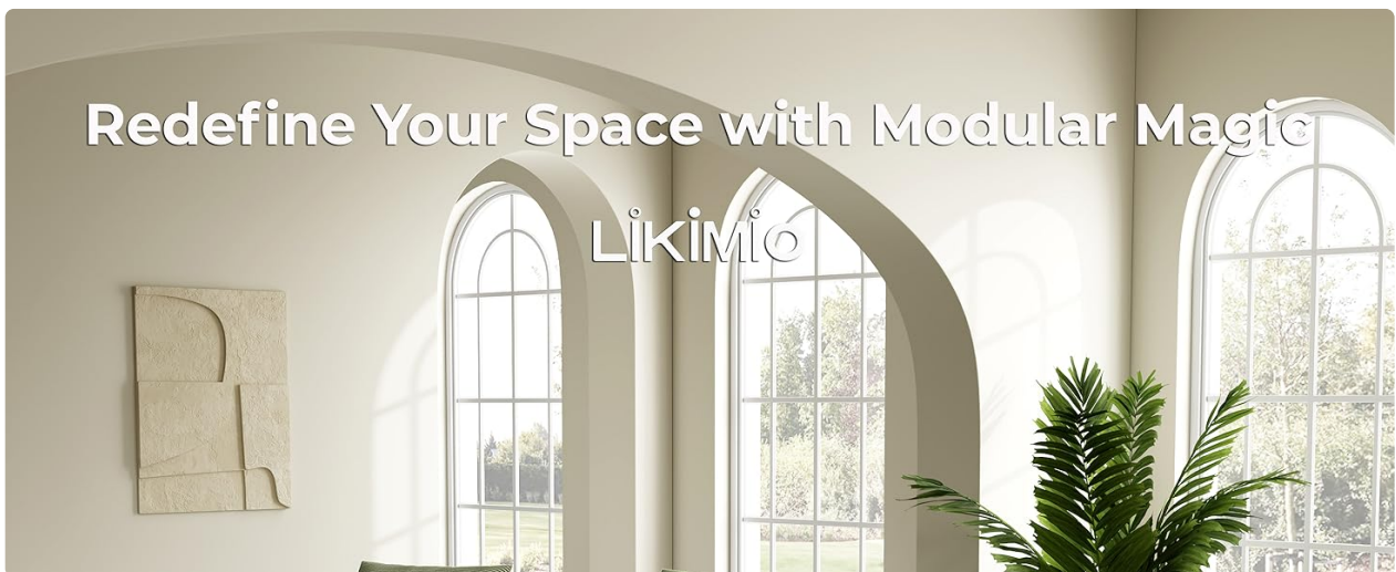
Image: The LIKIMIO LumiCord Modular Sectional Sofa with Ottoman, showcasing its deep seat and corduroy upholstery.

Thank you for choosing the LIKIMIO LumiCord Modular Sectional Sofa with Ottoman. This manual provides essential information for the safe and effective use, setup, and maintenance of your new furniture. Please read it thoroughly before proceeding.