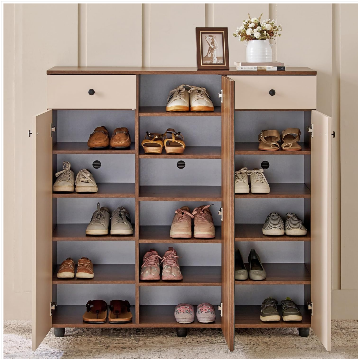
Figure 4: The shoe cabinet with its doors open, revealing multiple pairs of shoes neatly stored on the internal shelves. This illustrates the internal layout and capacity.