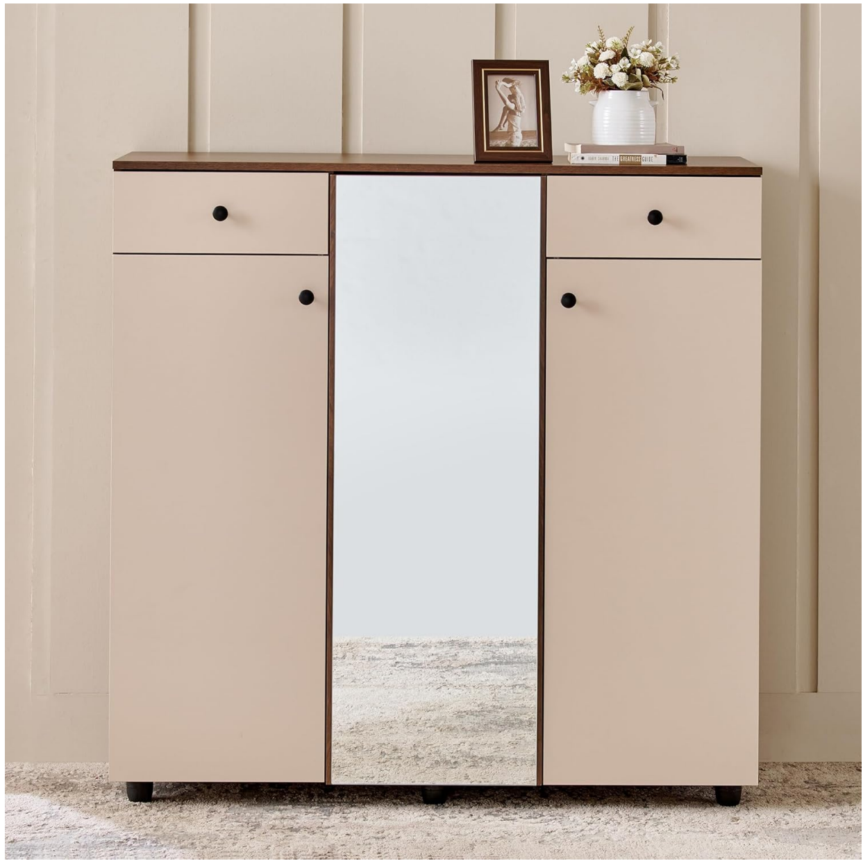
Figure 2: A clean front view of the Home Centre Addison Shoe Cabinet in its closed state, highlighting the walnut finish and the central mirror.