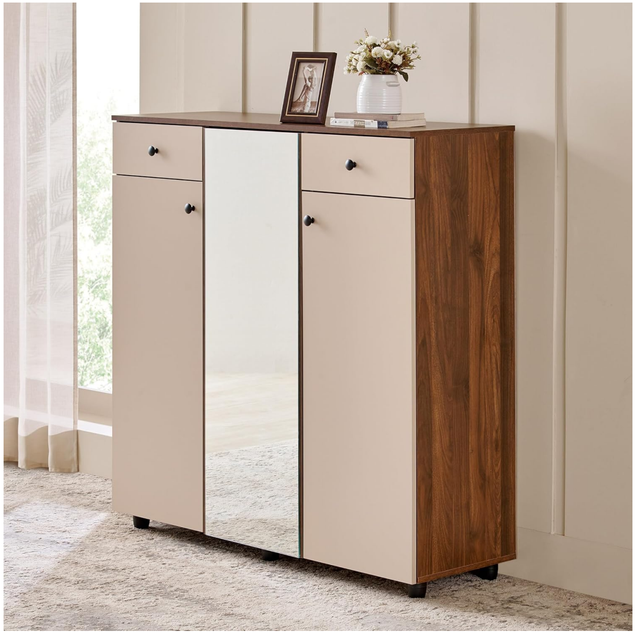
Figure 1: Front view of the Home Centre Addison Shoe Cabinet. This image displays the overall design, including the two side doors, the central mirrored door, and the two top drawers.