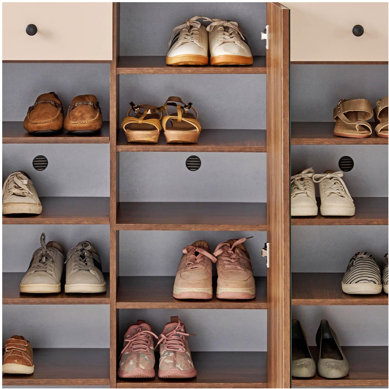
Figure 5: A closer view of the shoe shelves, showing various types of footwear organized within the compartments. Note the ventilation holes at the back of each compartment.