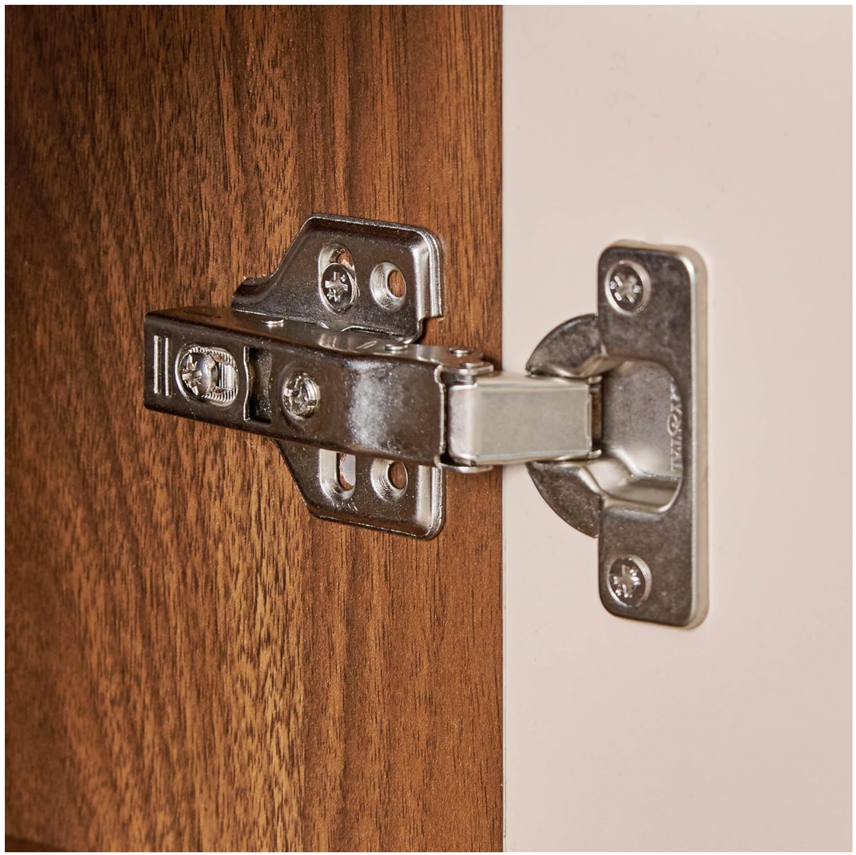
Figure 3: Detail of a door hinge. Proper installation and adjustment of hinges are crucial for door alignment and smooth operation.