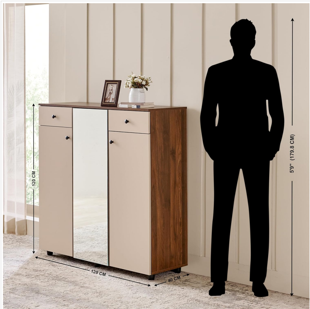
Figure 6: Dimensional view of the shoe cabinet, showing its height (120 cm), width (120 cm), and depth (40 cm) in relation to an average adult figure.