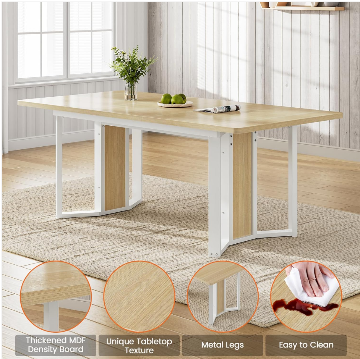
Image: Close-up of the tabletop demonstrating its easy-clean surface, with a liquid spill being wiped away.