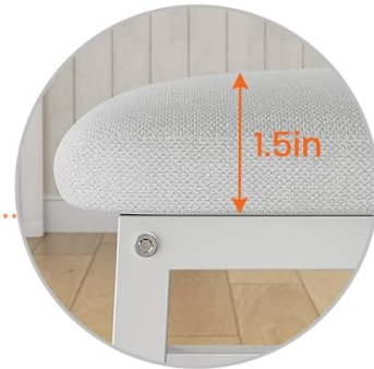
1.5in Thick Cushion

Image: Detailed view of a chair, showing the cozy upholstered seat and padded backrest, with a 1.5-inch thick cushion.