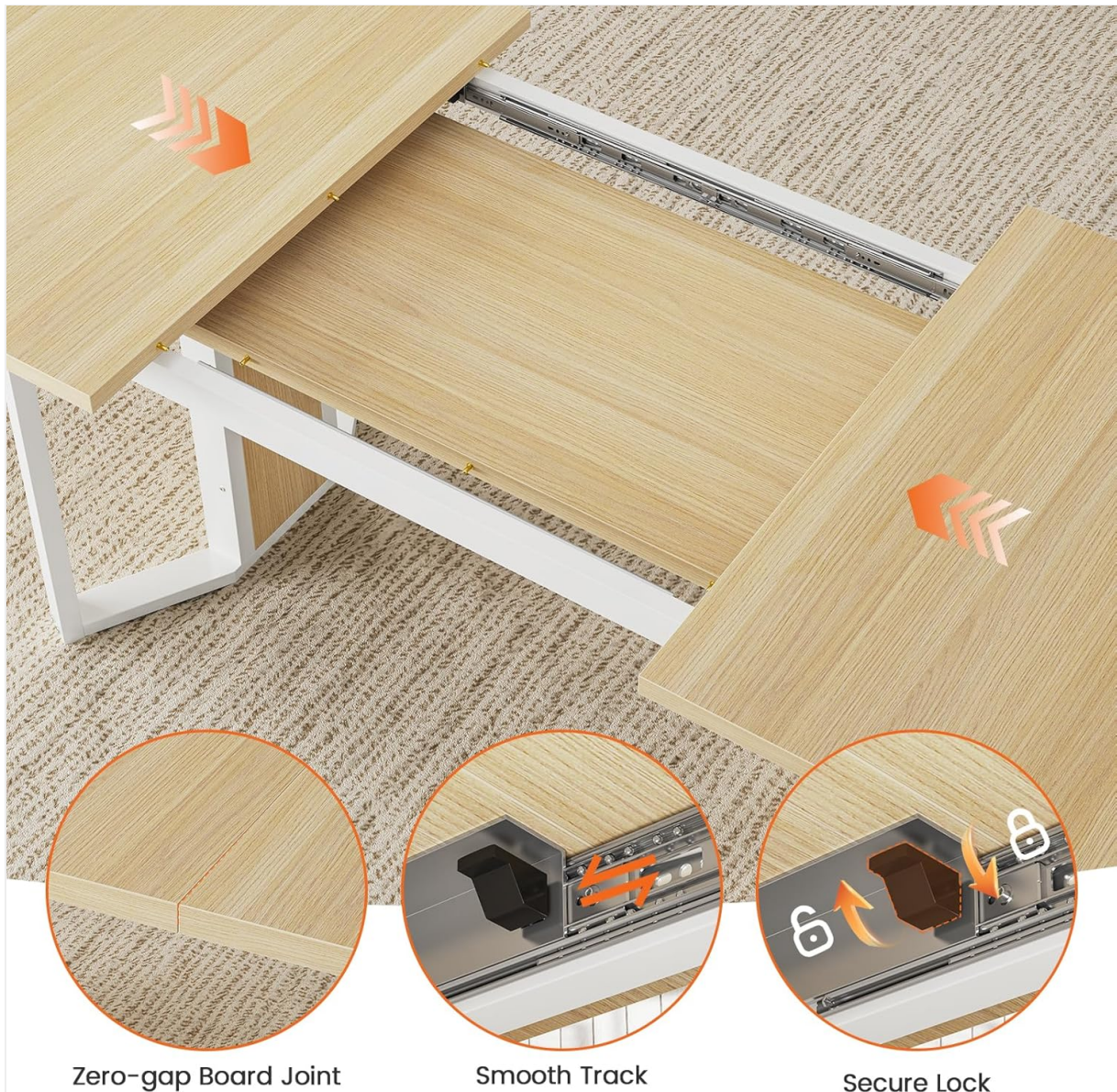
Image: Close-up of the table's extension mechanism, highlighting the zero-gap board joint, smooth track for extension, and the secure locking feature.

Your browser does not support the video tag.