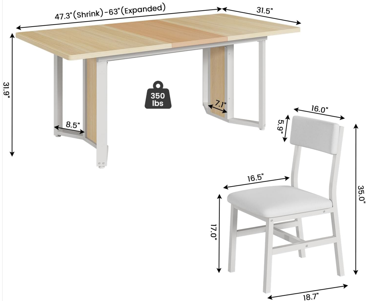
Image: Diagram illustrating the dimensions of the dining table (shrunk and expanded) and the dining chairs, along with the table's weight capacity.