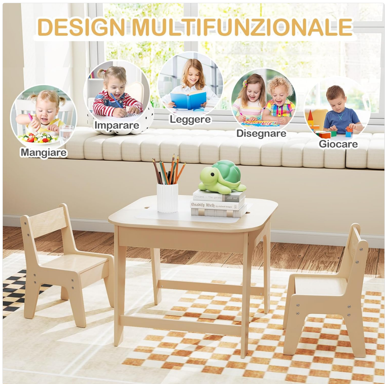
Figure 4: Multifunctional Design. The table and chairs set supports a wide range of activities for children, from eating and learning to drawing and playing, making it a versatile addition to any room.