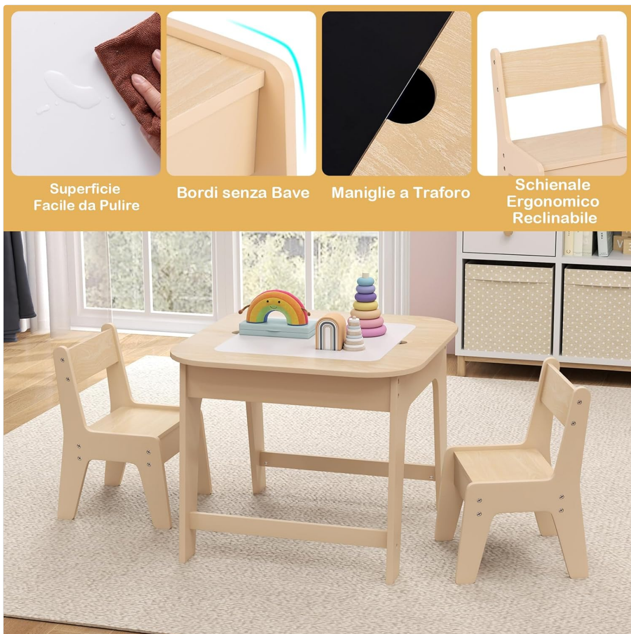
Figure 5: Key Features for Maintenance and Safety. The set features an easy-to-clean surface, smooth, burr-free edges, convenient handles for the tabletop, and an ergonomically designed chair backrest for comfort and safety.