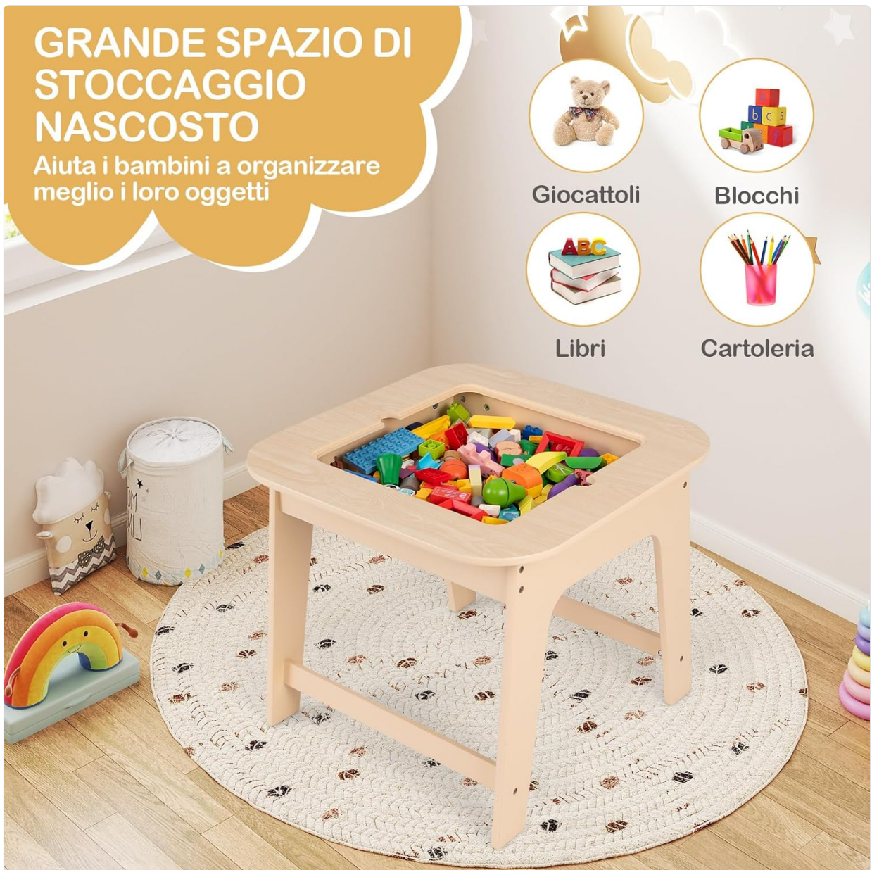
Figure 3: Hidden Storage. The table features a convenient hidden compartment under the tabletop, perfect for storing toys, books, and art supplies, helping children keep their space organized.

Aiuta i bambini a organizzare meglio i loro oggetti