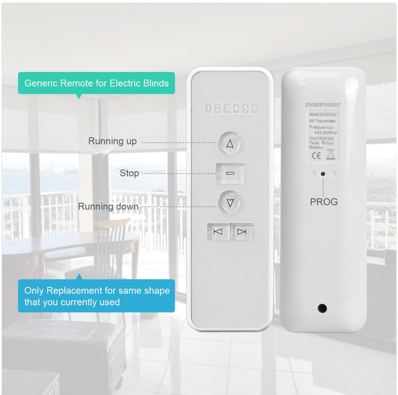
Figure 2.2: Detailed view of the AC123-06D remote control, illustrating the primary control buttons for upward movement, stopping, and downward movement, along with the programming (PROG) button on the back.