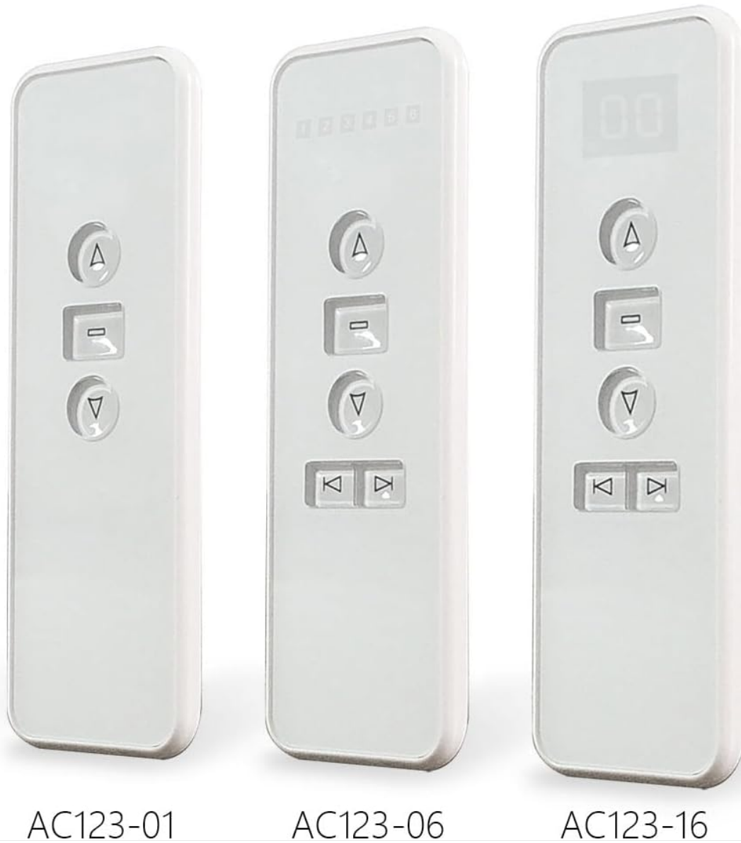
Figure 4.1: Overview of the AC123 series transmitters, demonstrating the different channel options available (1-channel, 6-channel, and 16-channel) for varied control needs.