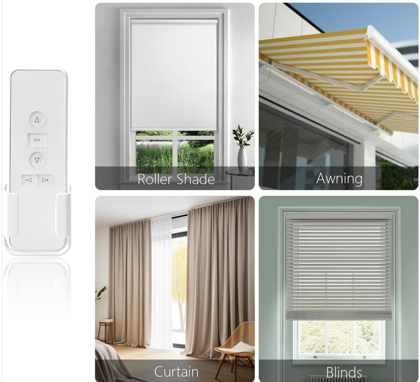
Figure 4.2: Illustrations of various compatible devices, including roller shades, awnings, curtains, and blinds, highlighting the transmitter's broad applicability.