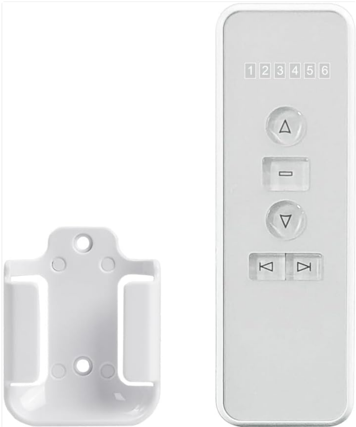
Figure 2.1: Front view of the AC123-06D RF Transmitter with its included wall mount bracket.