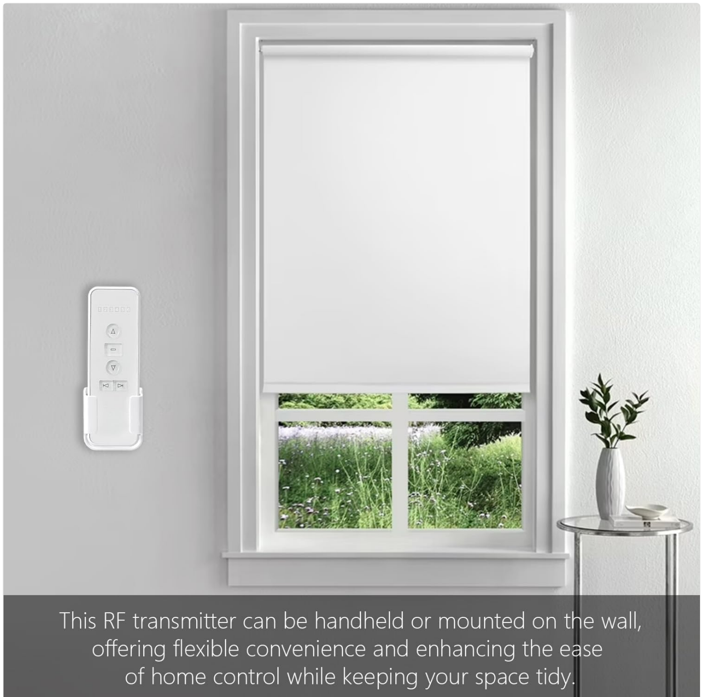
Figure 5.1: The AC123-06D remote control shown in its wall-mounted bracket, demonstrating flexible placement options for user convenience.