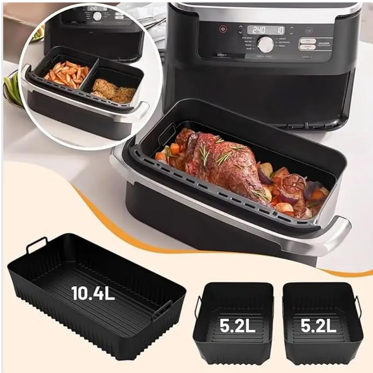
Image 4.1: The silicone liners in practical use within an air fryer, demonstrating how they accommodate different food items in both the single large compartment and the two smaller split compartments.