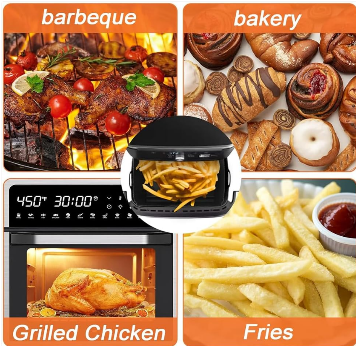
Image 4.2: Examples of diverse culinary applications for the Enegg silicone liners, including barbecue, baking, grilling chicken, and preparing fries.