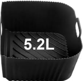
Image 2.1: The Enegg silicone liners demonstrating their fit within the Ninja Foodi Flexdrawer, both as a single 10.4L unit and as two separate 5.2L compartments.