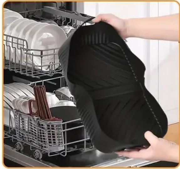
Image 5.1: Demonstration of the ease of cleaning the Enegg silicone liners, showing both hand washing under a faucet and placement in a dishwasher.