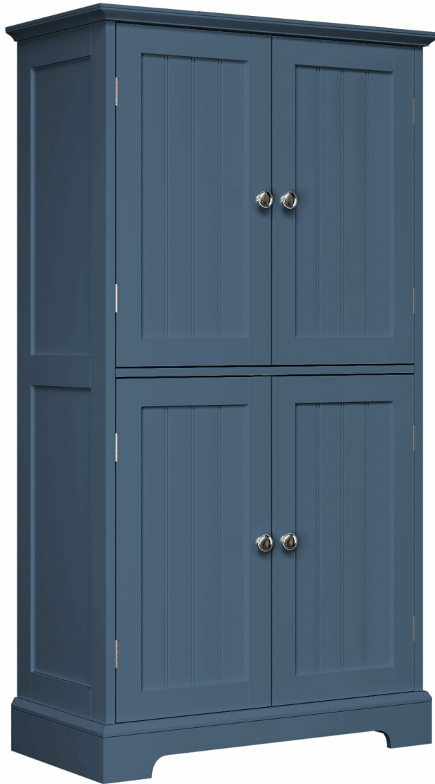
Image 1.1: ChooChoo Bathroom Floor Cabinet (Model SC2404-BU) in a bathroom setting.