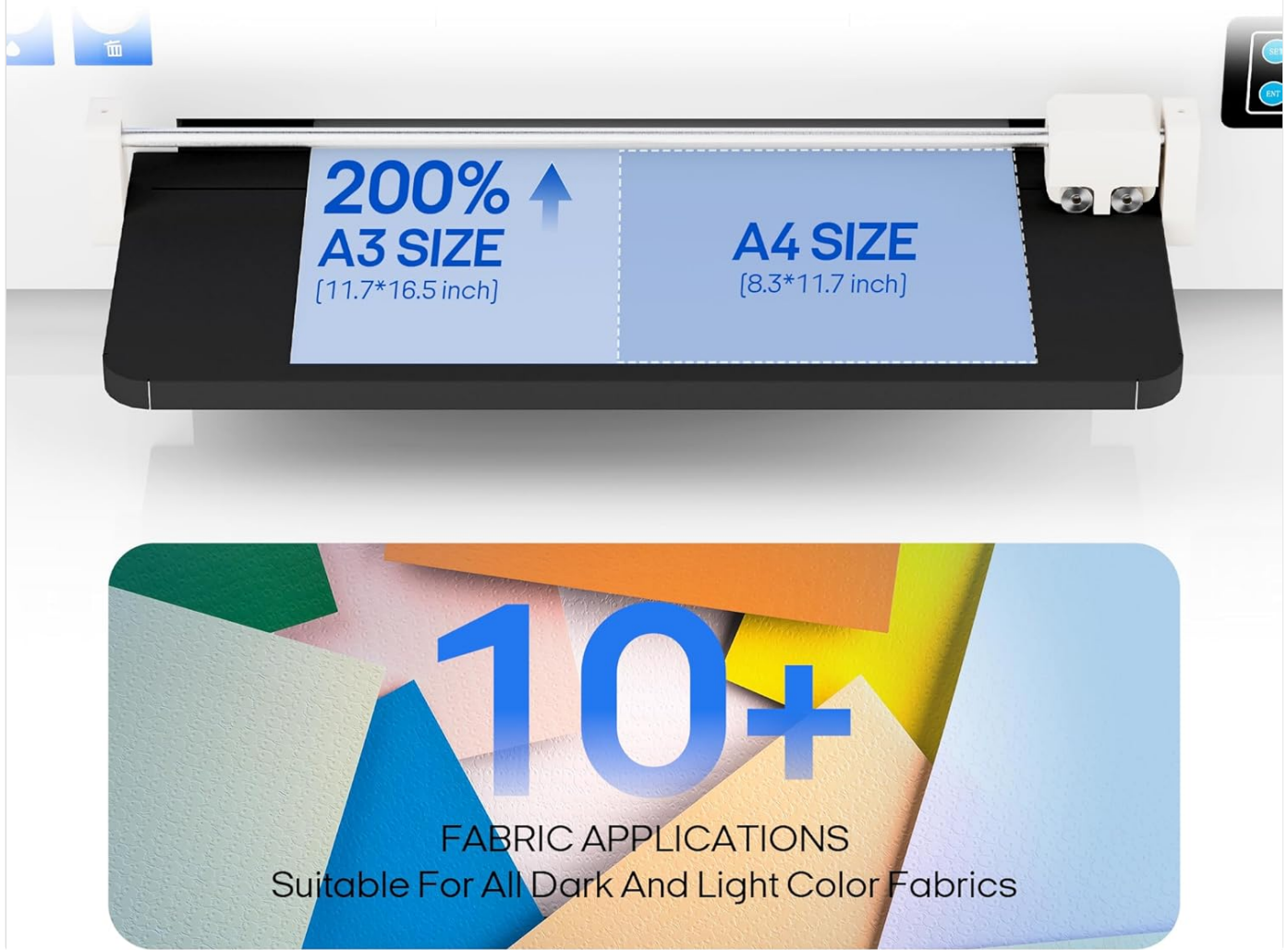
Image: The PUNEHOD L1800 DTF Printer with the roll feeder correctly installed.

Please select the correct model according to your needs