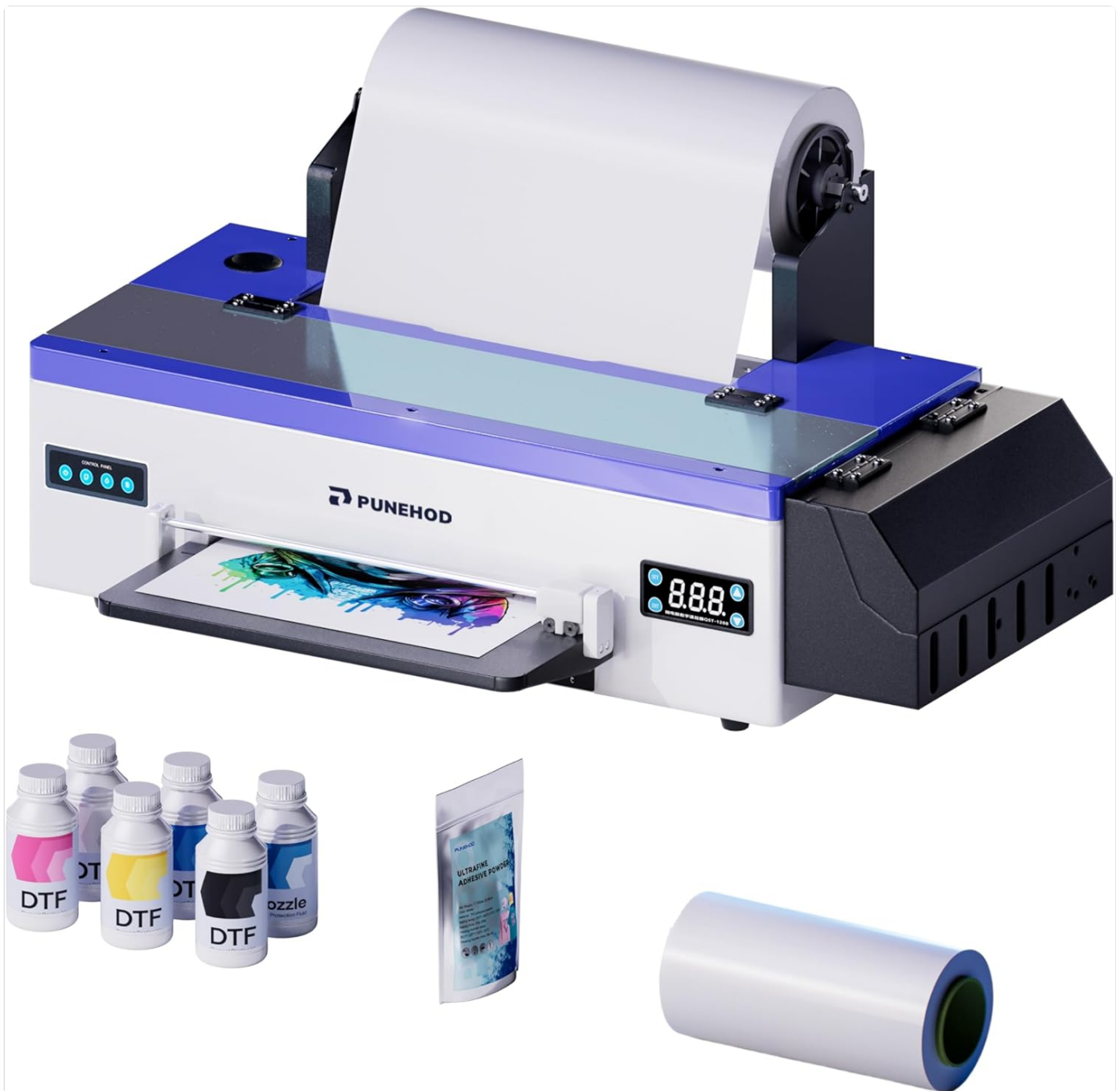
Image: A close-up view of the ink tanks on the PUNEHOD L1800 DTF Printer, showing the CMYK+WW configuration.