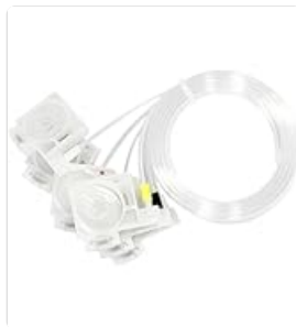
Image: Illustration of the waste ink bottle and associated tubing, highlighting the importance of regular cleaning.

The waste ink bottle collects excess ink from cleaning cycles. Regularly check and empty the waste ink bottle to prevent overflow. Keep the area around the waste ink bottle clean.