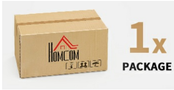
Image: A cardboard package indicating "1x PACKAGE" for the HOMCOM recliner chair.

Before beginning assembly, ensure all parts are present and undamaged. If any parts are missing or damaged, do not proceed with assembly and contact customer support.