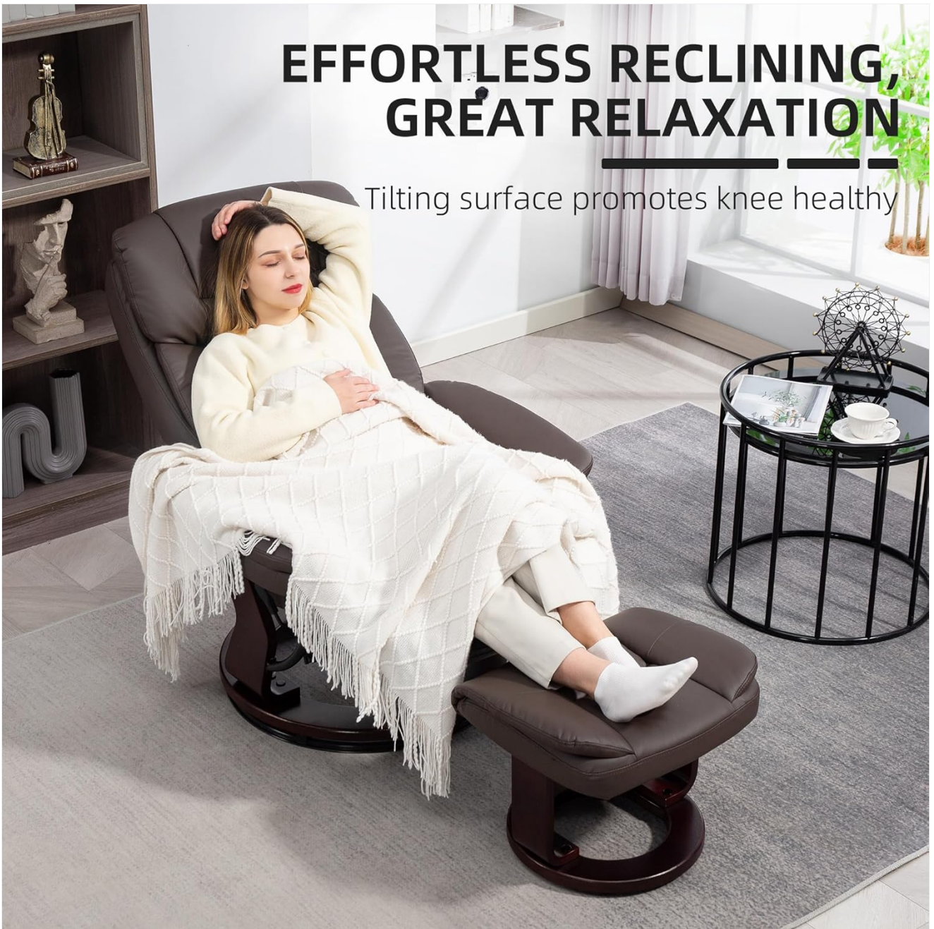
Image: A person demonstrating the reclined position of the chair, with feet comfortably resting on the ottoman.