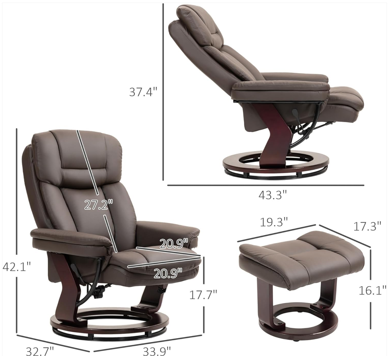
Image: A diagram illustrating the dimensions of the recliner chair and ottoman, useful for understanding component sizes during assembly.