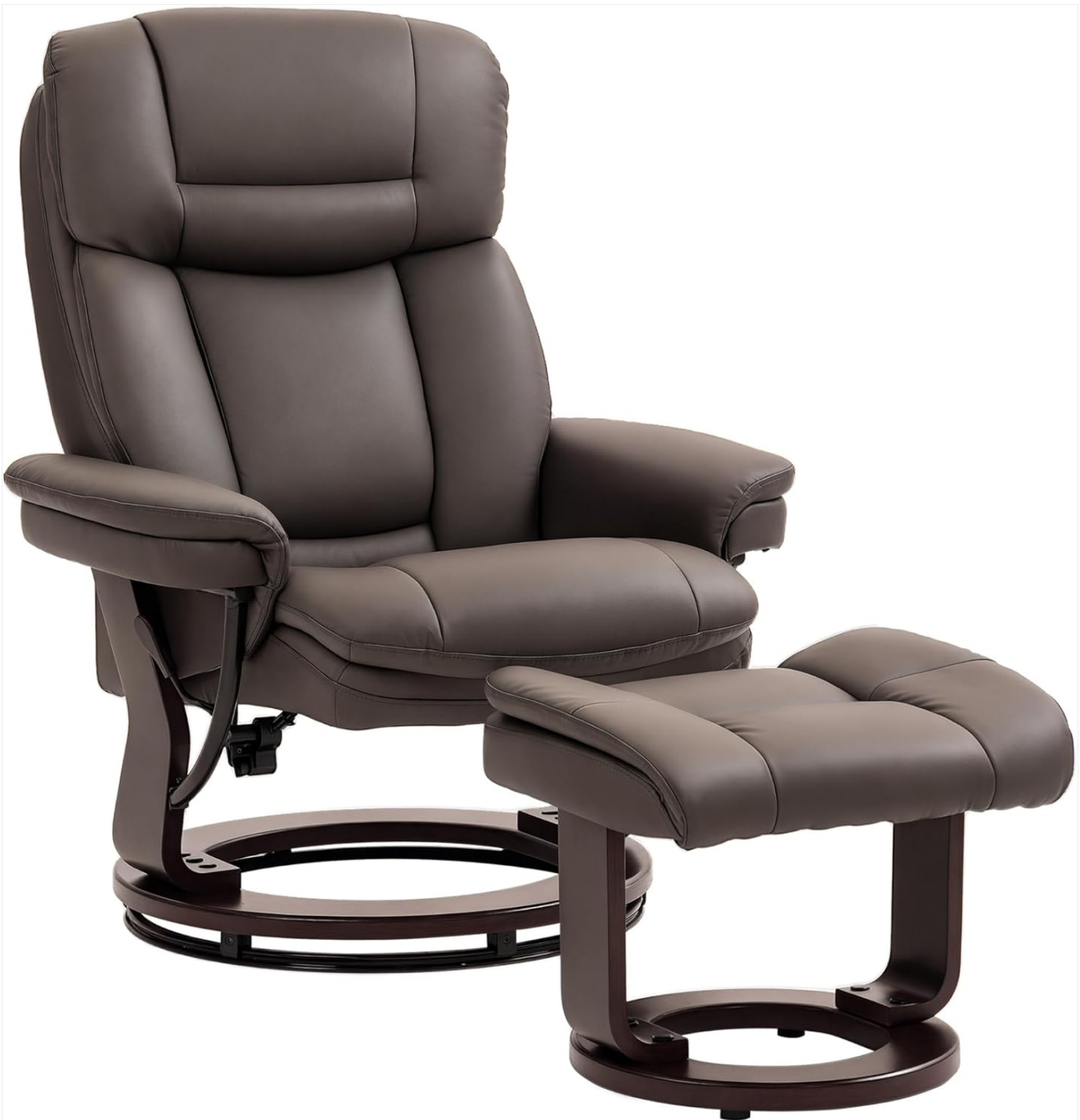
Image: The HOMCOM Swivel Recliner Chair with Ottoman, showcasing its dark brown faux leather upholstery and wooden base.