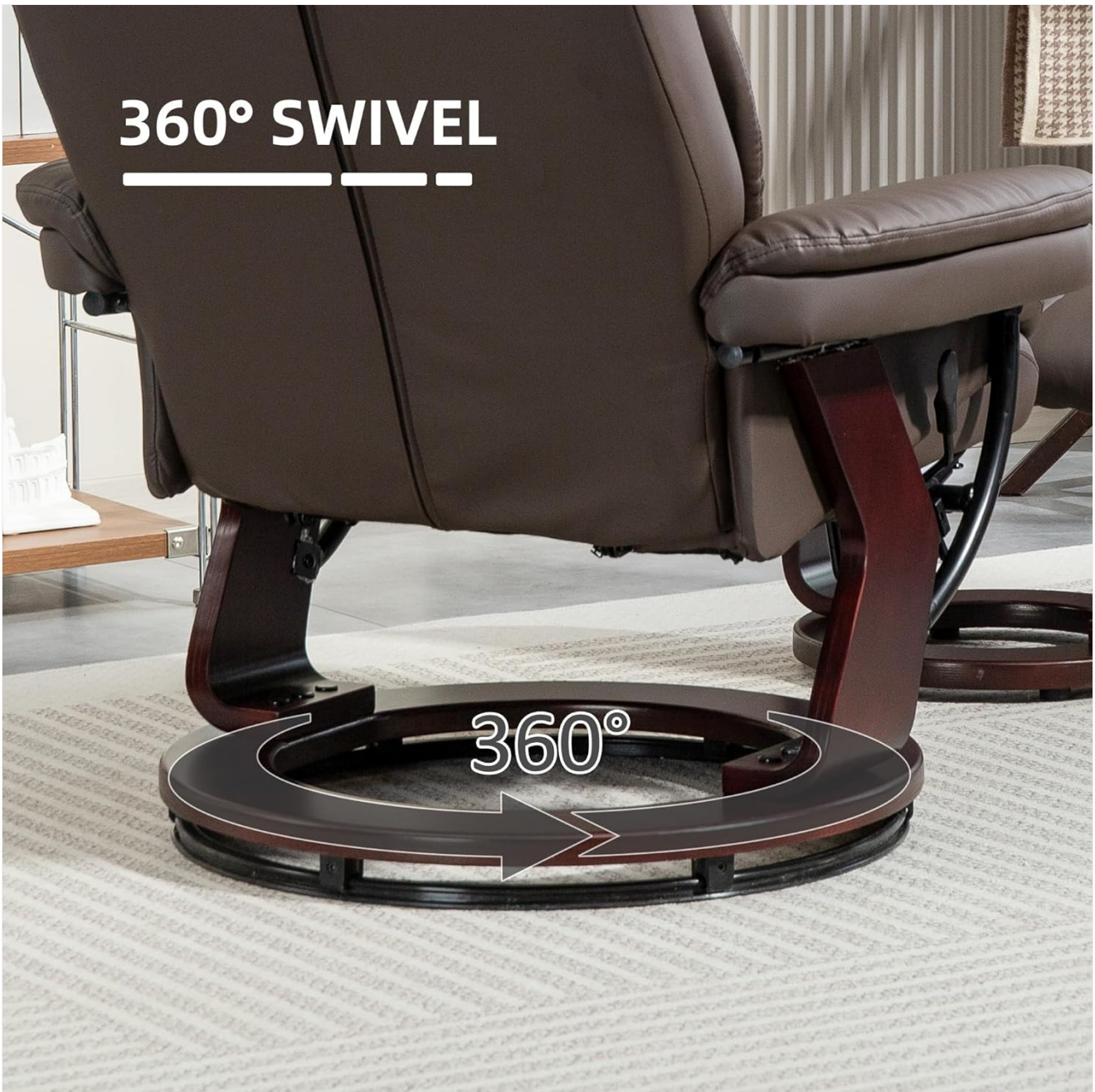
Image: A detailed view of the chair's base, highlighting its 360-degree swivel capability.