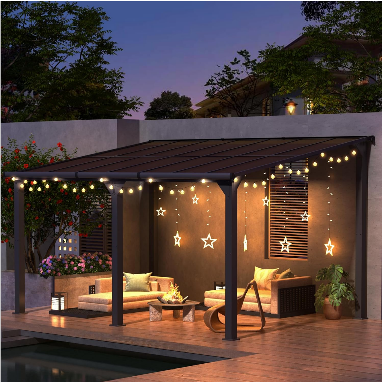
Figure 3: The pergola provides an ideal setting for evening relaxation.