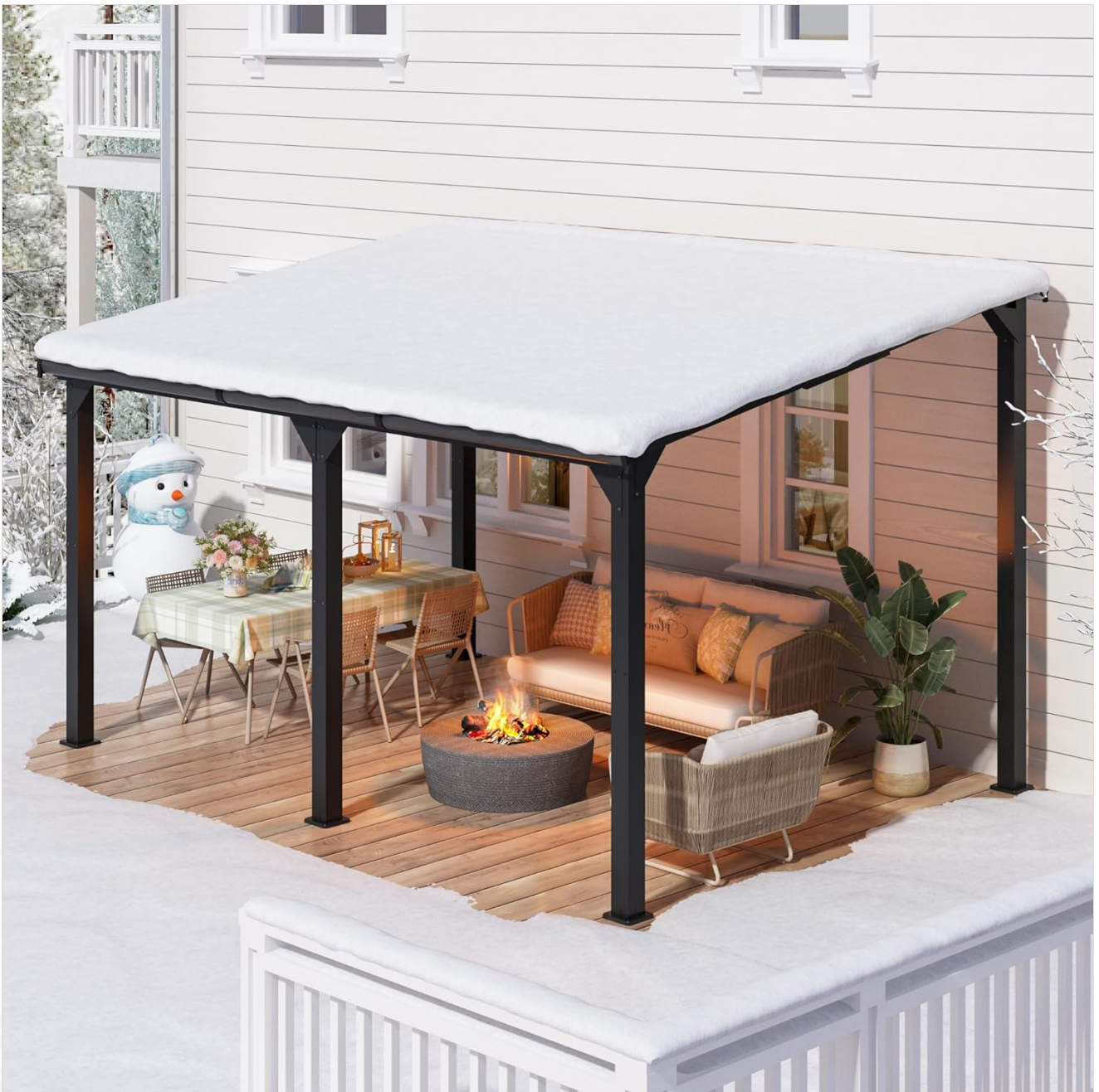
Figure 6: The robust construction allows the pergola to withstand accumulated snow.