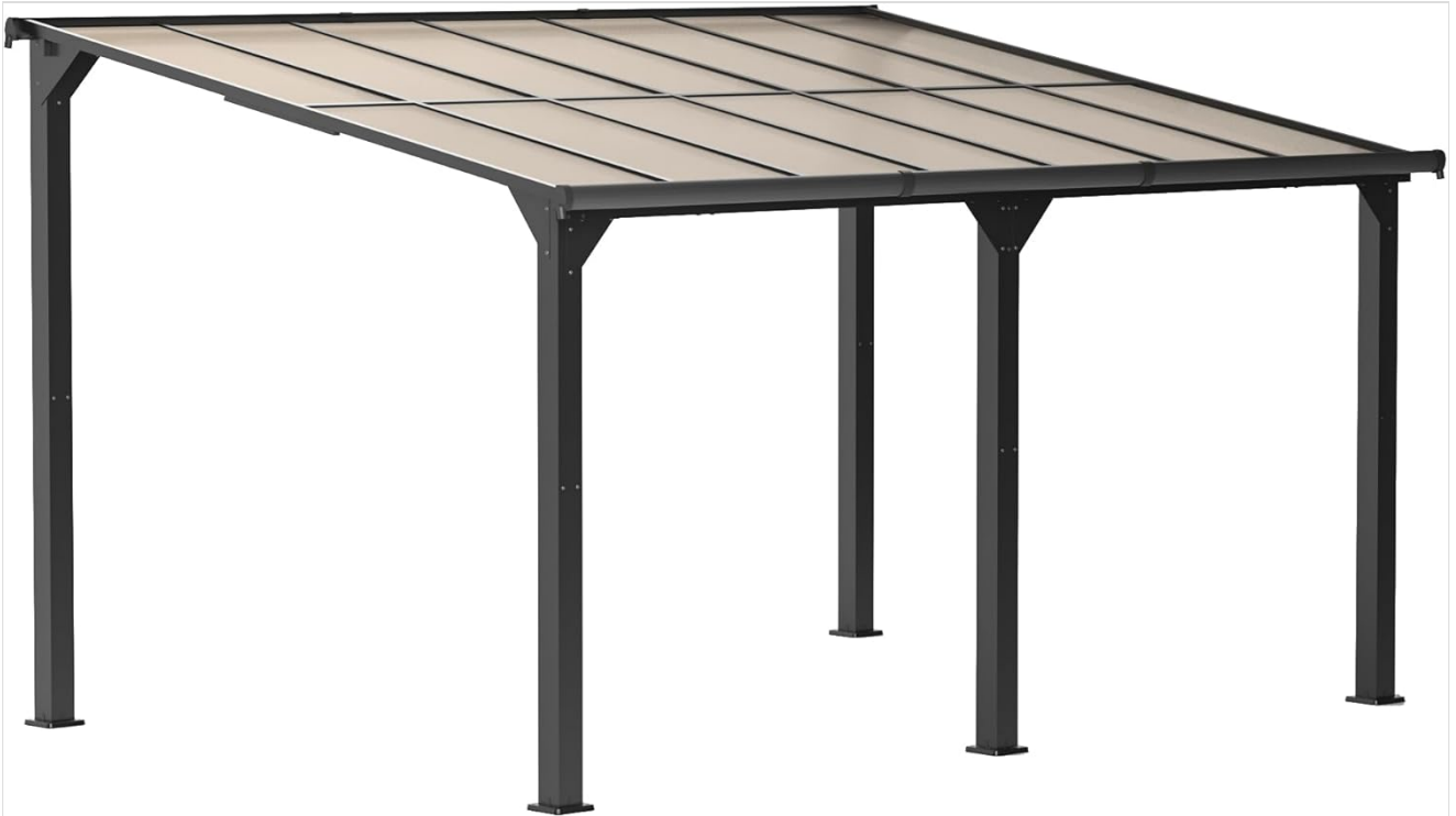
Figure 1: Basic frame structure of the pergola during assembly.