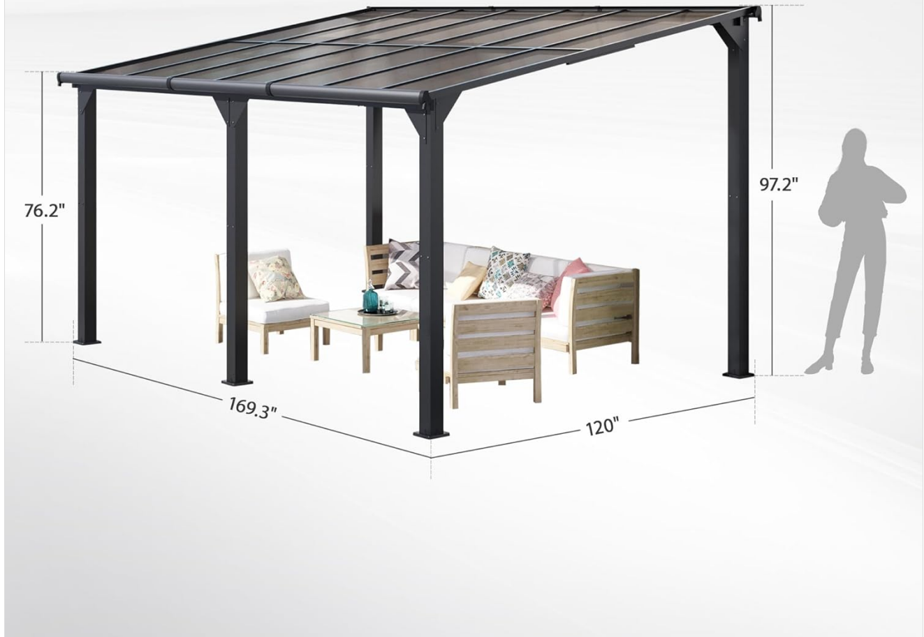
Figure 7: Detailed dimensions of the HOGYME Outdoor Lean-to Pergola.