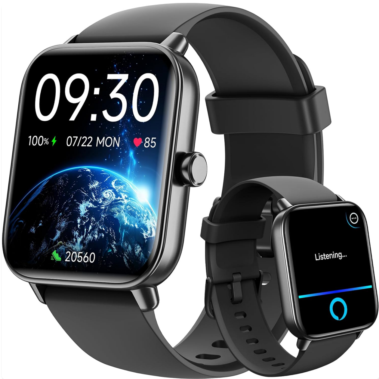
Image: Gydrom IDW19 Smart Watch with its magnetic charging cable.