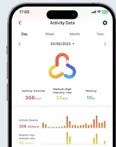
Image: The smartwatch interface showing different sports modes and daily activity statistics.