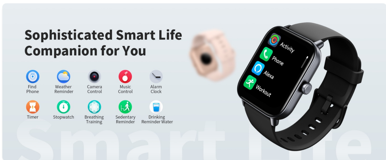
Image: Smartwatch displaying call and message notifications, and the Alexa voice assistant interface.