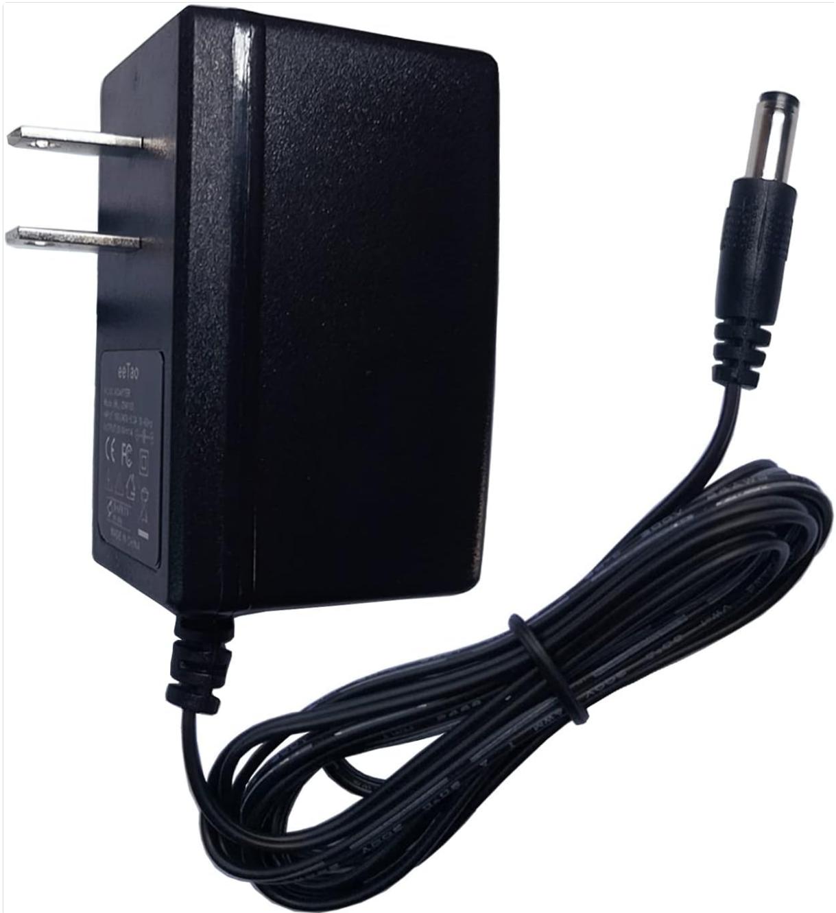
Image 3.1: A detailed view of the eeTao 21V Replacement Charger, highlighting its compact design and the barrel connector for battery charging.