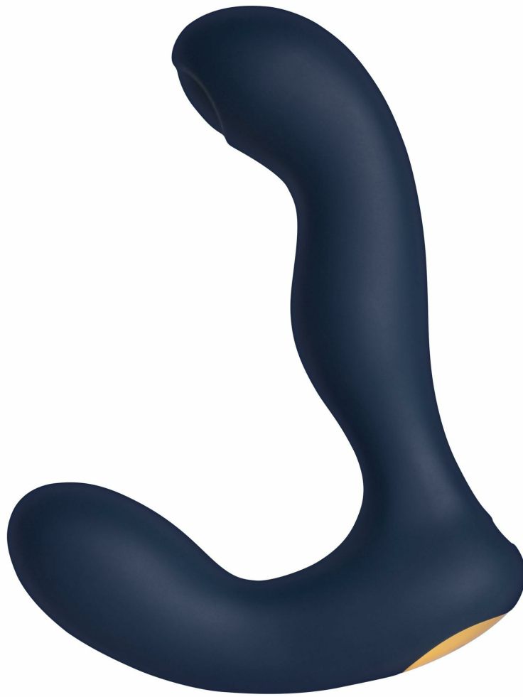
Figure 1: SVAKOM Iker Neo Prostate Vibrator, Navy Blue/Gold. This image shows the overall design and color of the product.