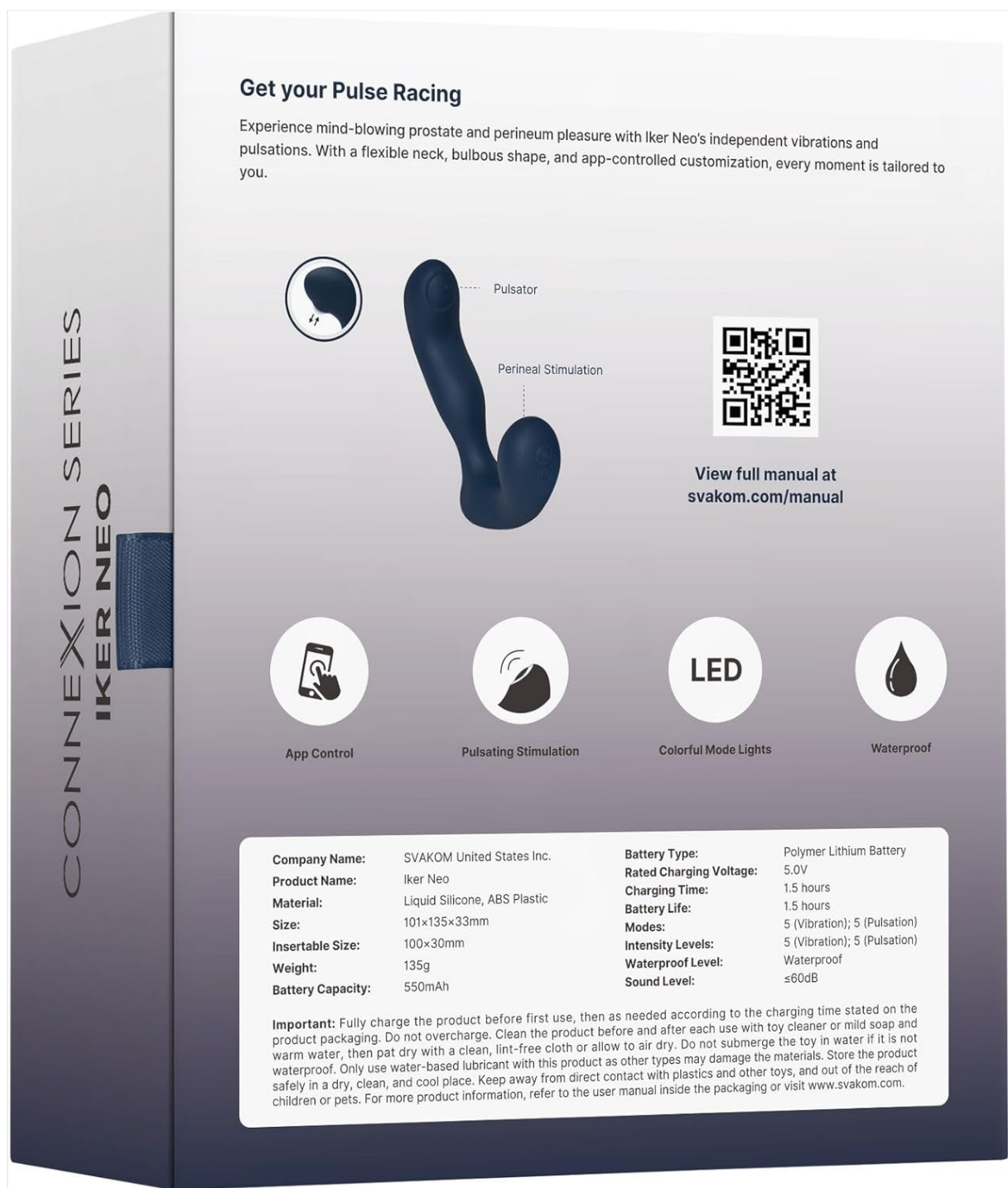
Figure 3: The SVAKOM Iker Neo connected to its magnetic USB charging cable, illustrating the charging process.