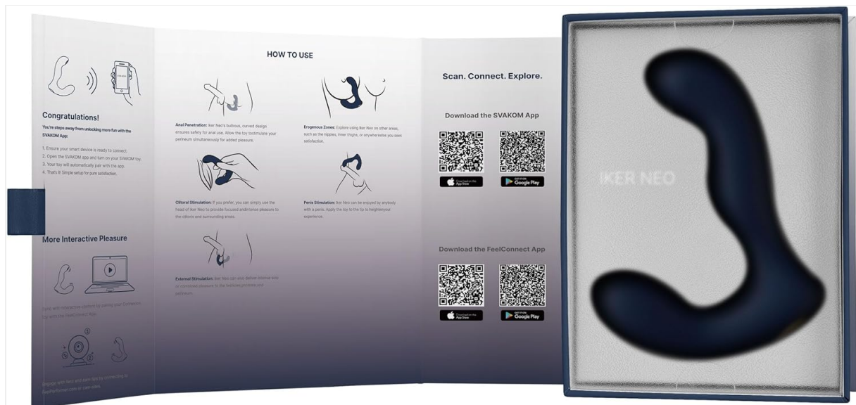
Figure 5: Open box view of the Svakom Iker Neo, showing instructions for app download and various usage methods.

Download the Svakom App: svakom.com/manuals