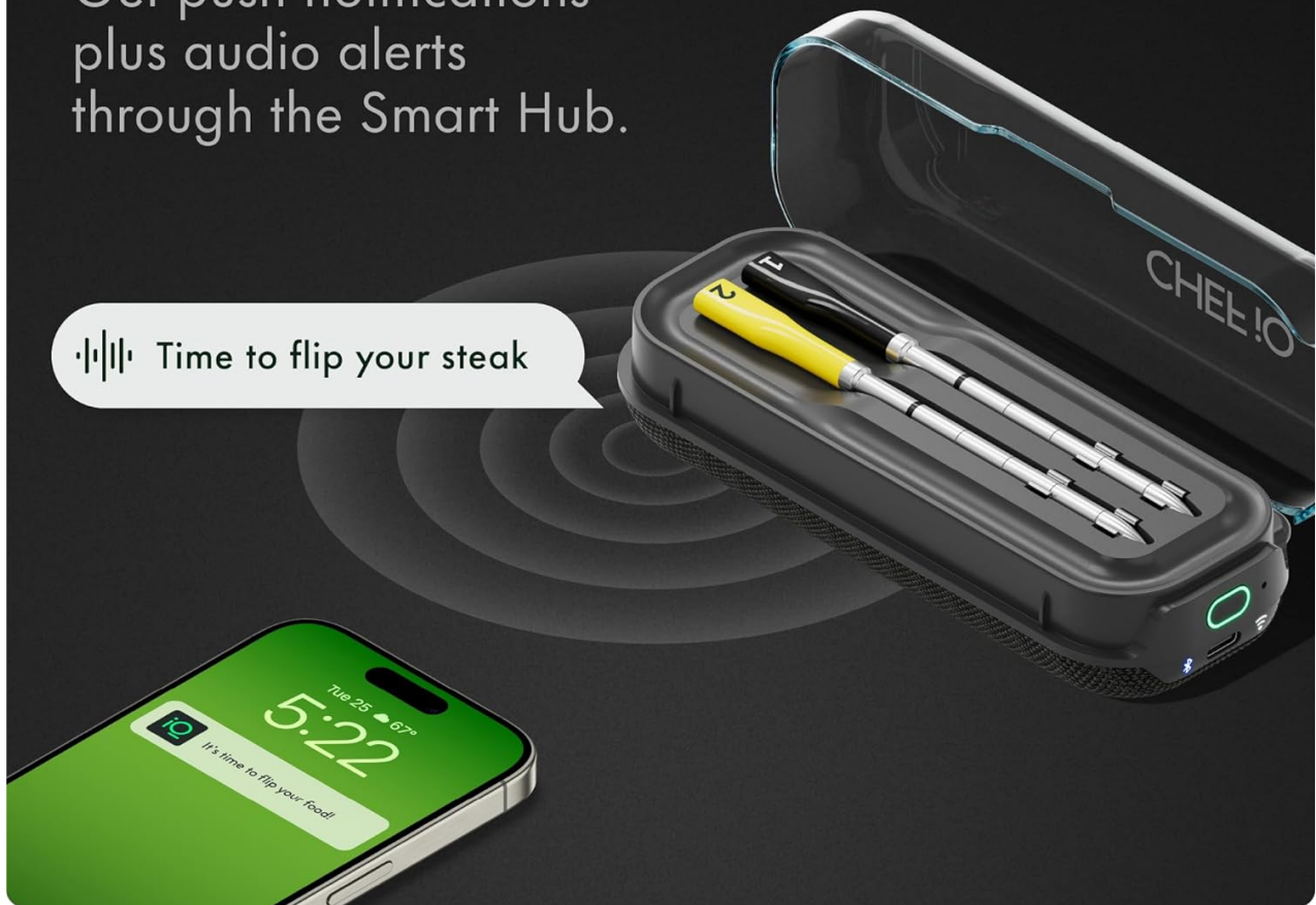
Figure 4: Smart Hub and app notifications.

Get push notifications plus audio alerts through the Smart Hub.