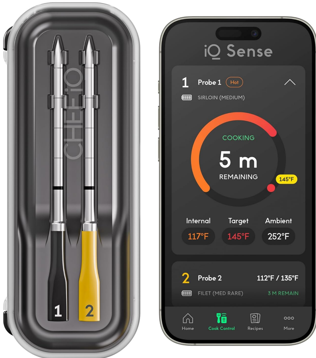
Figure 1: CHEF iQ Sense Thermometer with Smart Hub and App Interface.