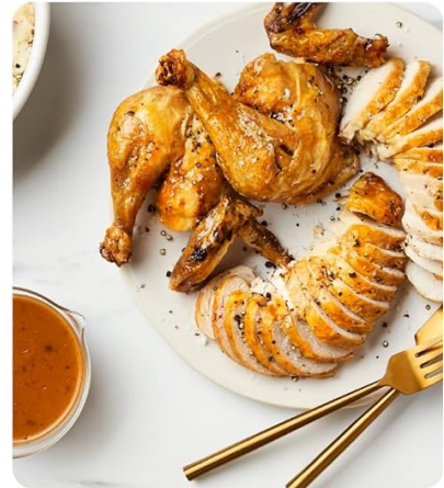
Figure 5: Versatility across cooking methods.