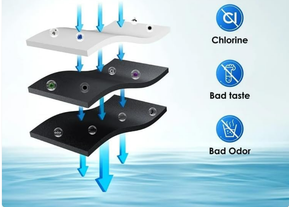
Image: A diagram illustrating the multi-stage filtration process. It shows water flowing downwards through different layers, effectively reducing substances like chlorine, elements causing bad taste, and sources of bad odor, resulting in purified water.

Reduce heavy metals and other impurities