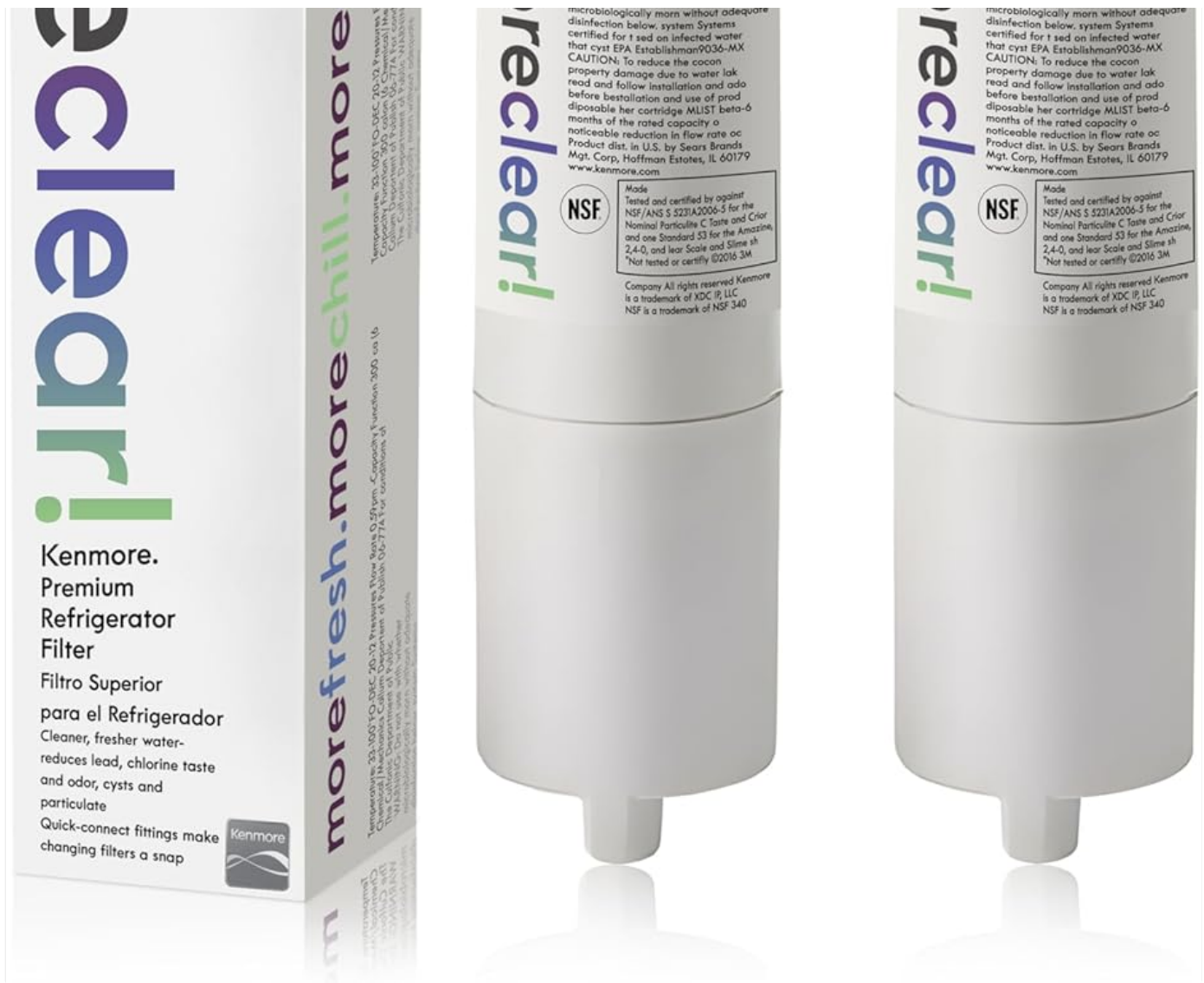
Image: The GOTICAL Kenmore Clean Water Filter 9990, shown both in its retail packaging and as two individual filter units. This illustrates the product as it would appear upon purchase and ready for installation.