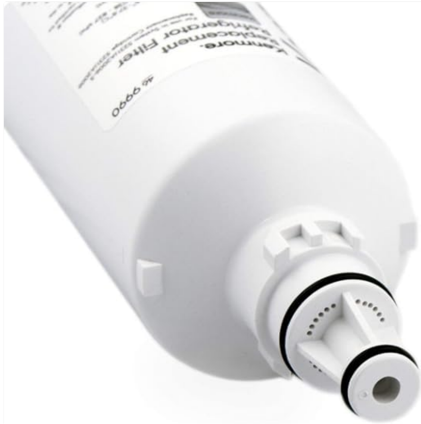
Image: A detailed view of the filter's connection end, highlighting the O-rings and internal structure. This part connects directly into the refrigerator's water line.