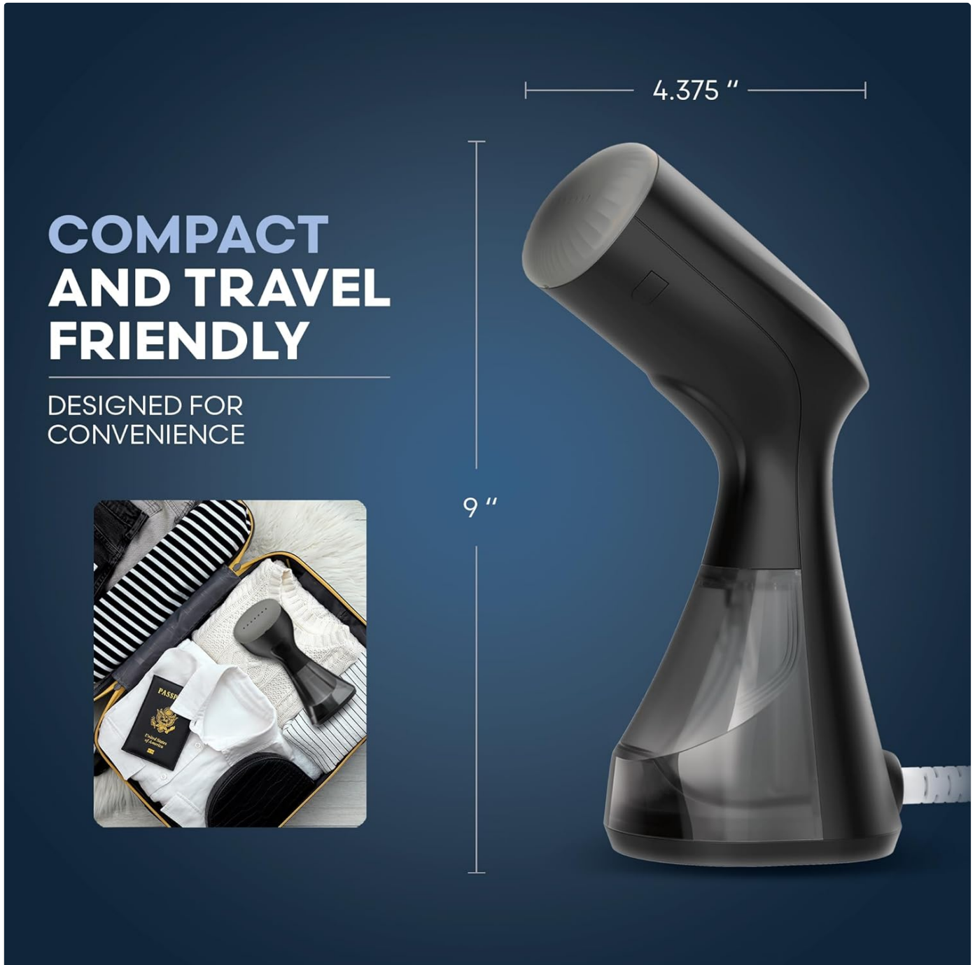
Image 6.1: The compact steamer shown with its dimensions (4.375" x 9") and packed in a suitcase, illustrating its travel-friendly design.