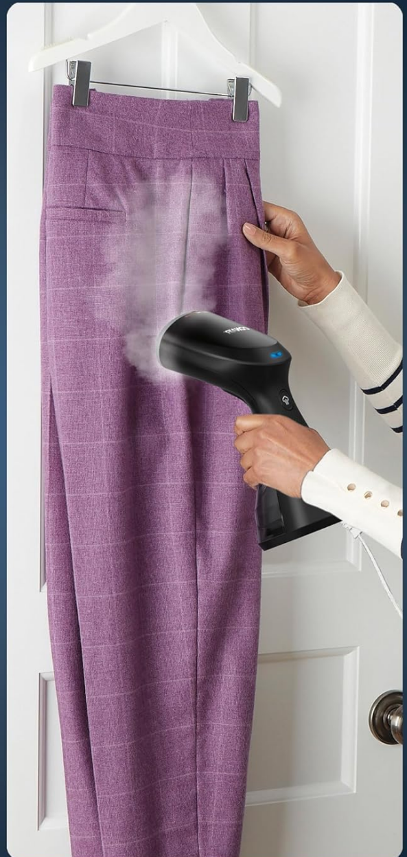
Image 5.1: Demonstrates the ease of use and maneuverability of the steamer on a pair of pants, highlighting its lighter design compared to