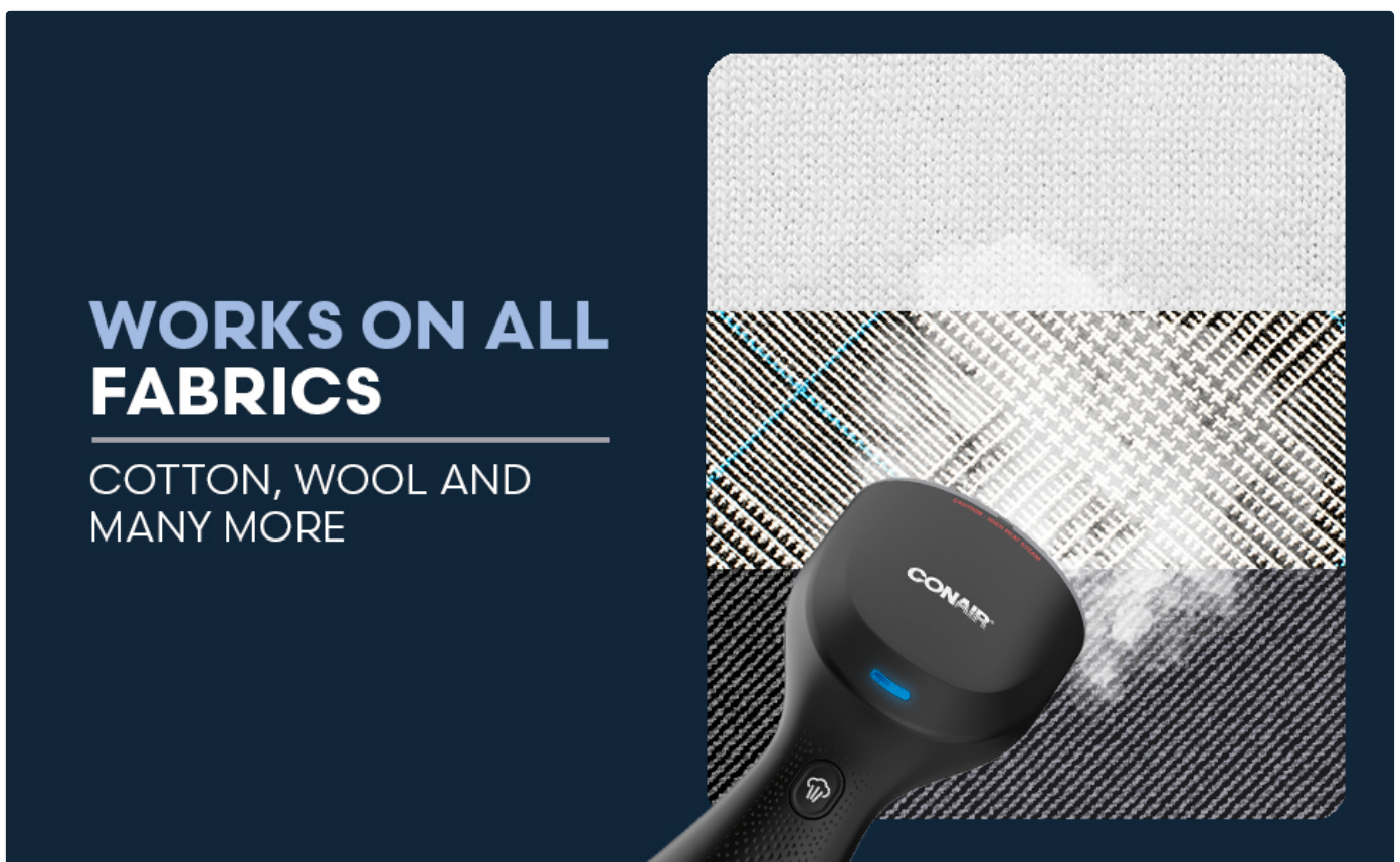
Image 5.3: The steamer head positioned over different fabric textures, indicating its suitability for cotton, wool, and other materials.