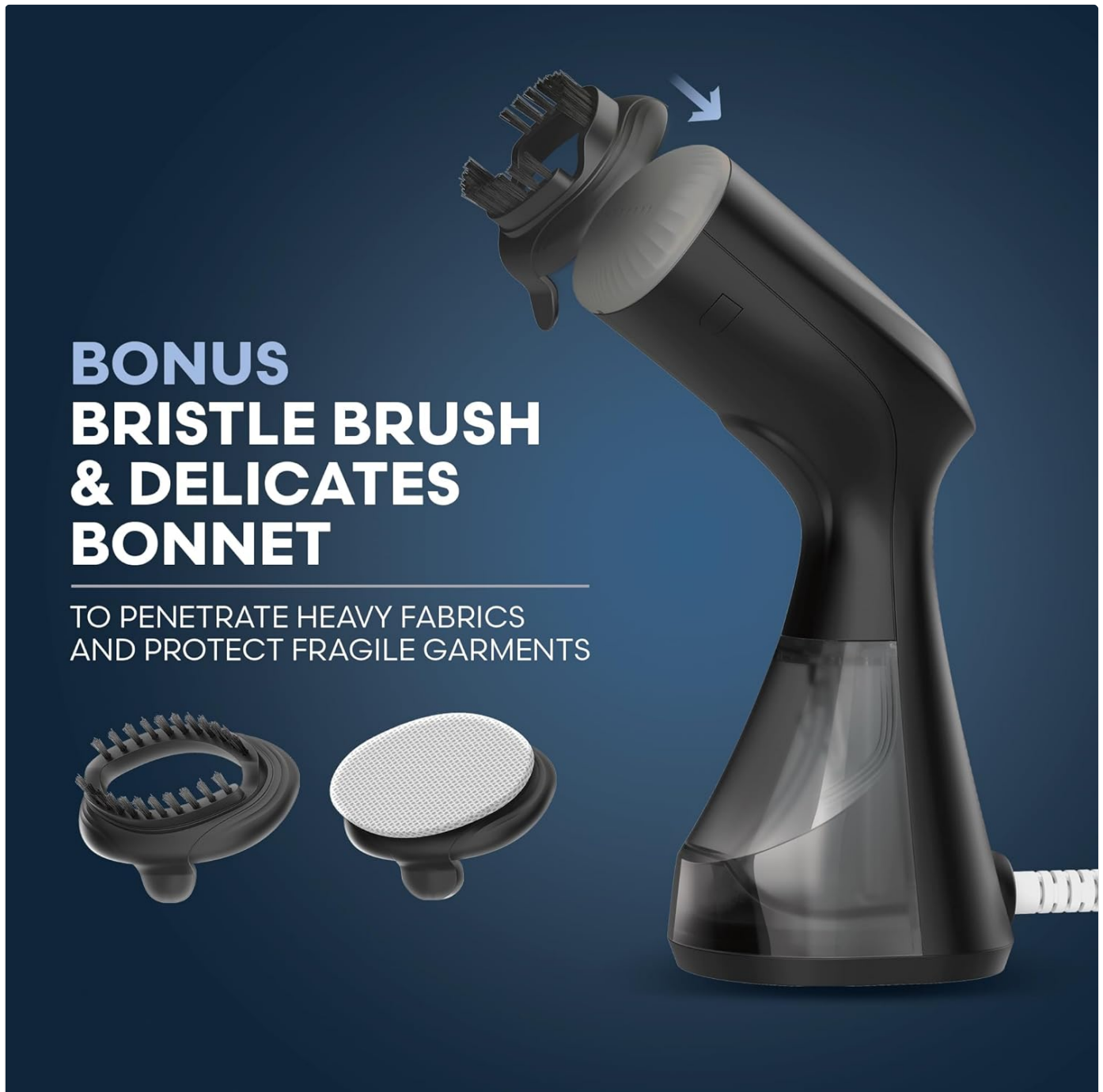
Image 3.1: The steamer unit with its two included attachments: a bristle brush for heavier fabrics and a delicates bonnet for gentle fabrics.