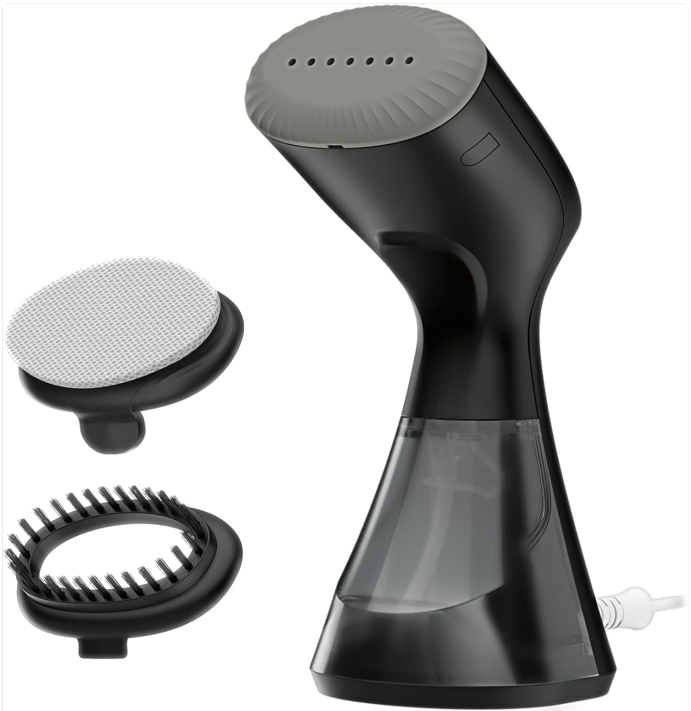
Image 1.1: The Conair Compact Garment Steamer shown with its included bristle brush and delicates bonnet attachments.