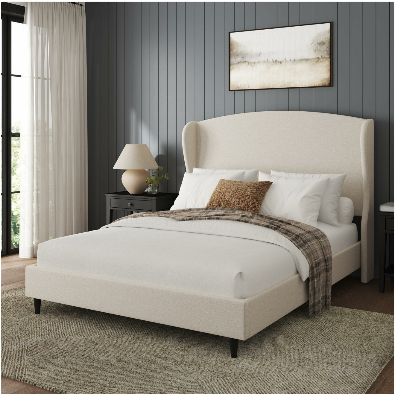
Image 1.1: The Valencia Wingback Platform Bed Frame, Queen, Cream Linen, assembled in a bedroom.

Key features include a low-profile wooden frame with metal rails and steel inner legs for superior support, and a pre-assembled rolled plywood slat base for easy installation. The modern design is completed with tapered plastic front legs and fully upholstered back legs.