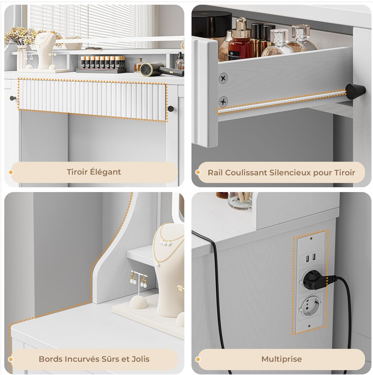
Figure 5: Detail view showing the elegant drawer, smooth silent sliding rails, safe rounded edges, and the integrated power strip with AC outlets and USB ports.