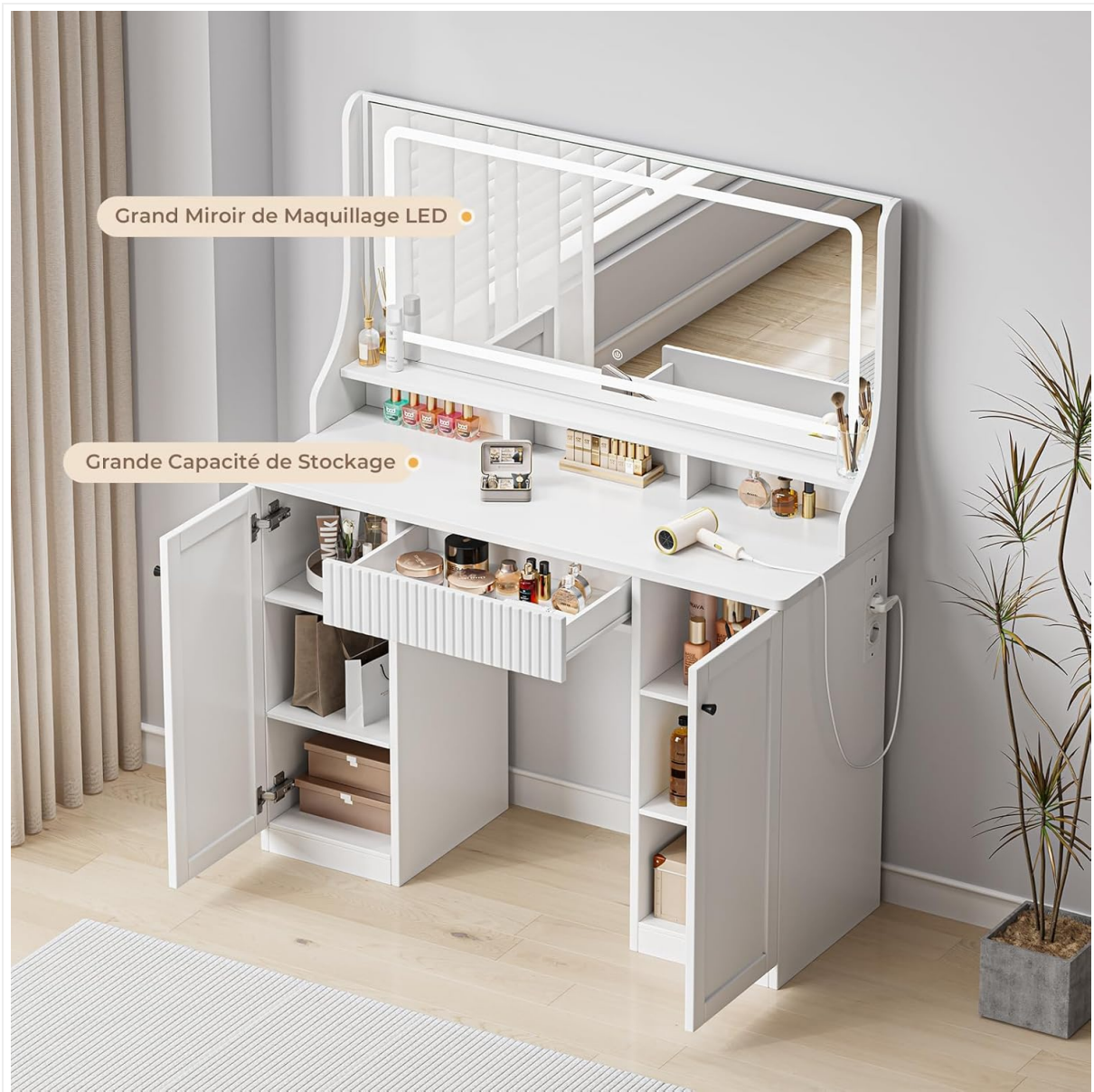
Figure 6: The vanity table with its central drawer and side cabinets open, demonstrating the extensive storage capacity for various items.