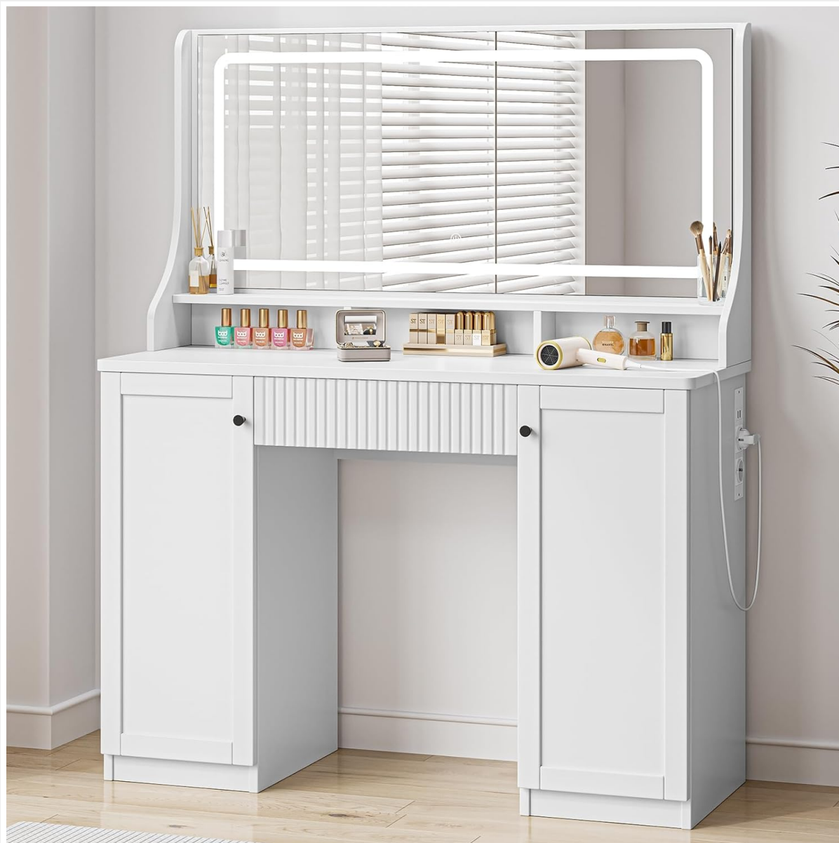
Figure 1: Front view of the Dripex LED Mirror Vanity Table. This image displays the complete vanity table with its large LED mirror, central drawer, and two side cabinets.