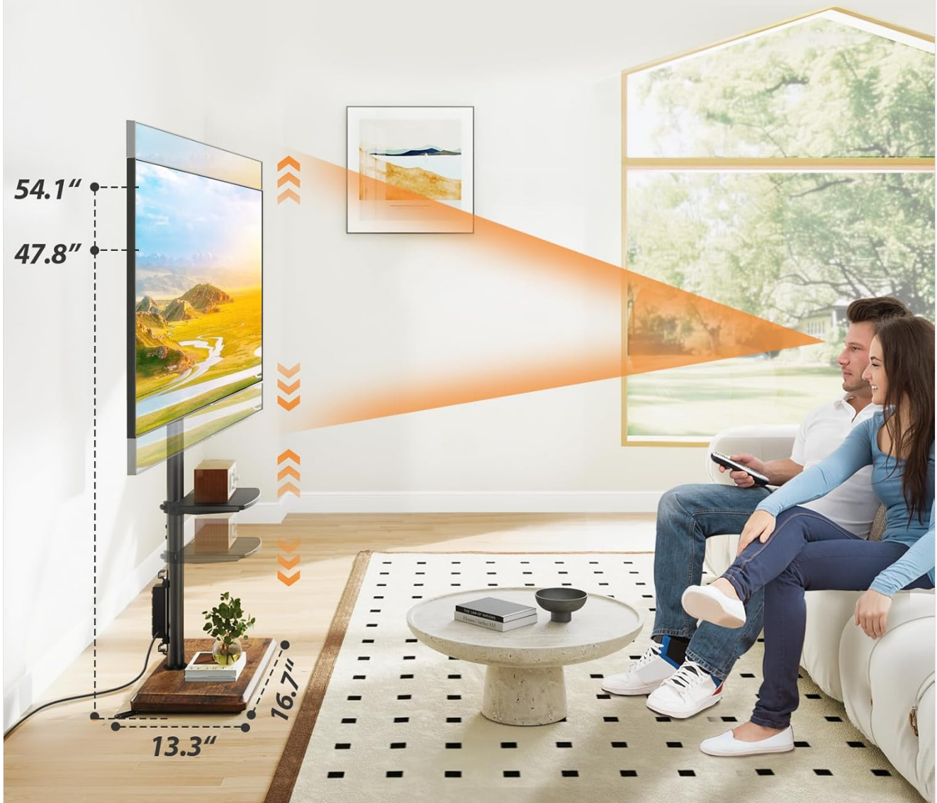
Image: The TV stand with the adjustable storage shelf, illustrating height adjustment.

This image displays the adjustable storage shelf, which can be moved up or down the main pole to accommodate various media devices or accessories. The arrows indicate the range of height adjustment.