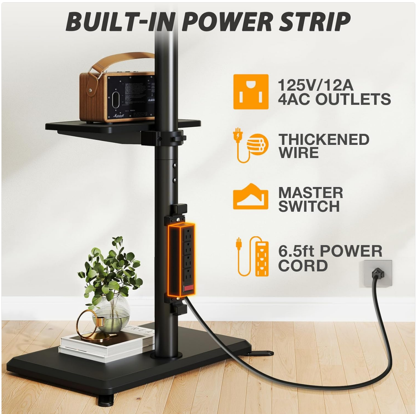
Image: Close-up of the power strip, showing its outlets and master switch.

This image provides a detailed view of the integrated power strip, highlighting its four AC outlets, the robust 6.5ft power cord, and the master switch for easy control and safety.