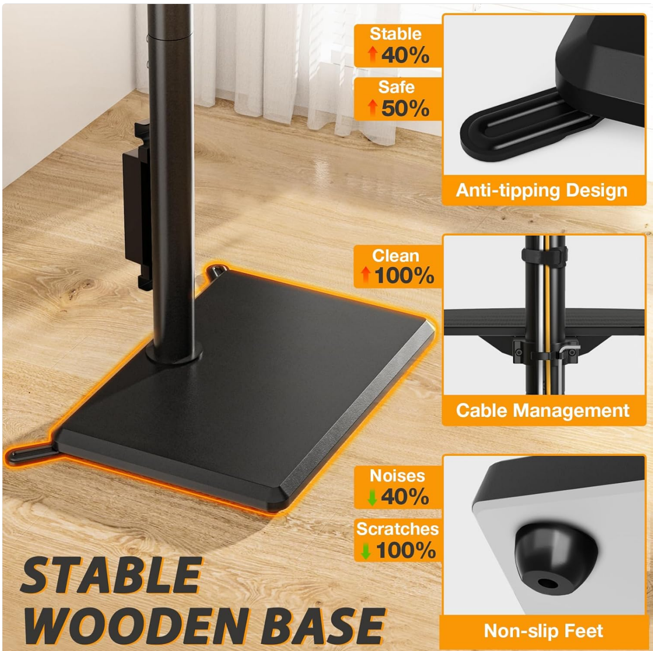
Image: The reinforced wooden base connected to the main support pole, highlighting its stability and anti-tipping features.

connections are secure. The base includes two foot supports at the back to prevent tipping.