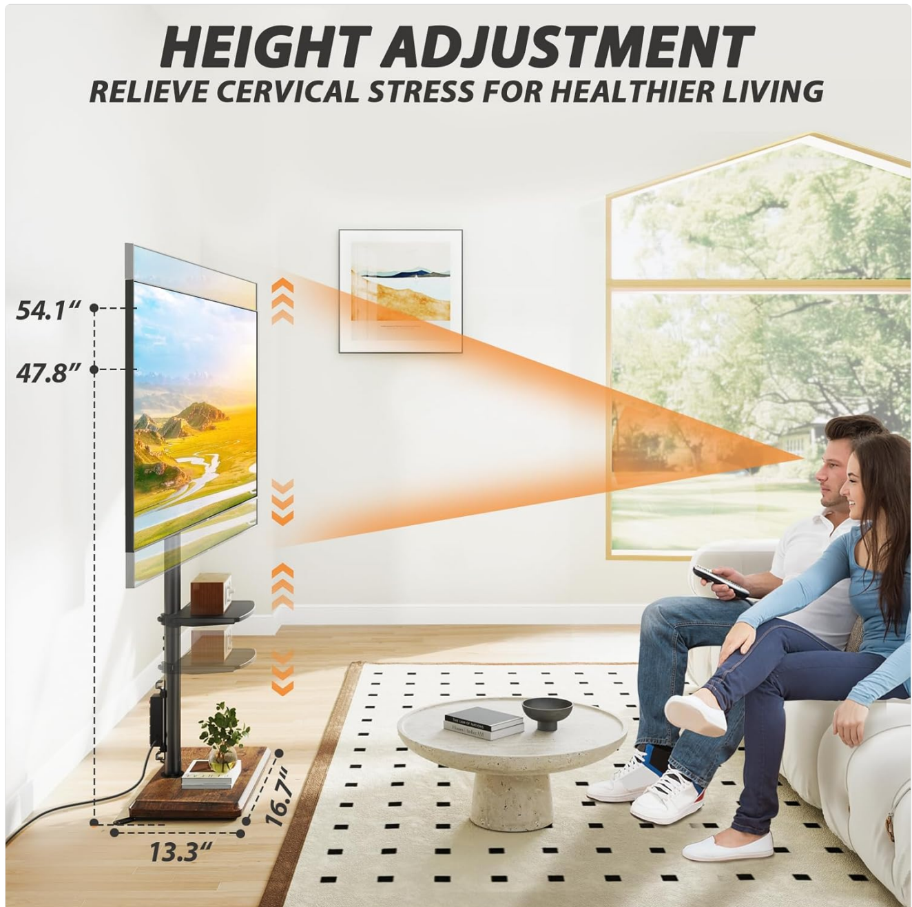
Image: Illustration of the TV stand's height adjustment range.

The TV mount allows for multiple height settings. To adjust the TV height, loosen the securing bolts on the main support pole, carefully raise or lower the TV to your desired viewing level, and then firmly tighten the bolts to secure it in place. The height can be adjusted from 40.4" to 44.4" (distance from the center of the bracket to the ground).