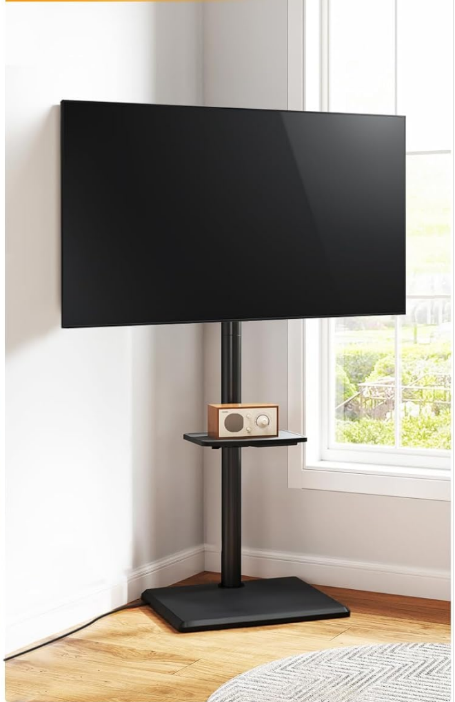
Image: The TV stand in a living room setting, demonstrating its space-saving design and cable management.

This image shows the TV stand in a compact setting, illustrating how its design and cable management system help save space and maintain a tidy environment, even in corners.