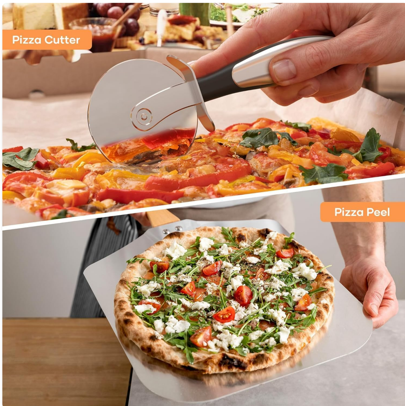
Image: Included accessories - Pizza Stone, Pizza Peel, and Pizza Cutter.