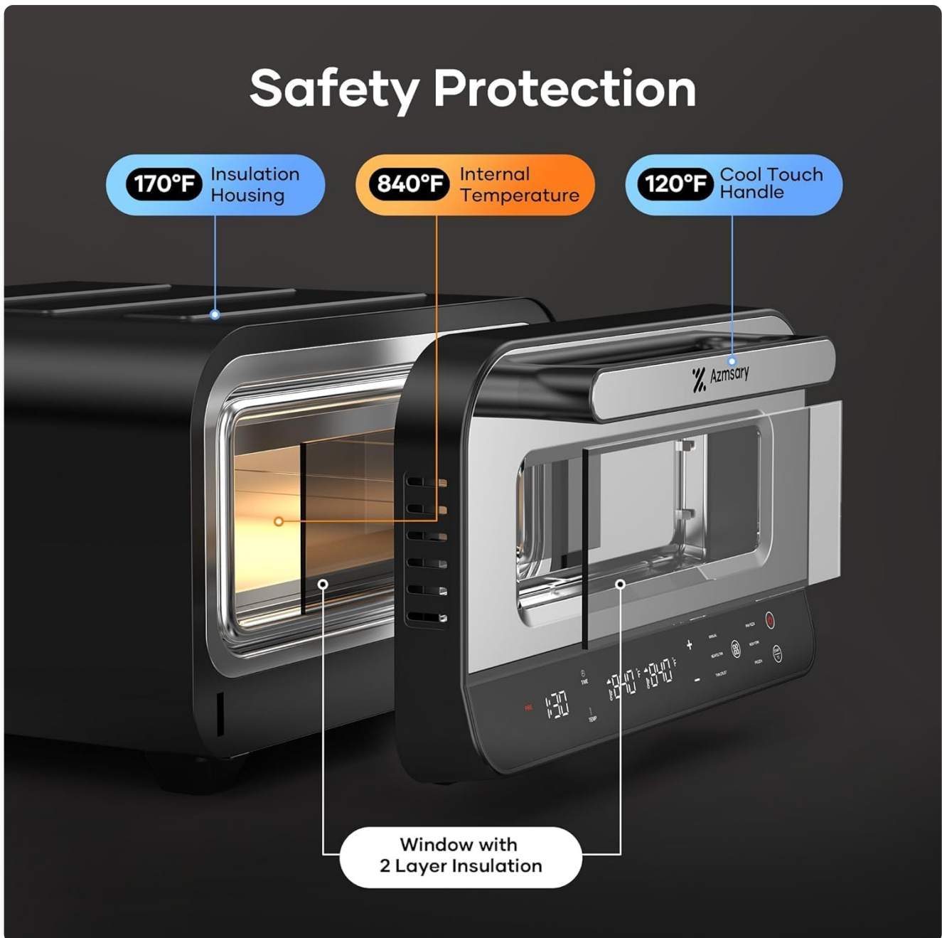
Image: Key safety features for secure operation.