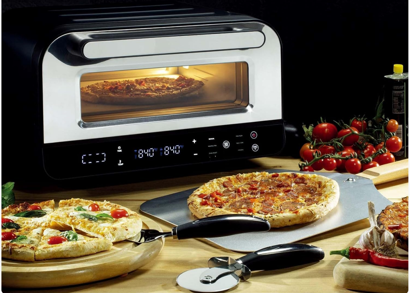
Image: Experience rapid baking, achieving perfect pizzas in as little as 90 seconds.

840 °F Max Temperature-5X Faster than an oven