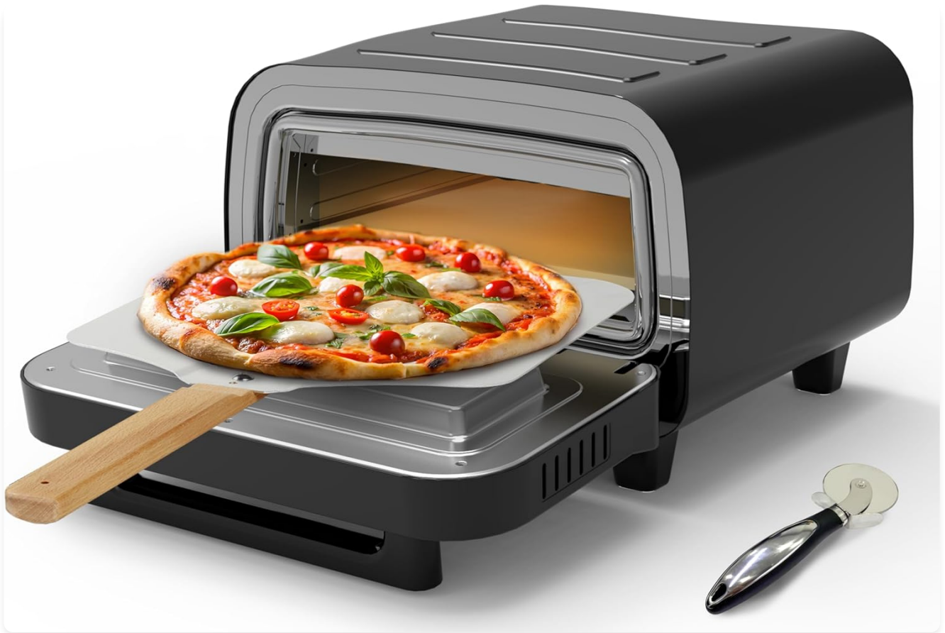
Image: The Azmsary Pizza Oven ready for use, showcasing its compact design and included accessories.

it to preheat for 20 minutes, then set a timer for 15 minutes. This process helps to season the stone and remove any odors. Ensure adequate ventilation during this process.