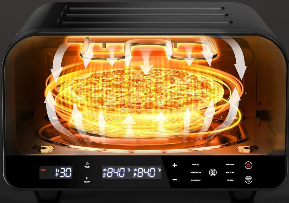
Image: Dual heating elements provide 360° uniform heating for optimal results.