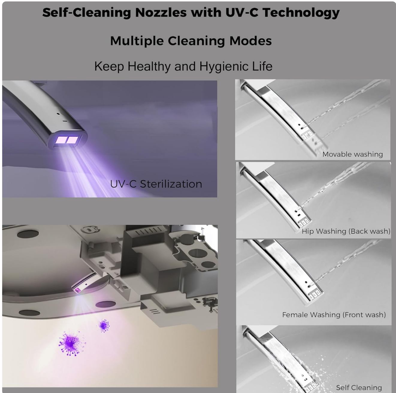
Figure 5.4: Self-Cleaning Nozzles with UV-C Technology and Wash Modes

Your browser does not support the video tag.