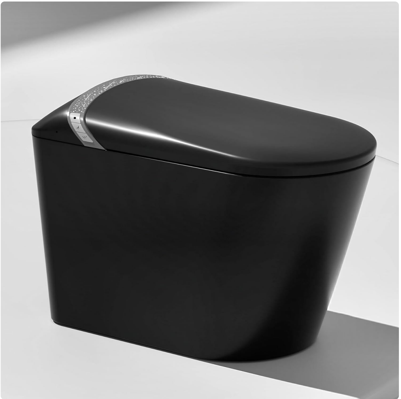
Figure 1.1: WinZo Luxury Smart Toilet (Matte Black)