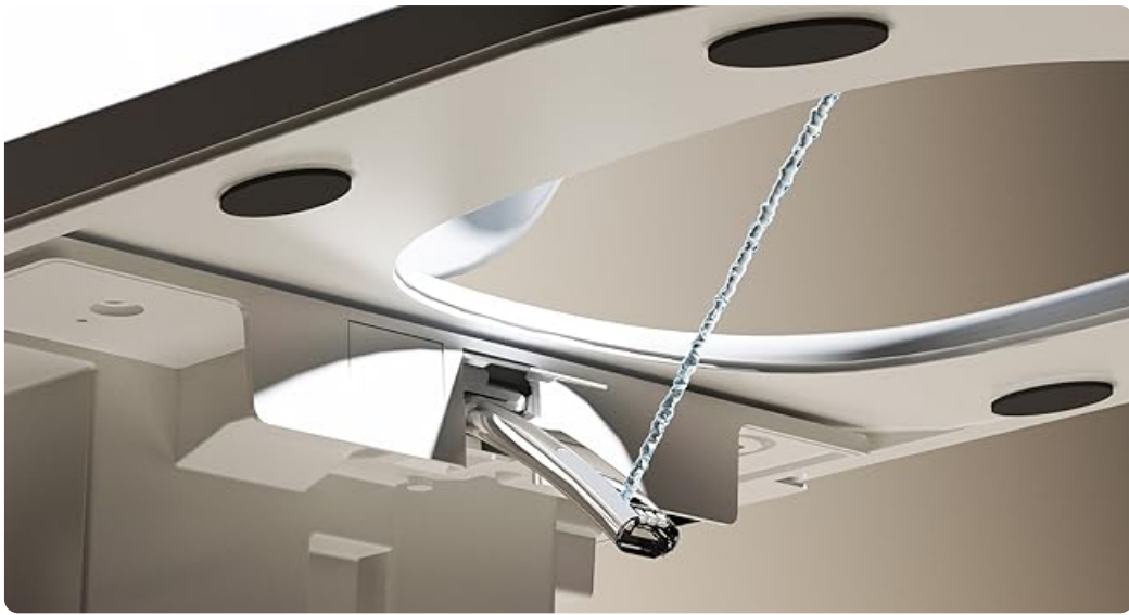
Figure 5.1: Auto Open / Foot Kick Operation Flow