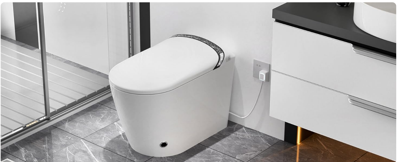
Figure 5.3: Starry Night Light System