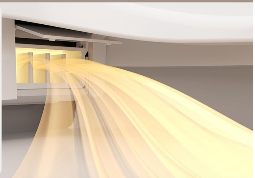
Figure 5.2: Comfort Heated Seat and Instant Warm Air Dryer