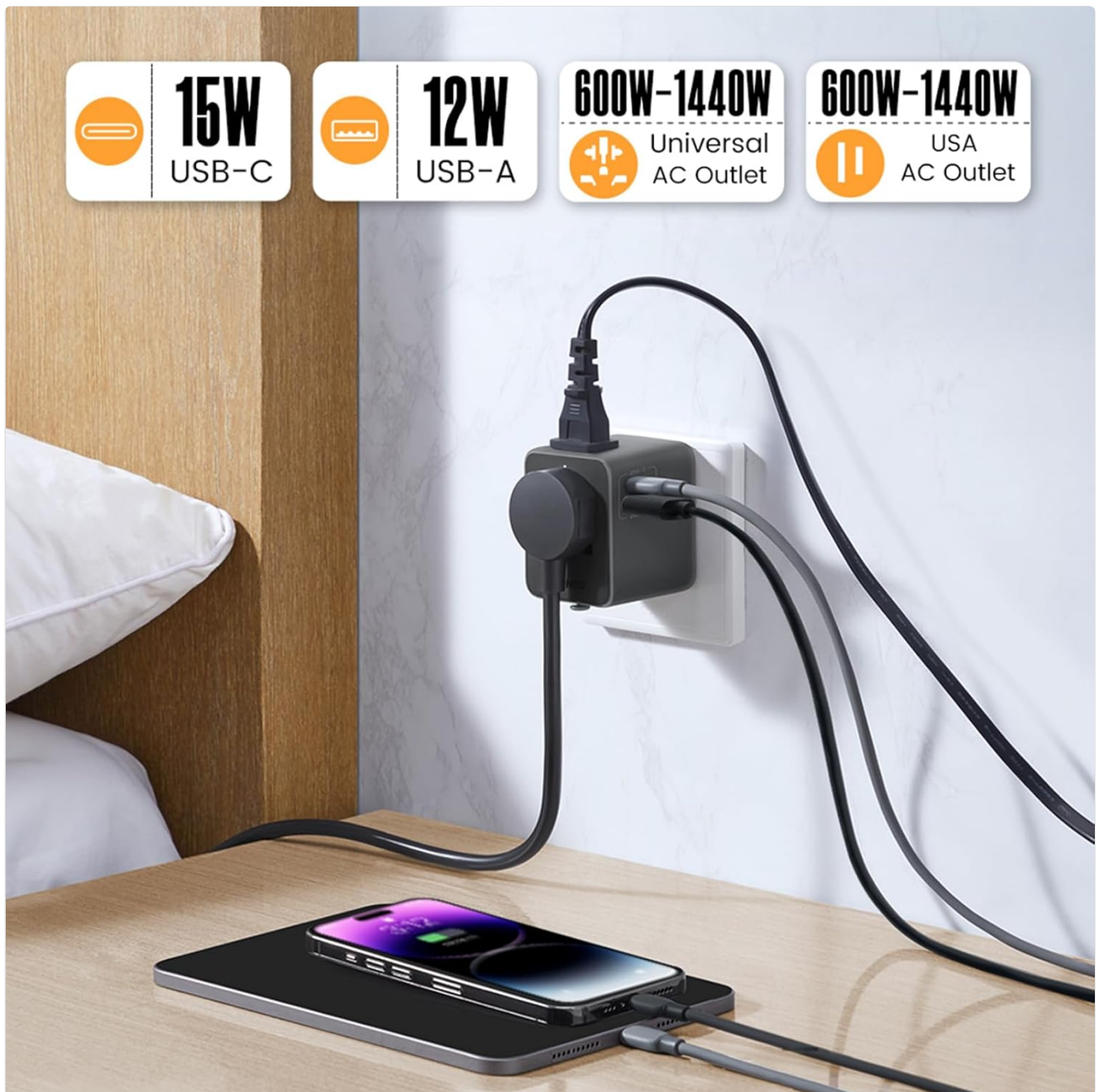
Image 4.1: The adapter in use, demonstrating simultaneous charging of a phone and tablet via USB ports while an AC device is also connected.