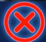
Image 5.1: Comparison highlighting the convenience and safety of the automatic reset feature over traditional, replaceable fuses.