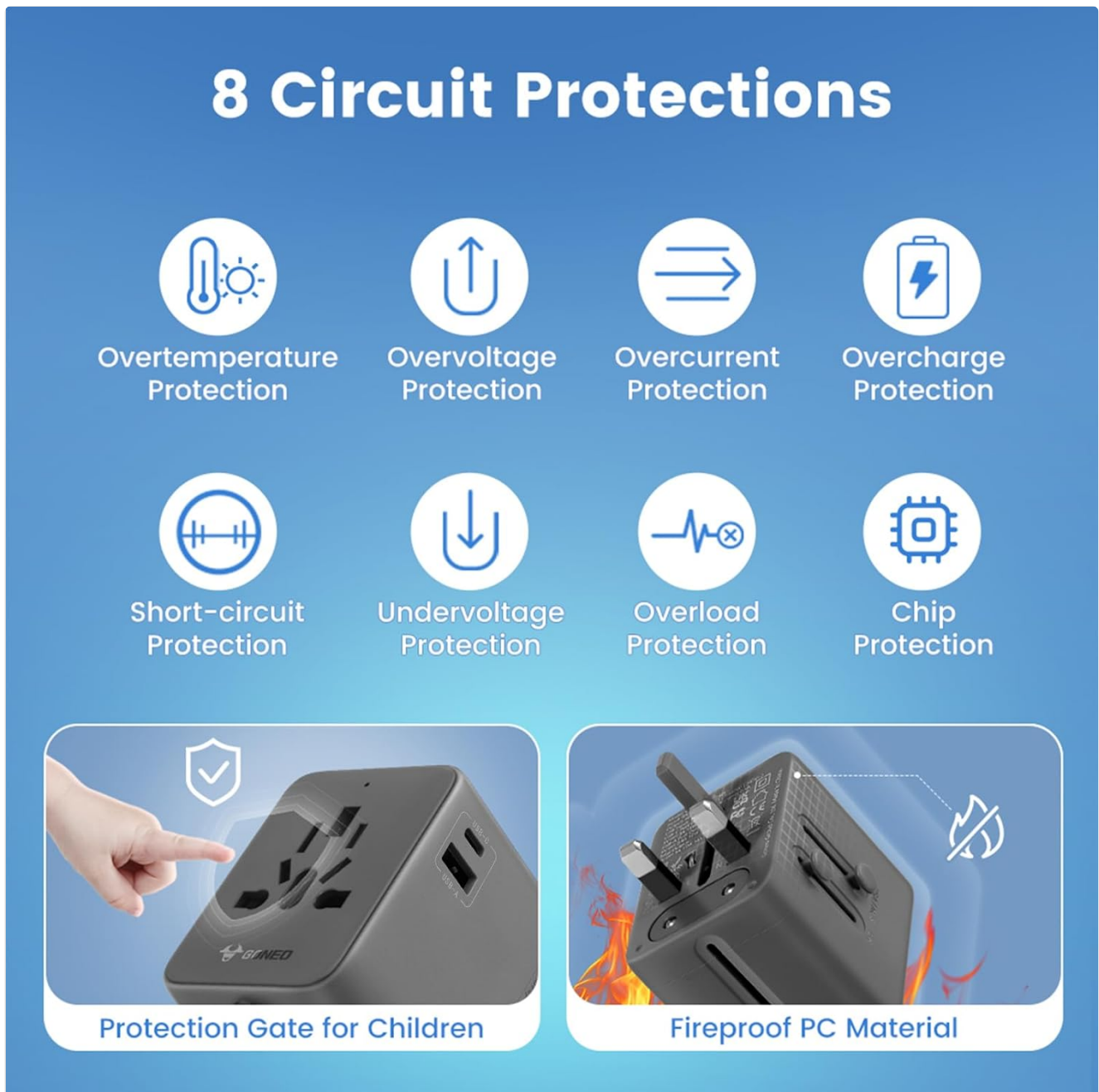
Image 2.1: Visual representation of the eight circuit protection mechanisms integrated into the adapter for enhanced safety.