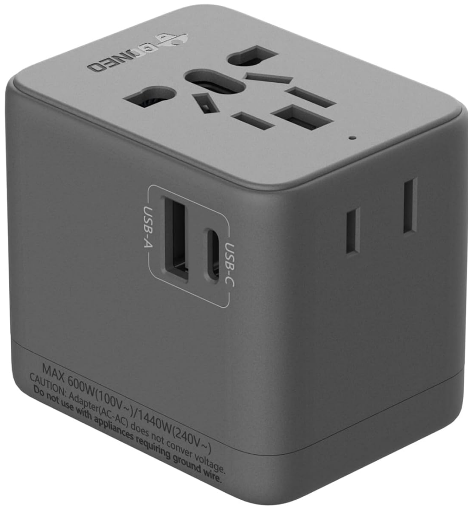
Image 1.1: Front view of the GONEO Universal Travel Adapter, showcasing its compact design and integrated USB ports.