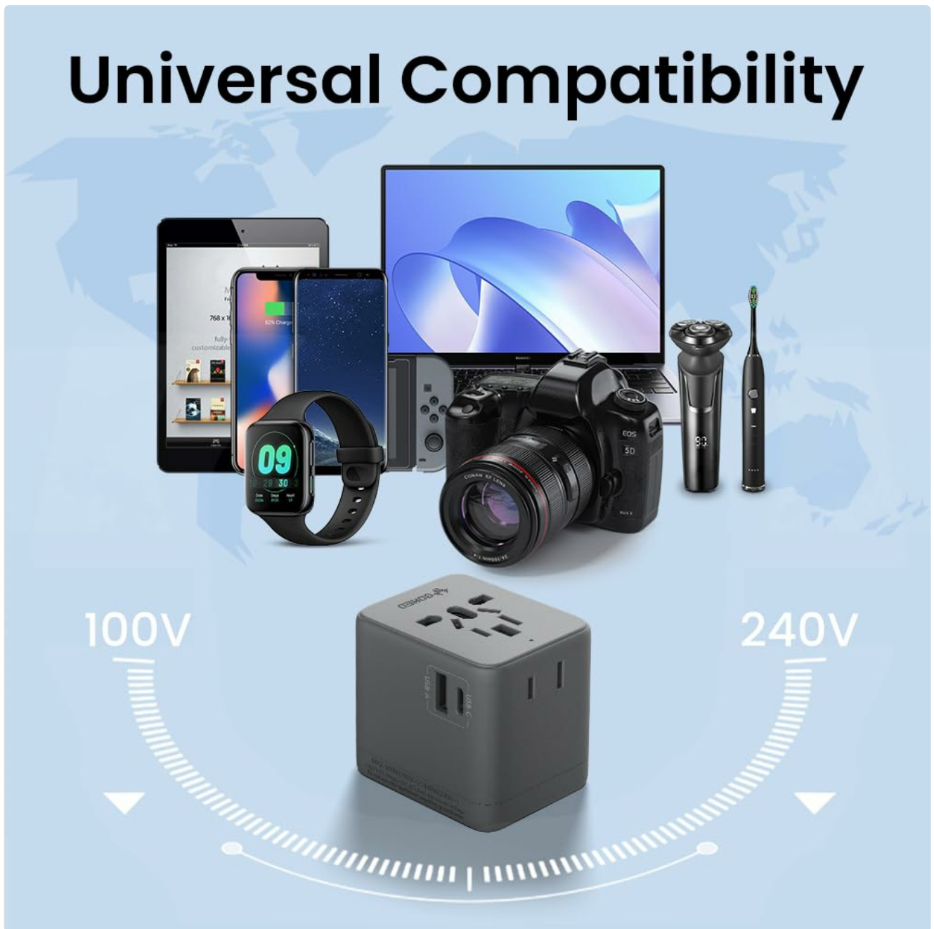
Image 3.1: Close-up view of the adapter, highlighting the USB-A and USB-C charging ports.