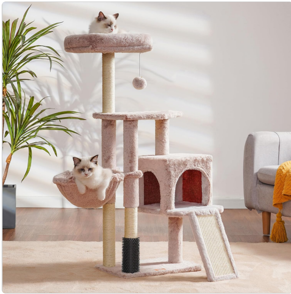
Figure 4: A close-up view highlighting the integrated grooming brush for self-care and the sisal scratching ramp for claw maintenance.