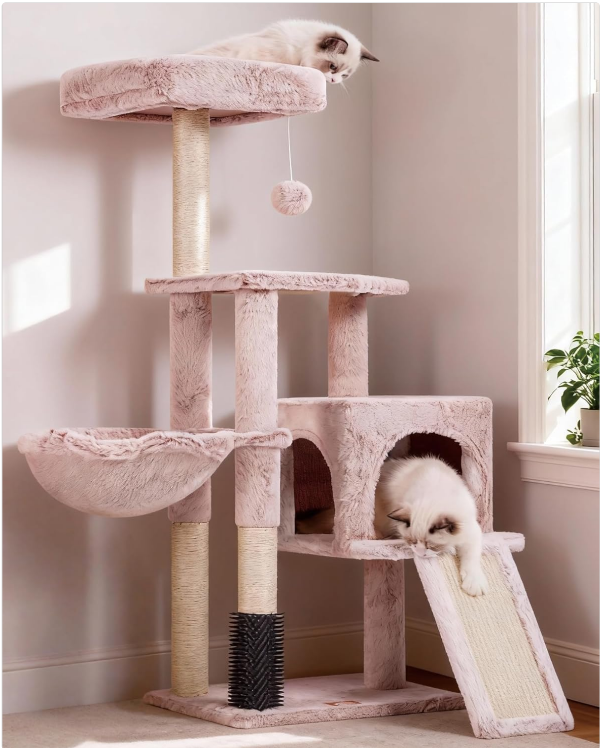
Figure 1: The Heybly Cat Tree HCT005SMU, showcasing its various levels, scratching posts, cat condo, and lounging basket, with two cats enjoying the structure.