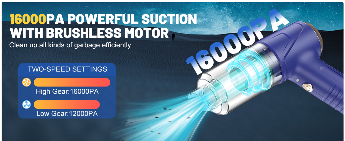
Figure 5: The device offers two suction levels: 12000Pa for general cleaning and 16000Pa for stronger debris removal.