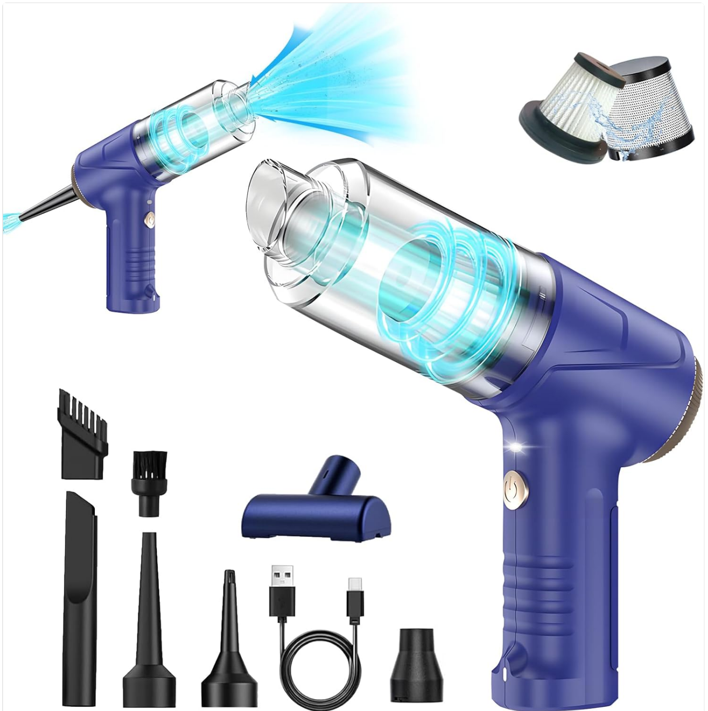
Figure 1: Vanclearidea Handheld Cordless Car Vacuum Cleaner LT-145Plus and included accessories.