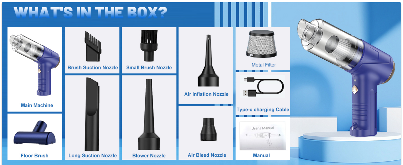
Figure 3: Visual representation of all included accessories and the main unit.