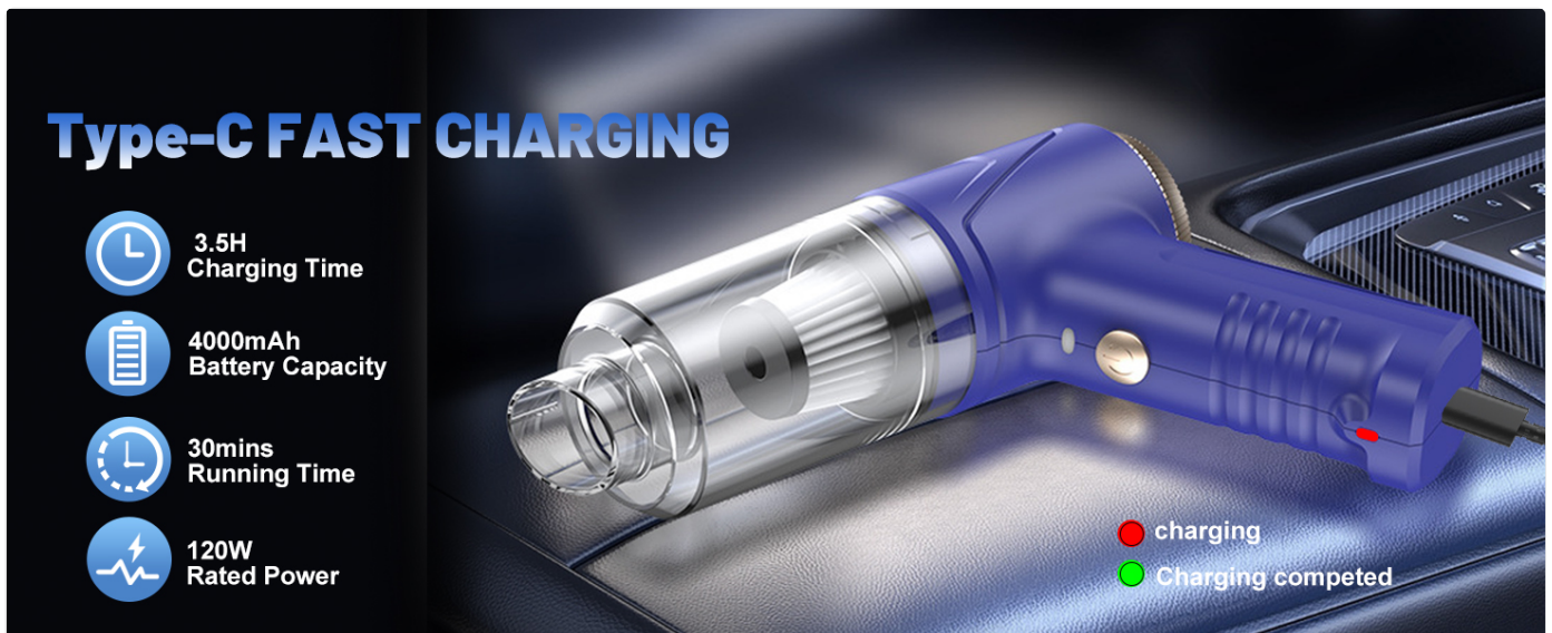
Figure 4: Charging the device using the Type-C cable and various power sources. Red indicates charging, green indicates fully charged.