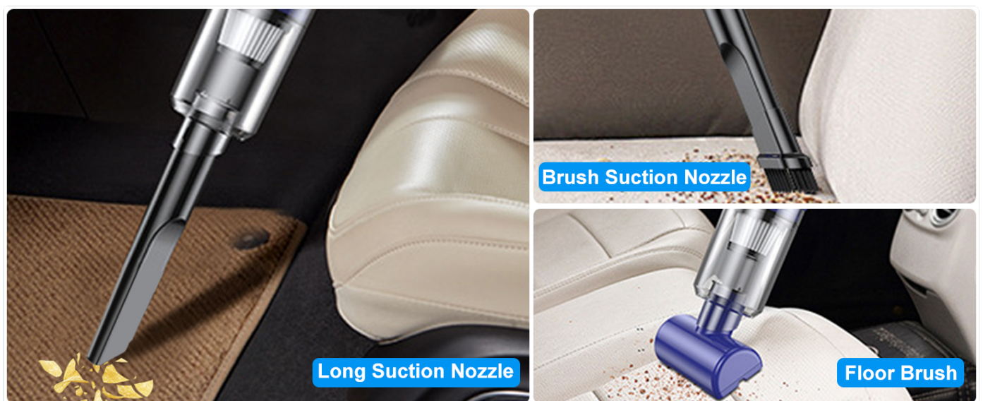
Figure 7: Specific applications of the Long Suction Nozzle, Brush Suction Nozzle, and Floor Brush for various cleaning tasks.