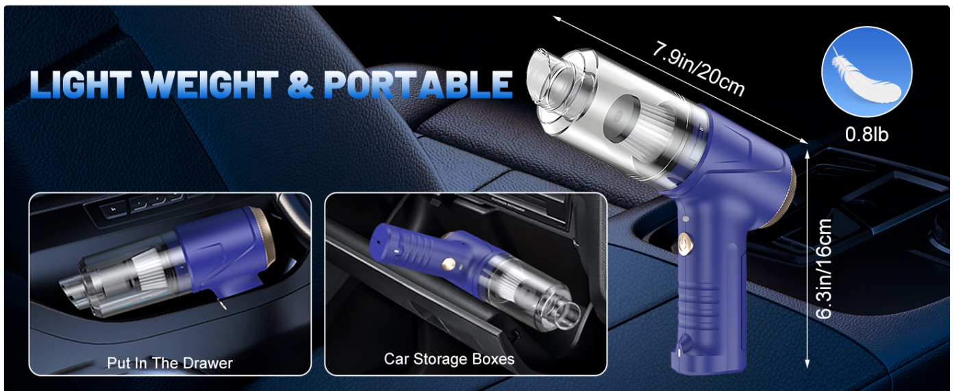
Figure 10: The compact dimensions and lightweight design of the vacuum cleaner.