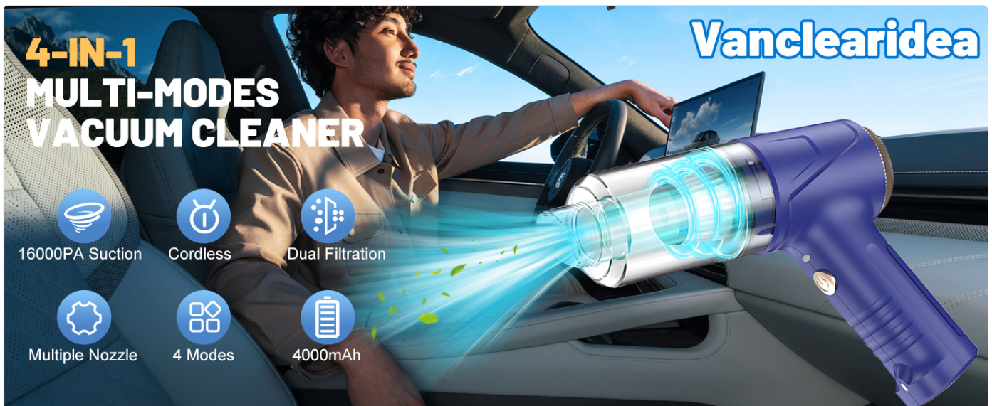
Figure 6: The device supports four operational modes by attaching nozzles to either the vacuum intake or the blower exhaust.