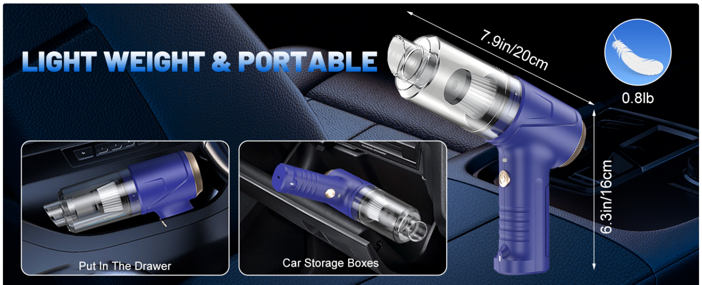
Figure 9: The compact design allows for convenient storage in various locations, such as car drawers or storage boxes.

Store the vacuum cleaner and its accessories in a cool, dry place, away from direct sunlight and extreme temperatures. Ensure the device is fully charged before long-term storage to preserve battery health.