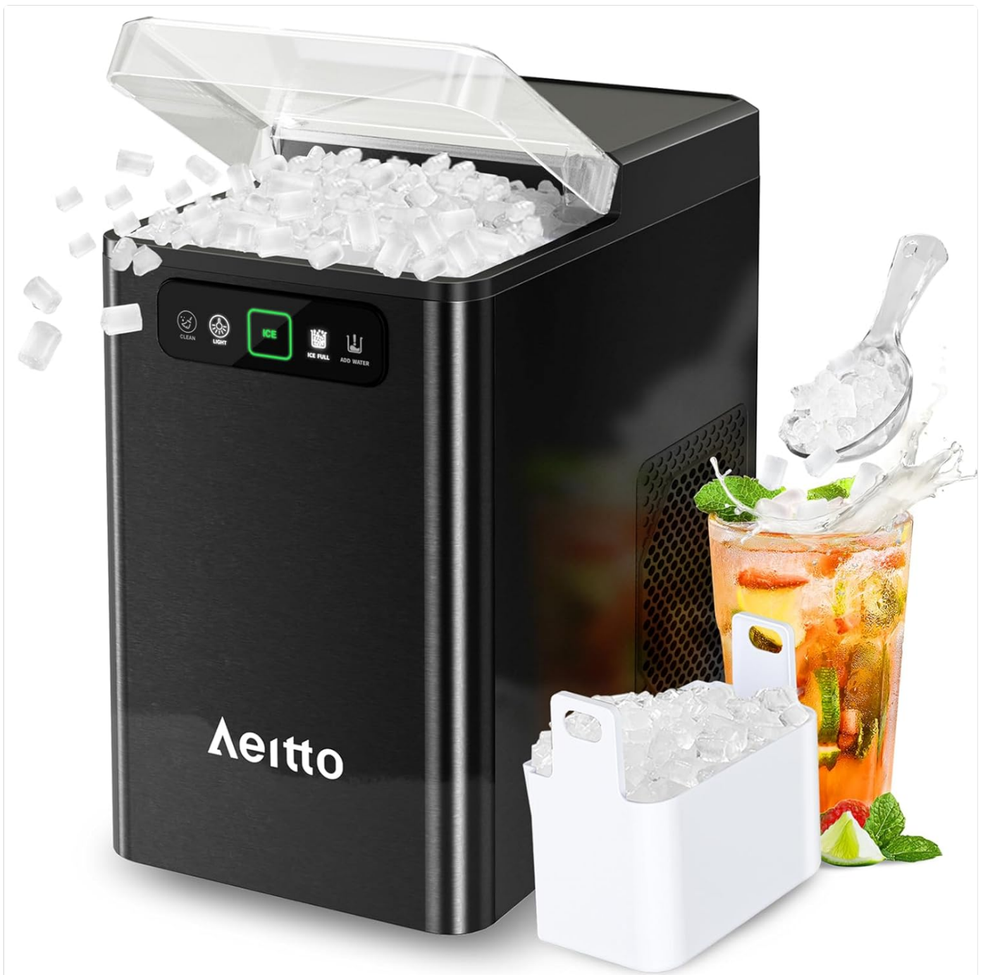
Figure 1: Aeitto Nugget Ice Maker with ice bucket and a refreshing drink.