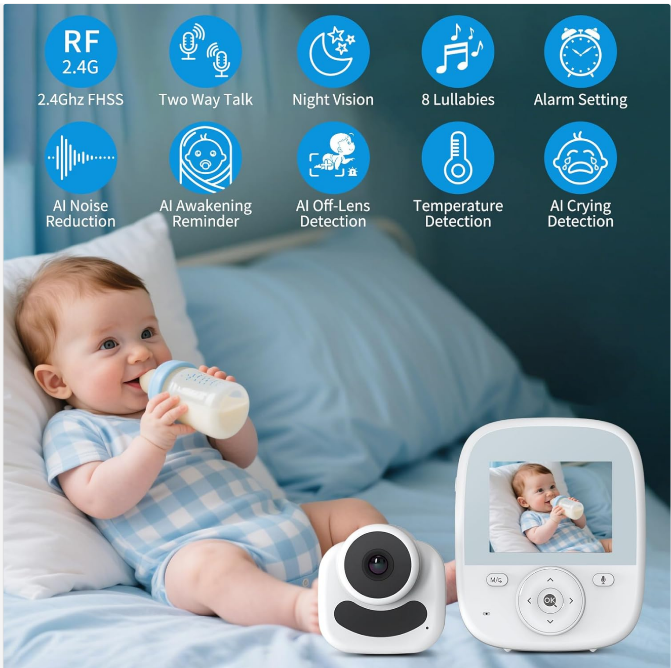
Image: An overview of the VIZOLINK VB28 Baby Monitor's key features, including 2.4G FHSS, Two-Way Talk, Night Vision, 8 Lullabies, Alarm Setting, AI Noise Reduction, AI Awakening Reminder, AI Off-Lens Detection, Temperature Detection, and AI Crying Detection.