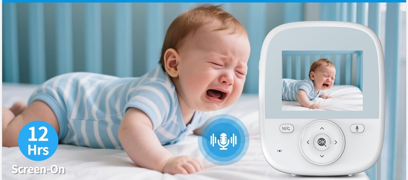
Image: The VIZOLINK VB28 Baby Monitor illustrating its 4000mAh battery capacity, showing 20 hours in audio-only mode and 12 hours with the screen on, and how VOX mode activates the screen when the baby cries.

4000mAh Large Capacity Battery &VOX Mode