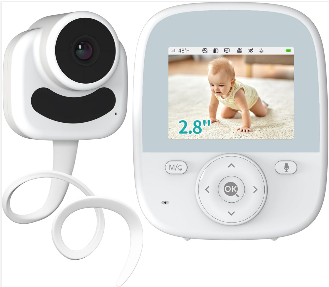
Image: The VIZOLINK VB28 Baby Monitor, showing both the parent unit with its 2.8-inch screen and the camera unit.