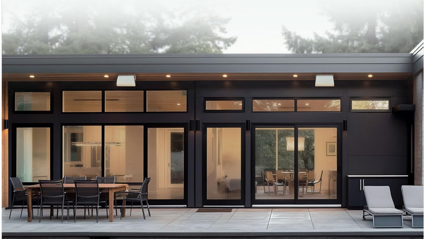
Image: Two white Definitive Technology AW-450 outdoor speakers mounted on the exterior wall of a modern house, overlooking an outdoor patio area. This demonstrates typical installation for outdoor sound.

Despite its compact footprint, the AW-450 delivers clear, dynamic sound, courtesy of its mineral-filled woofer, premium tweeter, and passive bass radiator.