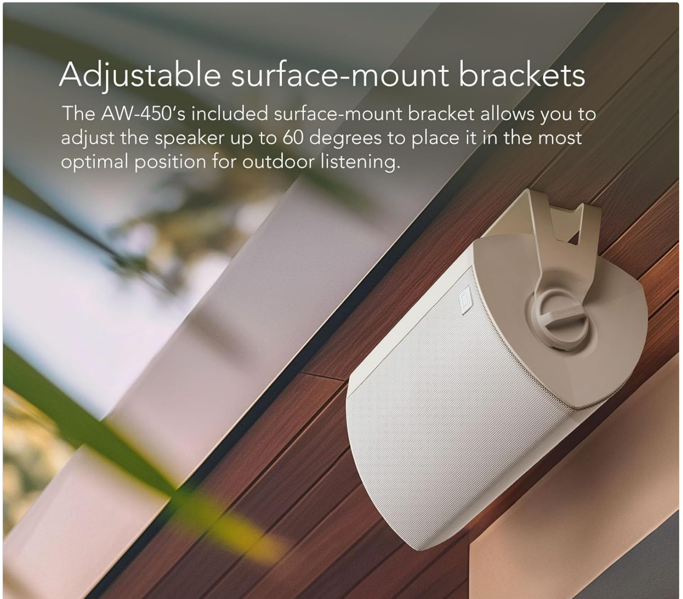
Image: A white Definitive Technology AW-450 outdoor speaker mounted on a wooden surface, showcasing its adjustable surface-mount bracket. The bracket allows for angling the speaker to direct sound.

The AW-450's included surface-mount bracket allows you to adjust the speaker up to 60 degrees to place it in the most optimal position for outdoor listening.