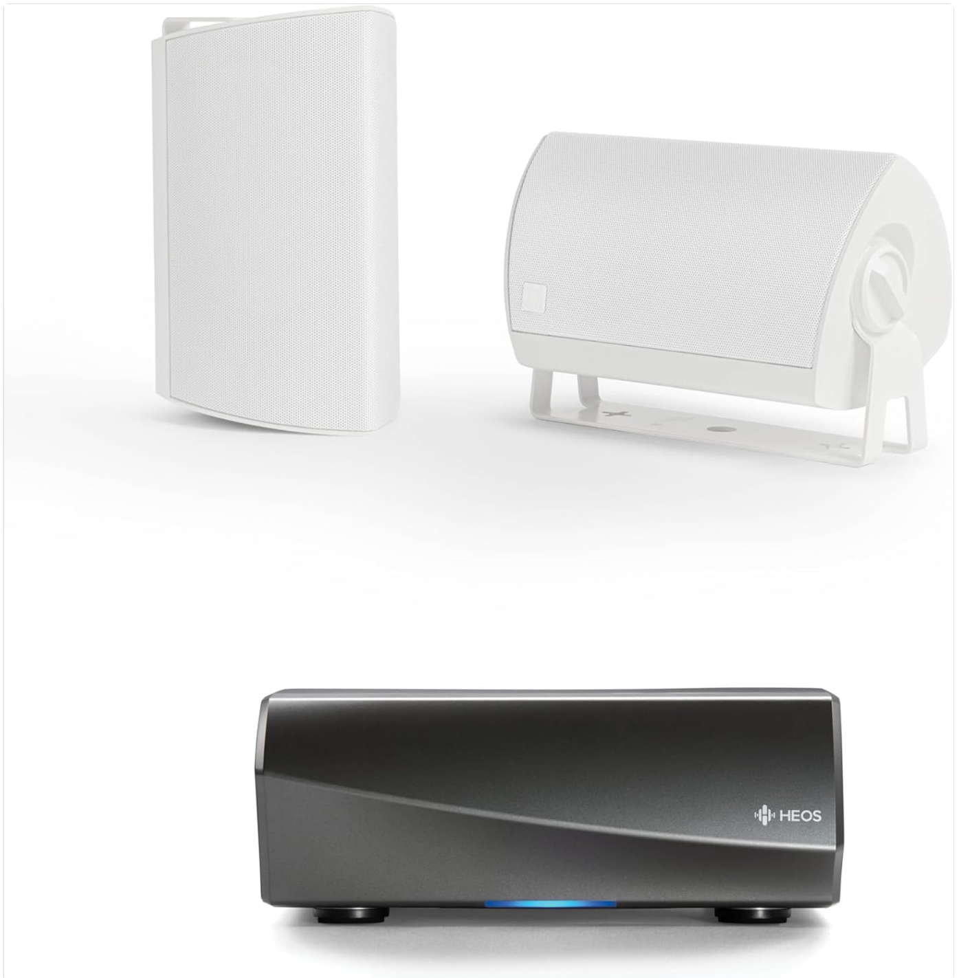
Image: A pair of white Definitive Technology AW-450 outdoor speakers shown alongside a black Denon HEOS Wireless Streaming Amplifier. This illustrates the complete system components.