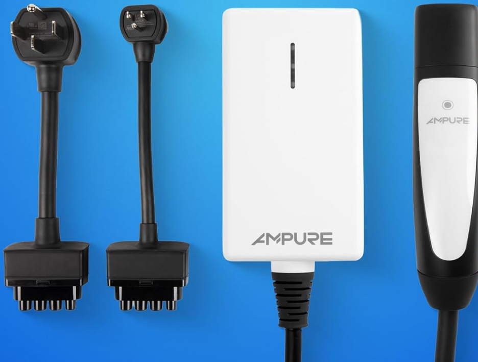
Image 3.1: All components included in the Ampure Go 2 Portable EV Charger package.