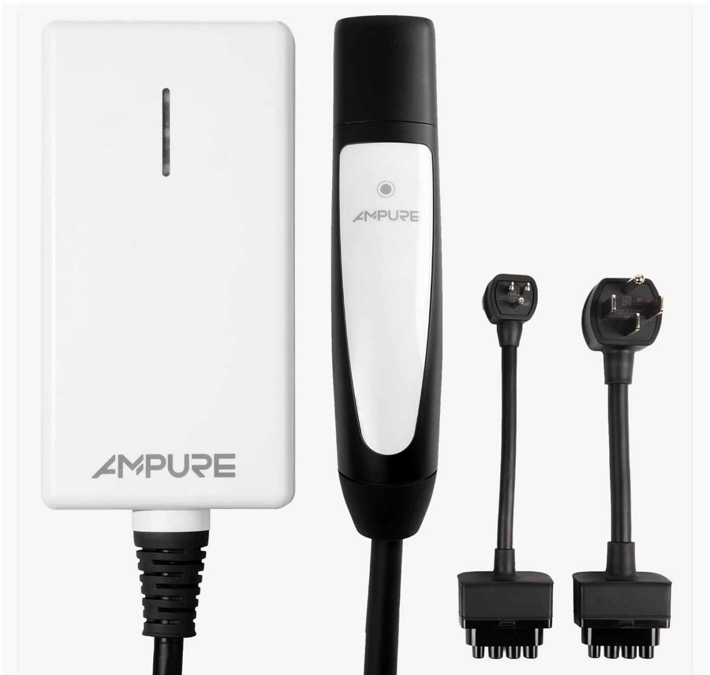
Image 1.1: Ampure Go 2 Portable EV Charger with NACS connector and interchangeable power adapters.