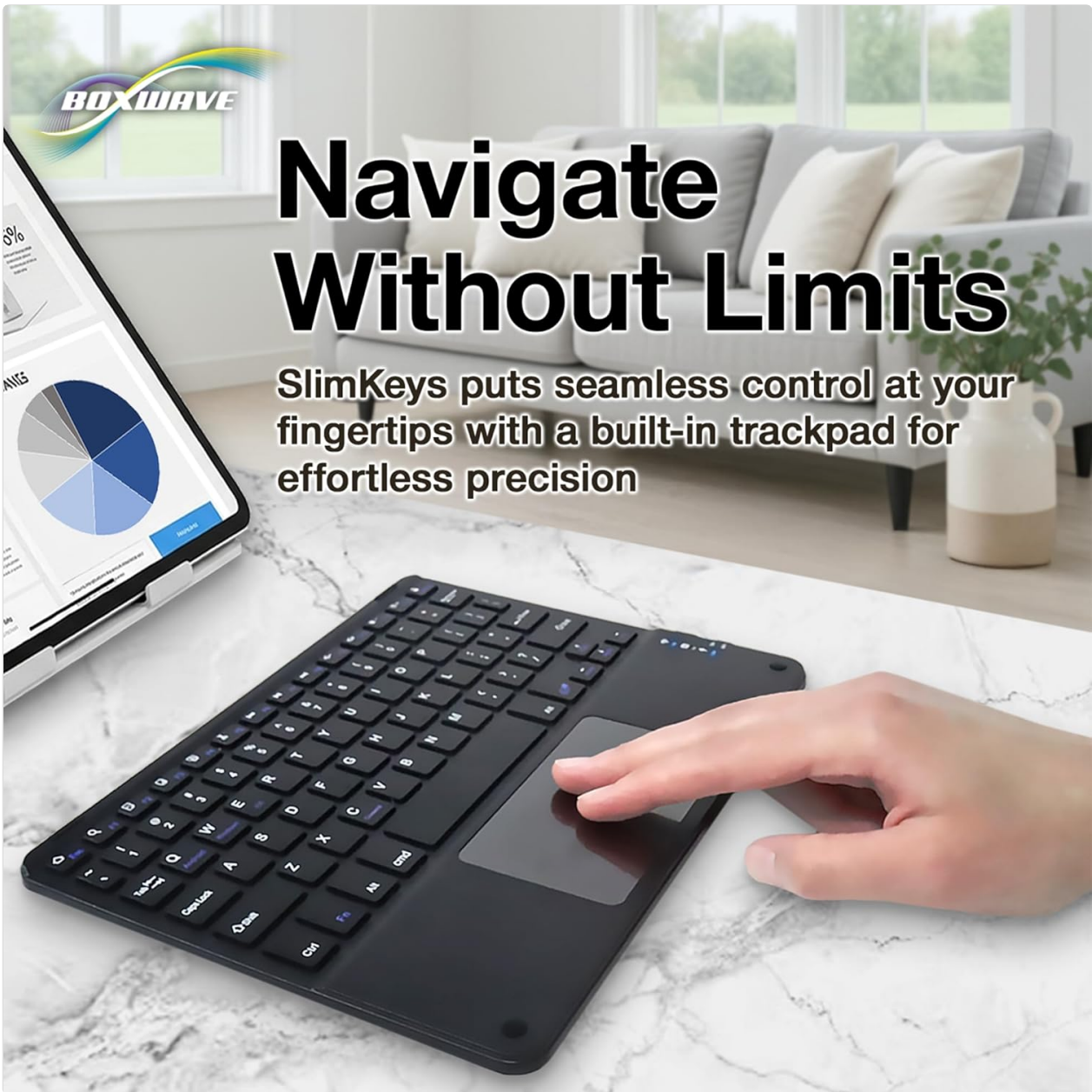
Image: A hand using the integrated trackpad on the SlimKeys keyboard, demonstrating navigation capabilities.