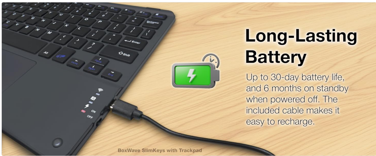
Image: The BoxWave SlimKeys keyboard connected to a charging cable, illustrating the charging process.