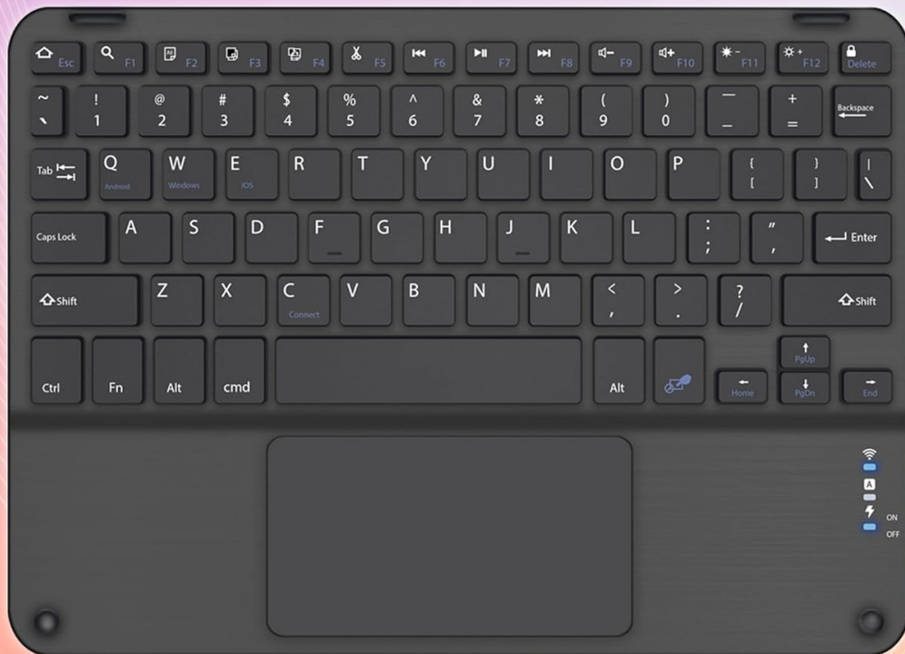
Image: Angled view of the BoxWave SlimKeys Bluetooth Keyboard with Trackpad, highlighting its slim profile.