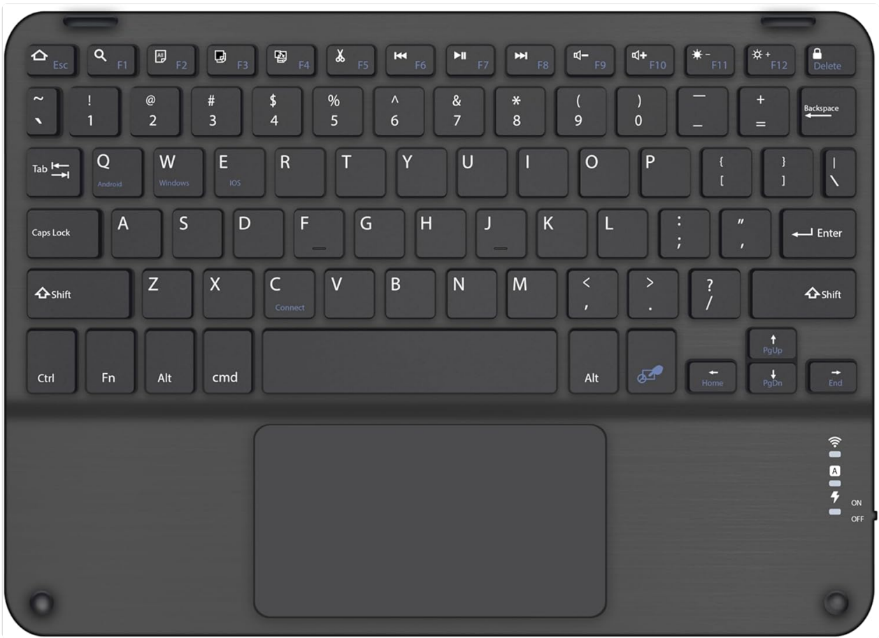
Image: Top-down view of the BoxWave SlimKeys Bluetooth Keyboard with Trackpad, showing the full QWERTY layout and integrated trackpad.