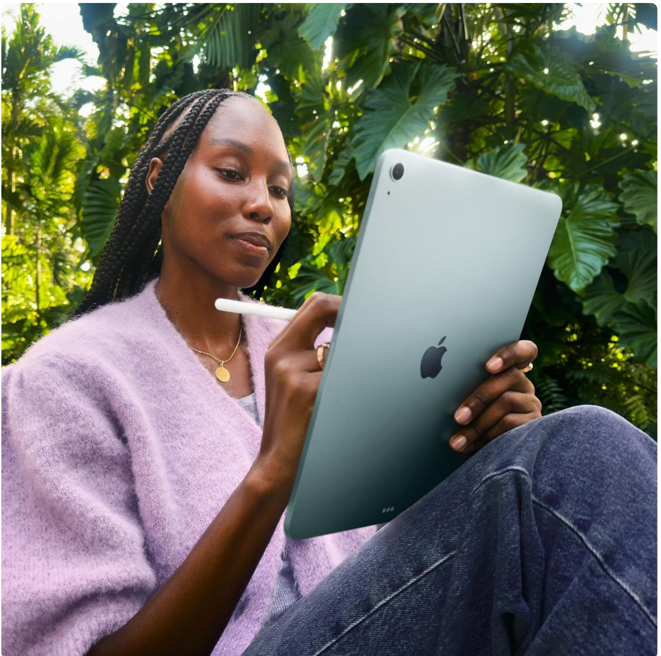
Image: A user interacting with the iPad Air using an Apple Pencil, highlighting the device's utility for creative tasks in various environments.

The iPad Air supports Apple Pencil Pro and Apple Pencil (USB-C), transforming it into a versatile tool for drawing, note-taking, and marking up documents. The Magic Keyboard for iPad Air provides a comfortable typing experience with a built-in trackpad and a 14-key function row, also serving as a protective cover.