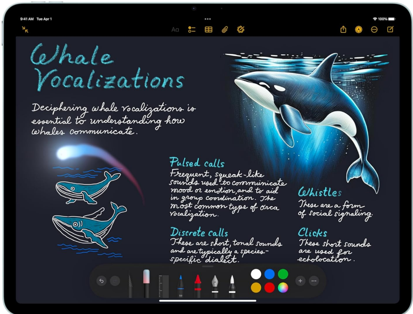
Image: The iPad screen showcasing the "Apple Intelligence" feature, demonstrating its capability for creative and informational tasks, such as note-taking and illustration.