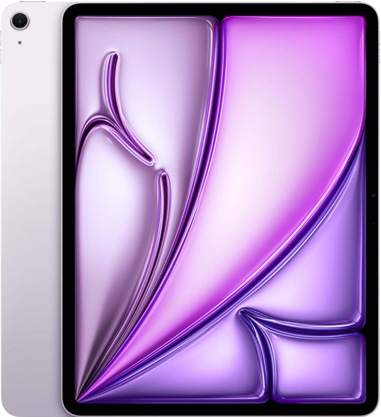
Image: Front view of the Apple iPad Air 13-inch in purple, highlighting its expansive Liquid Retina display.