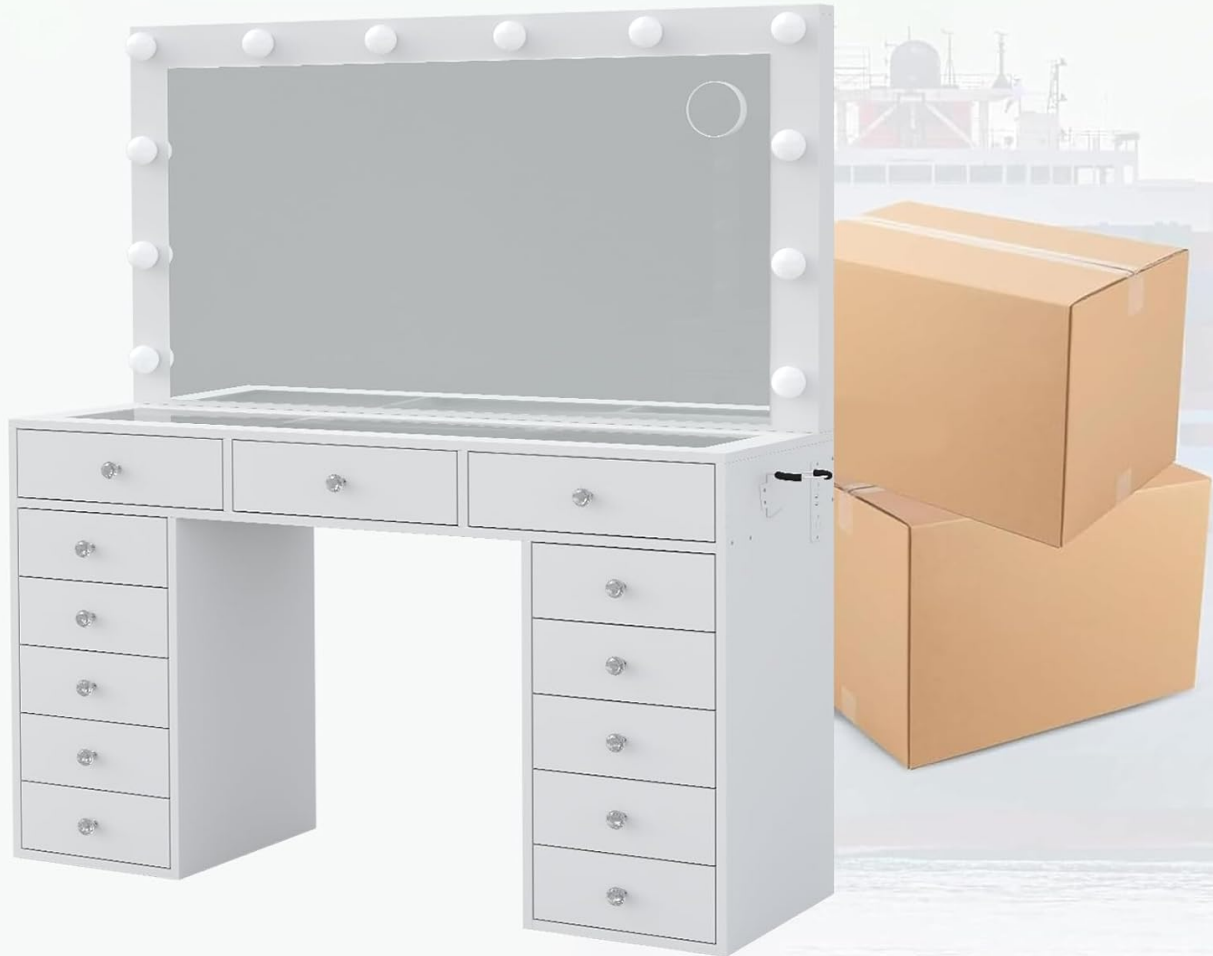
Image 8.1: Detailed product dimensions for the vanity desk and accompanying stool.