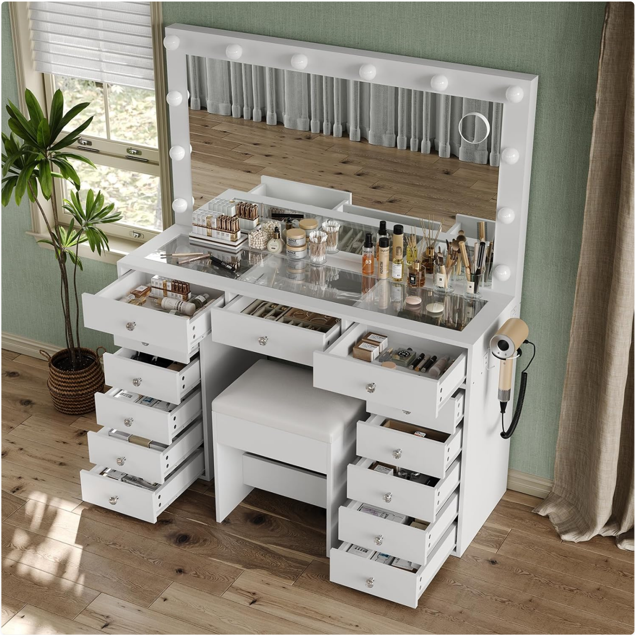
Image 5.3: The vanity desk offers extensive storage with 13 drawers to keep items organized.