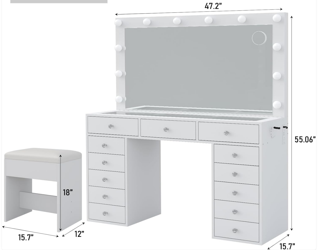
Image 5.5: The vanity stool features a thick, soft cushion for enhanced comfort.