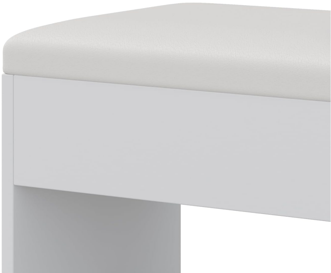
Image 3.1: The vanity desk is shipped in two separate packages, which may arrive on different dates.