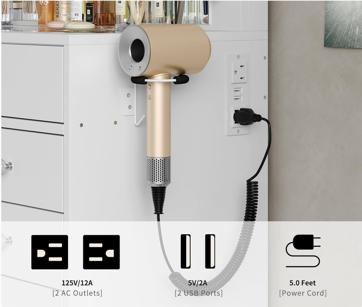
Image 5.2: The integrated power strip provides convenient access to AC outlets and USB charging ports.

Convenient for phone charging & hair dryer use