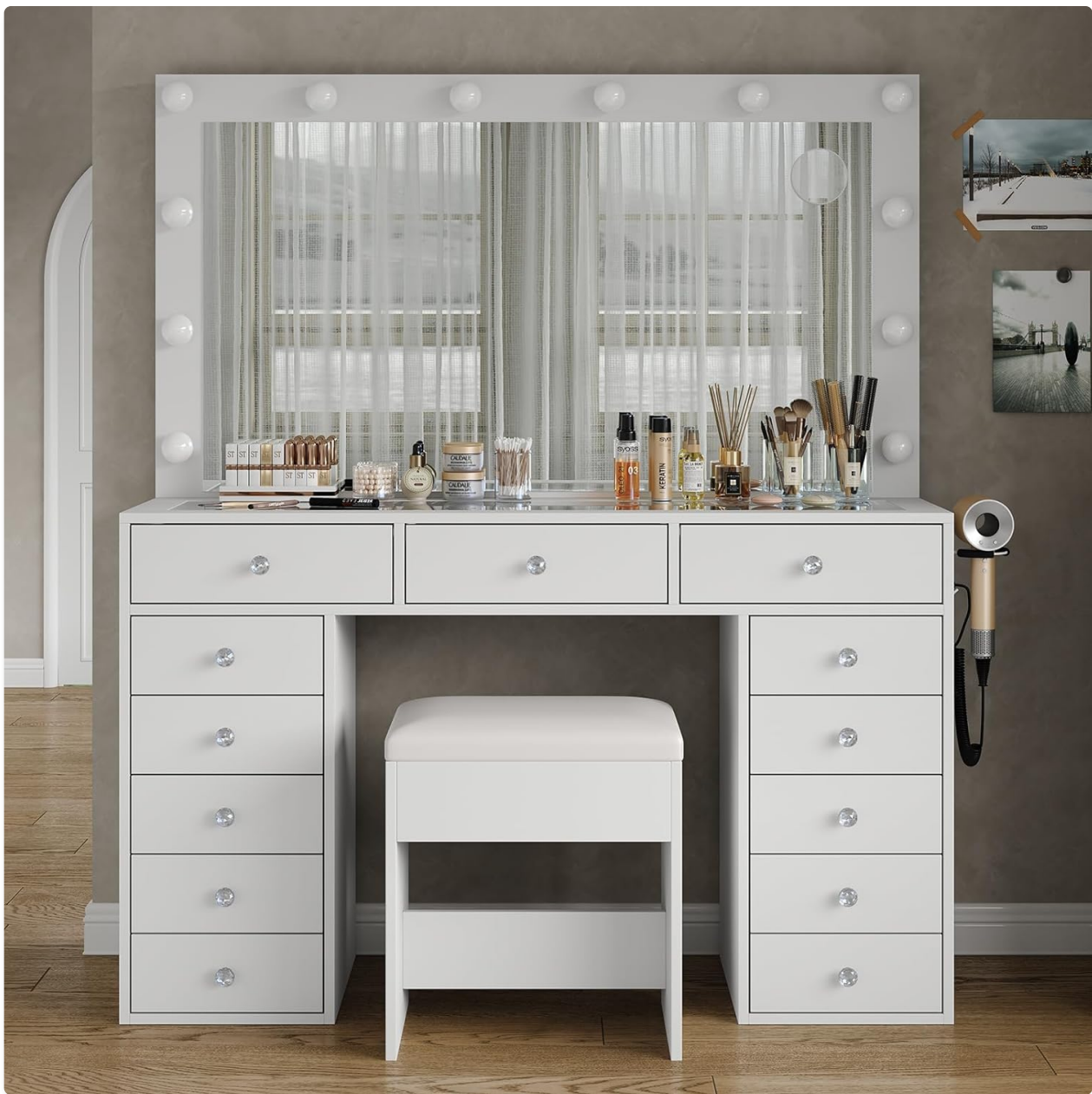
Image 1.1: The FUSOU 13-Drawer Vanity Desk with its integrated mirror and accompanying stool.