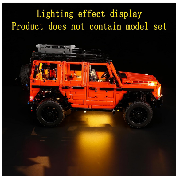
Side view of the illuminated Lego Mercedes-Benz G 500 model.