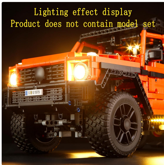
Close-up of the front lighting details.