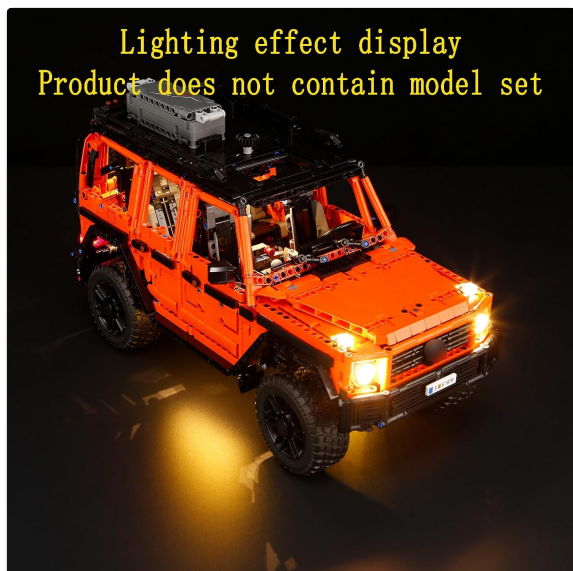
Front view of the illuminated Lego Mercedes-Benz G 500 model.

The following images illustrate the lighting effect once installed: