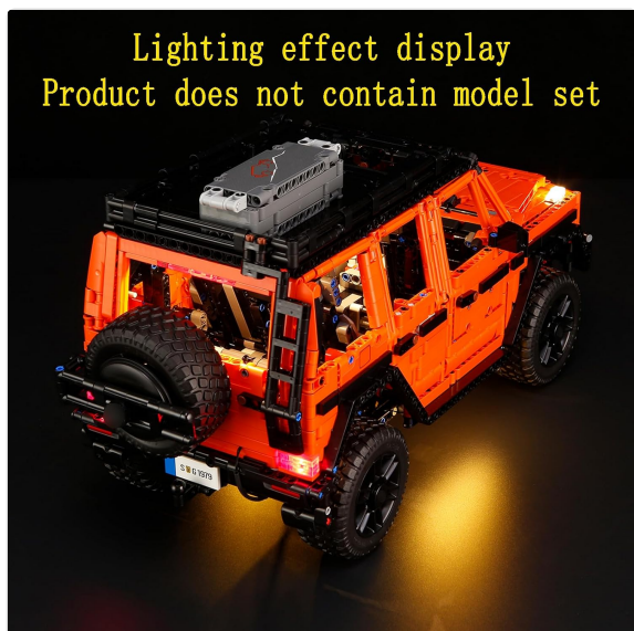
Rear view of the illuminated Lego Mercedes-Benz G 500 model.