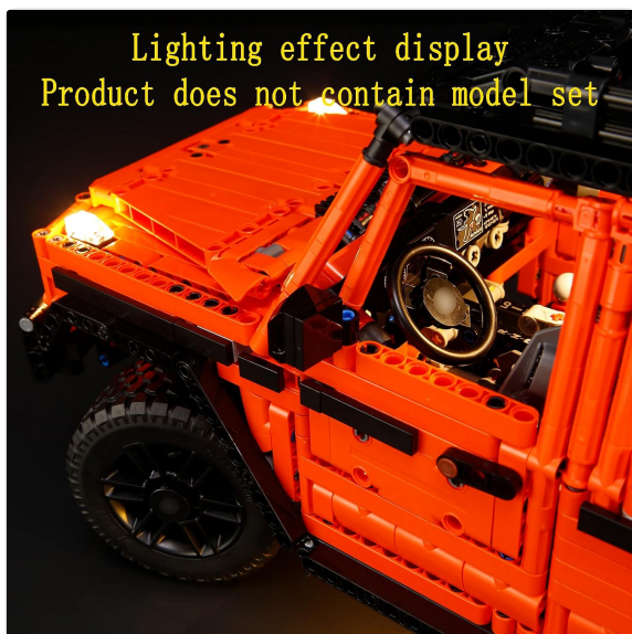
Close-up of the interior lighting details.