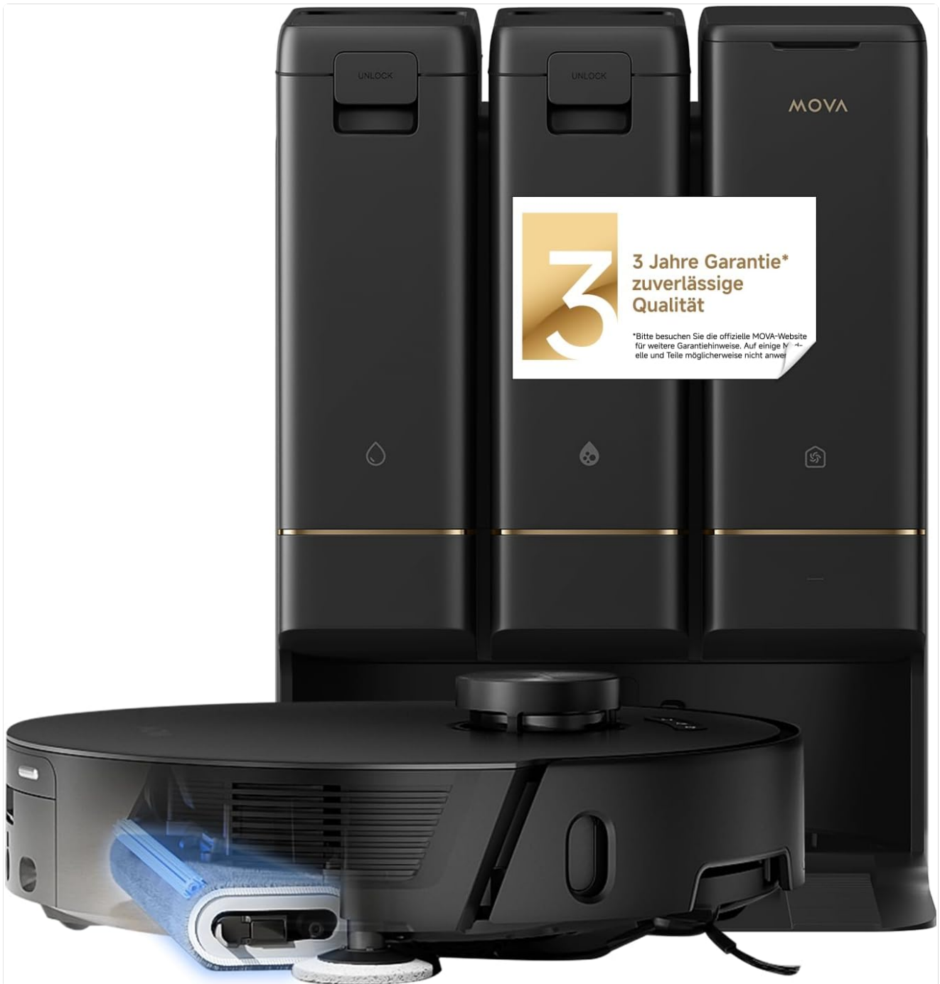
Image: The Mova Z50 Ultra robot vacuum and its accompanying base station, highlighting its sleek black design and integrated features.