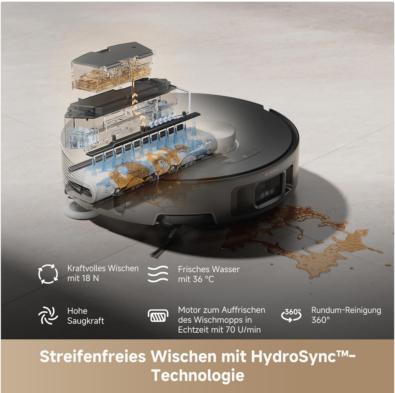
Image: An illustration demonstrating the HydroSync mopping technology, showing fresh water being applied and dirty water being collected for streak-free cleaning.