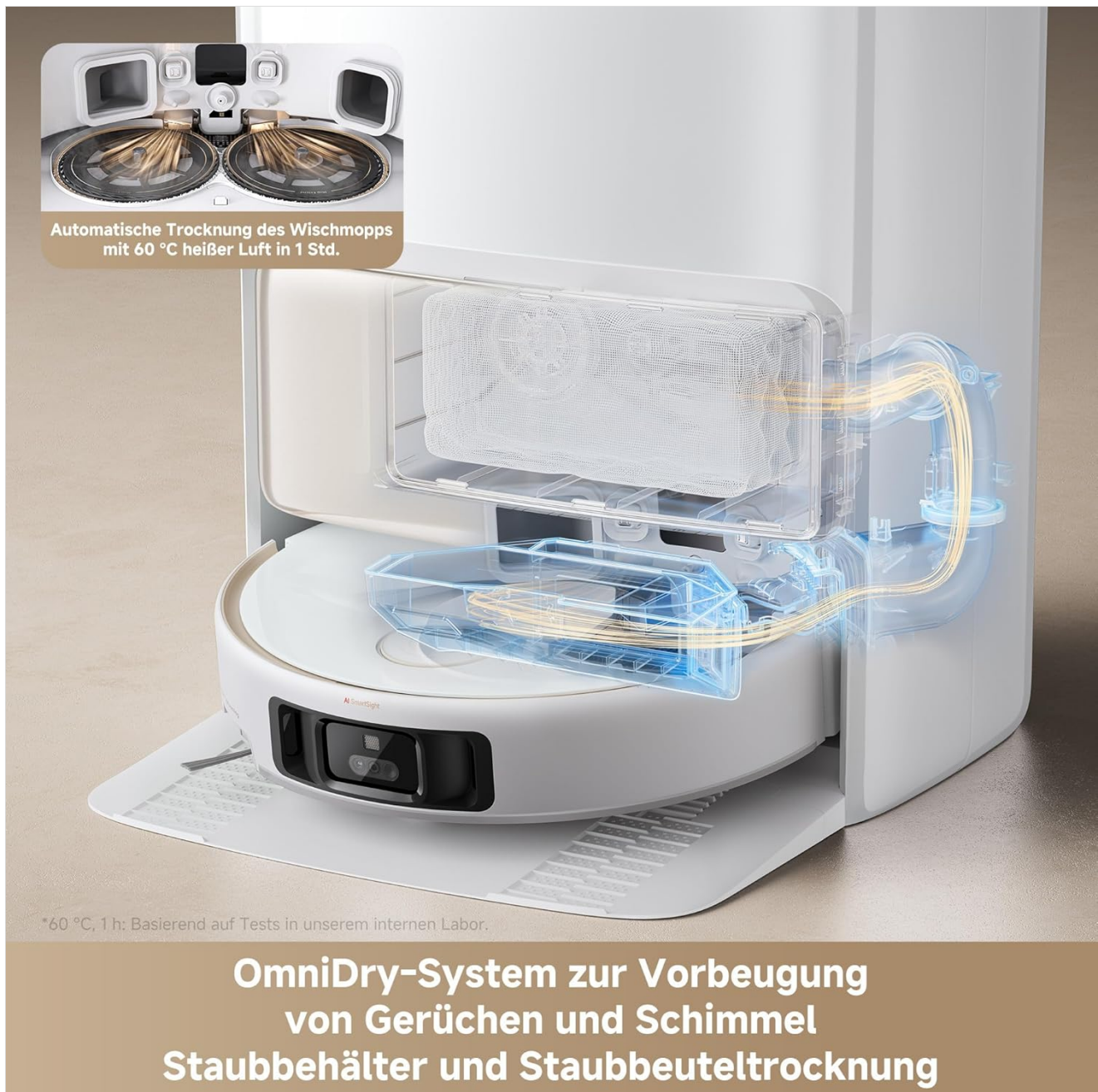
Image: The DuoSolution warm water mopping system in action.