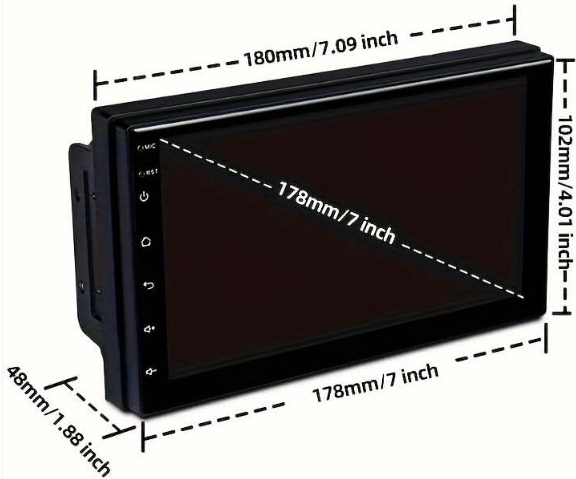
Image 3.1: Diagram showing the physical dimensions of the Ruancheng R1 unit. Measurements are provided in both millimeters and inches for width, height, and depth, indicating a 7-inch screen size.