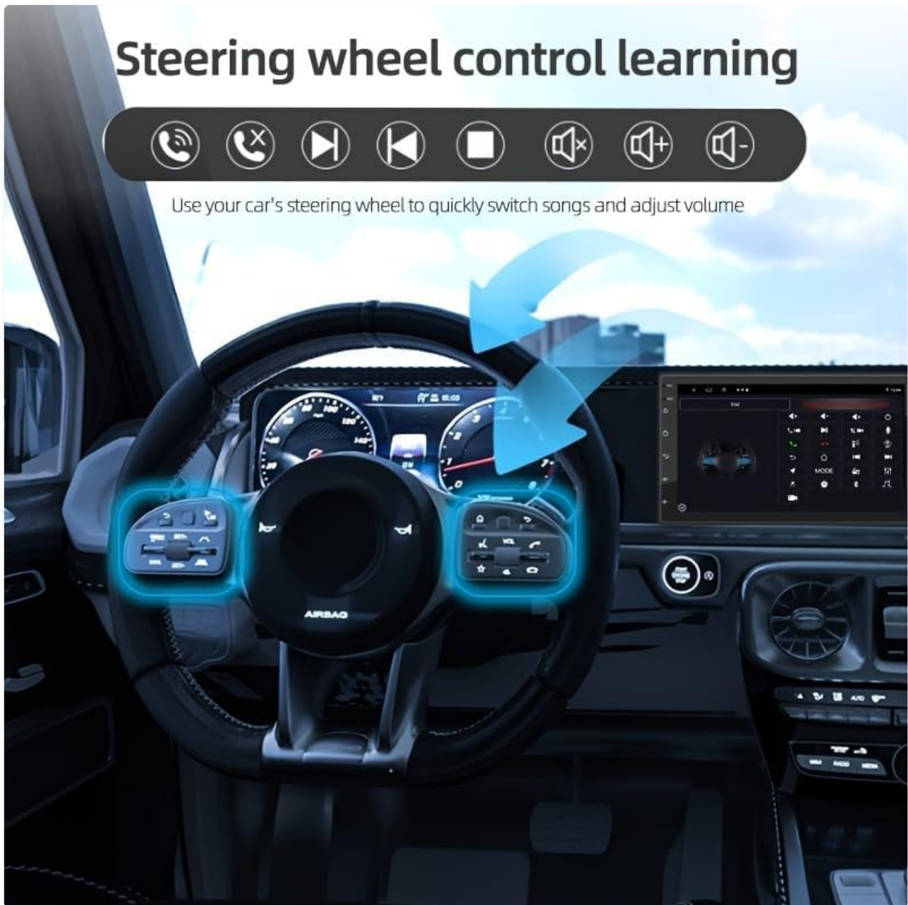
Image 4.1: Illustration of the steering wheel control learning process. This image shows a car's steering wheel with highlighted control buttons and arrows pointing to the car stereo, indicating how to program functions like volume adjustment and track skipping.

If your vehicle has steering wheel controls, you can configure them to operate the car stereo.