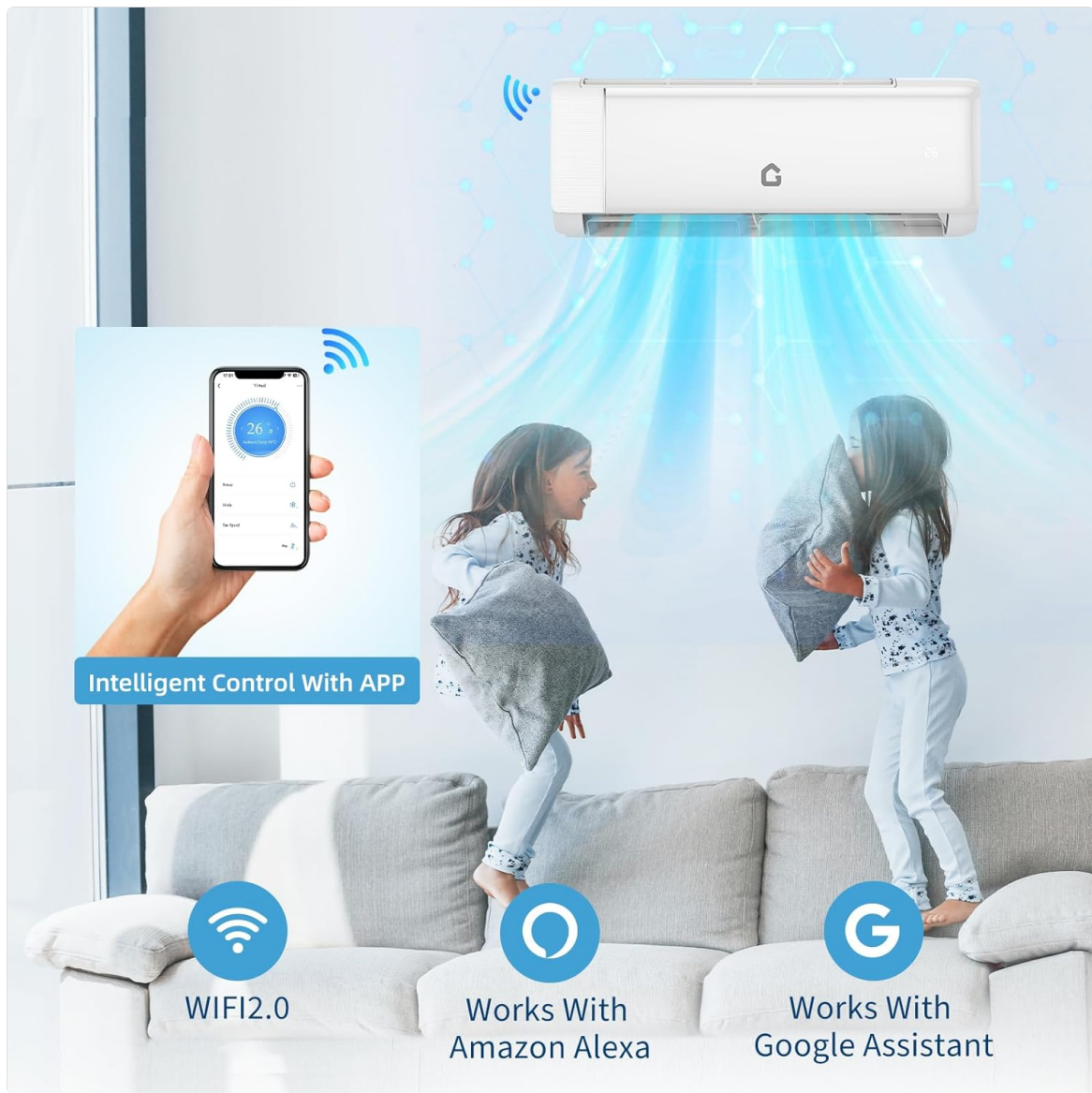
Figure 4: Intelligent Control with App and Voice Assistants

The unit can be controlled via WiFi using a dedicated app, allowing for remote adjustment of settings. It is also compatible with Amazon Alexa and Google Assistant for voice control.