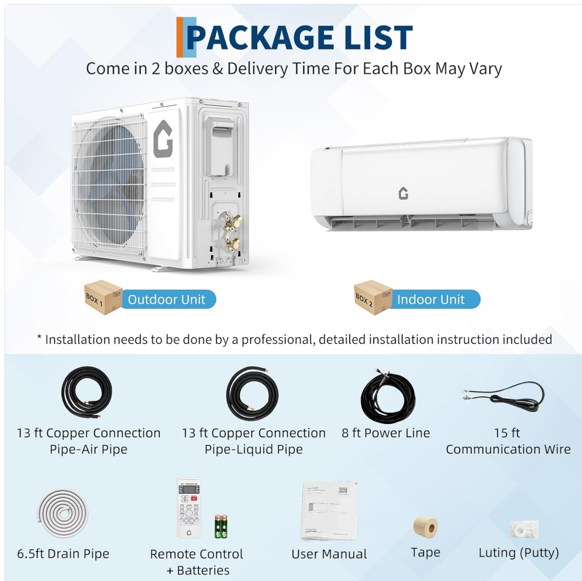
Figure 2: Included Components

The GarveeHome Mini Split Air Conditioner package includes the following components: