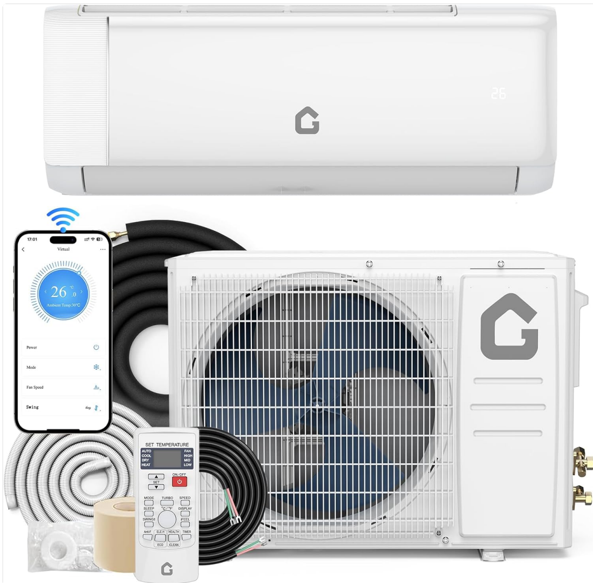
Figure 1: GarveeHome SEER 19 18000BTU Mini Split Air Conditioner System