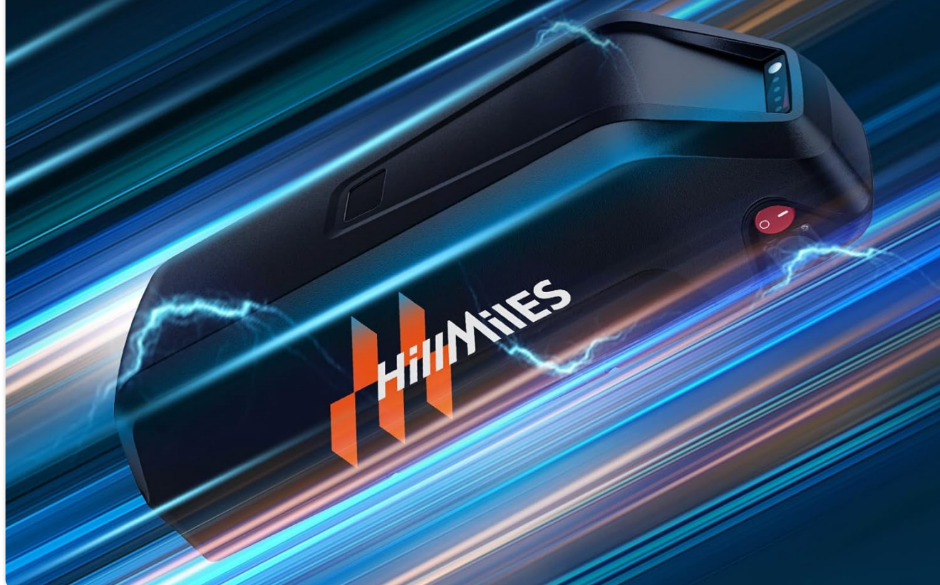
Figure 2: The removable 832 Wh high-capacity battery, offering extended range for your rides.