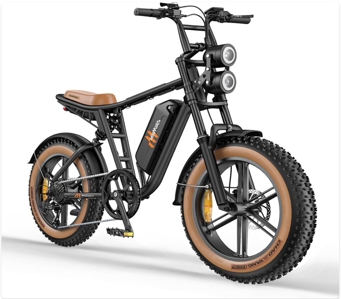
Figure 1: The HillMiles MileZoom1 Electric Bicycle, showcasing its robust design and fat tires.