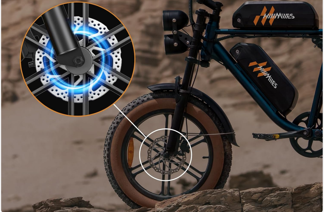
Figure 4: Illustration of the 203mm hydraulic disc brakes, designed for stronger braking, shorter stopping distances, and better heat dissipation.