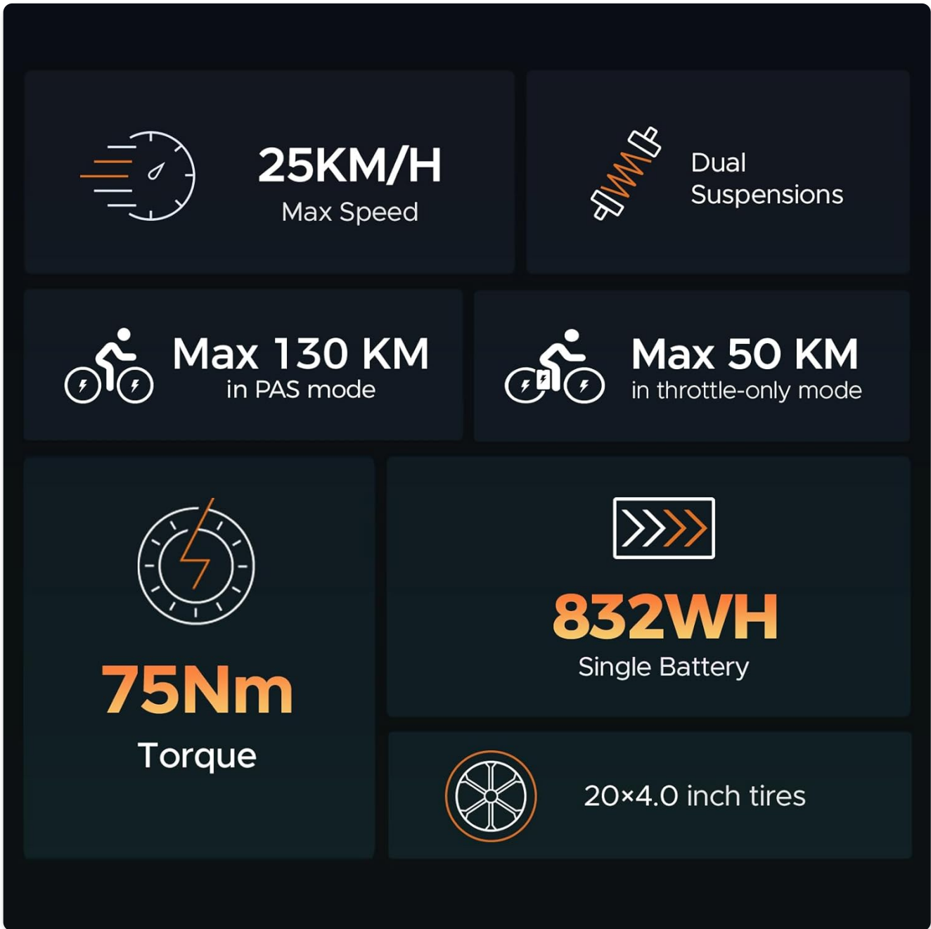
Figure 5: Key performance specifications of the HillMiles MileZoom1, including speed, range, torque, and battery capacity.