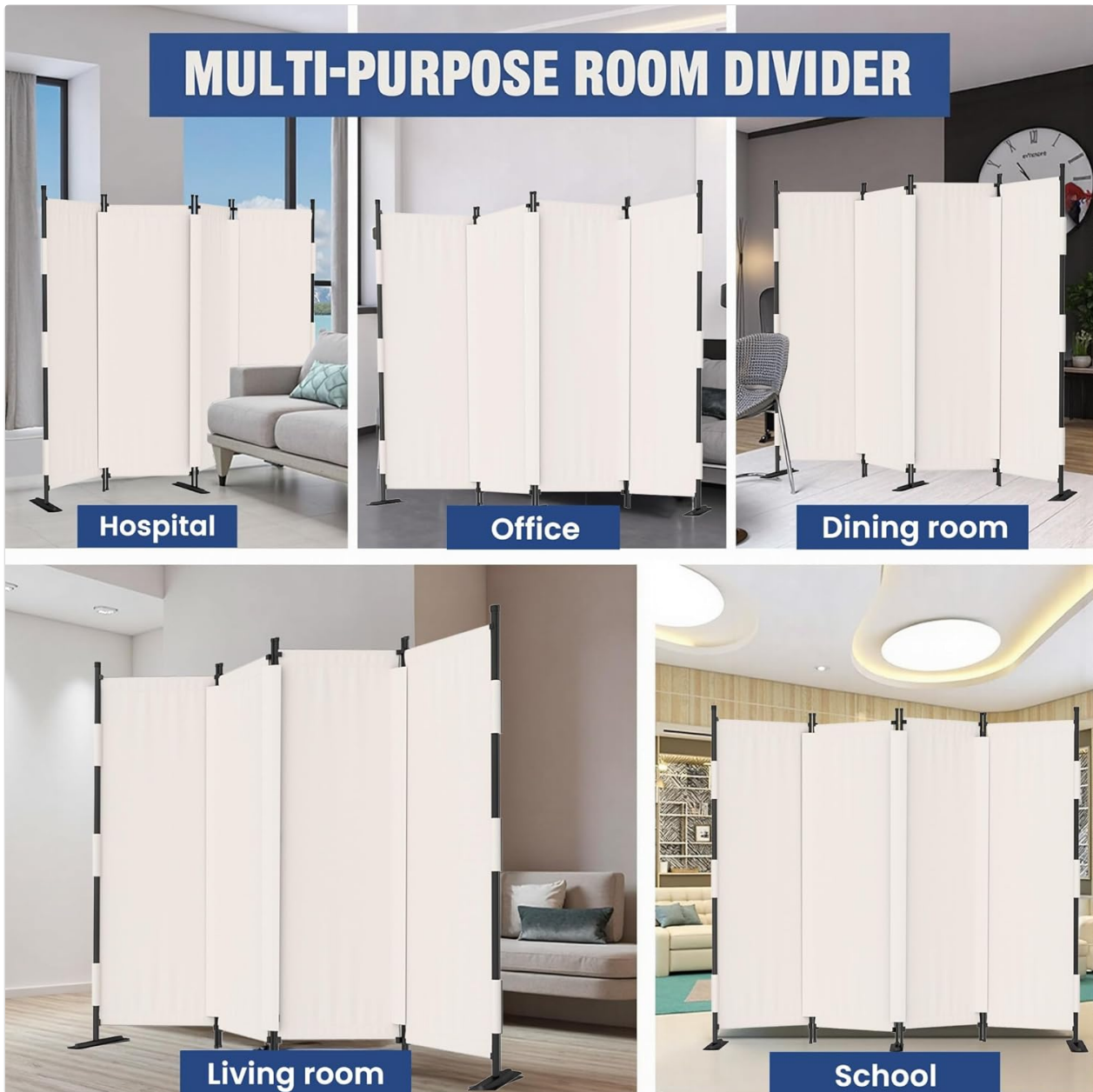
Image: Multiple usage examples of the room divider in different settings such as a hospital, office, dining room, living room, and school.