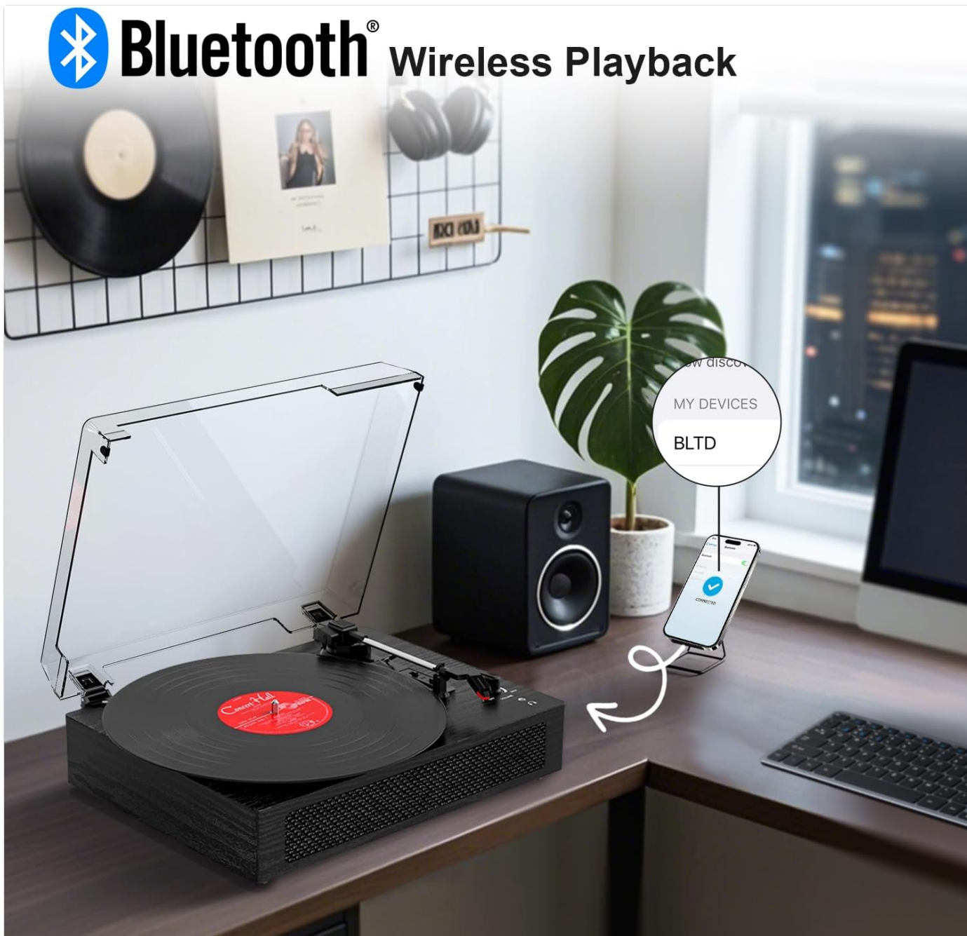
Image: The turntable wirelessly connected to a smartphone via Bluetooth, displaying "BLTD" on the phone screen.

Your browser does not support the video tag.