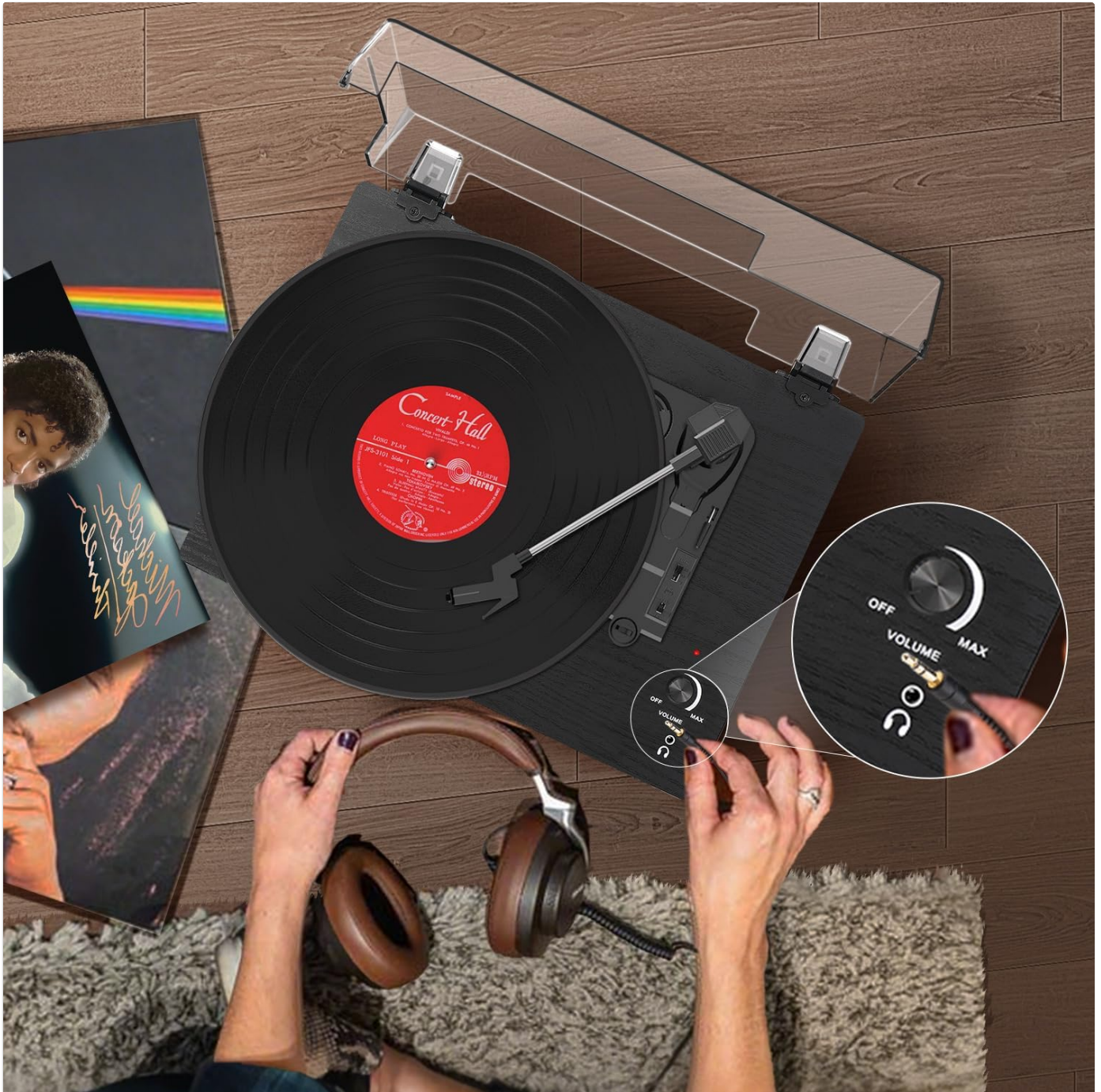
Image: A person wearing headphones while operating the turntable, highlighting the headphone jack functionality.

Video: Demonstrates playing a vinyl record on the turntable, including placing the record, lowering the tonearm, and adjusting volume.