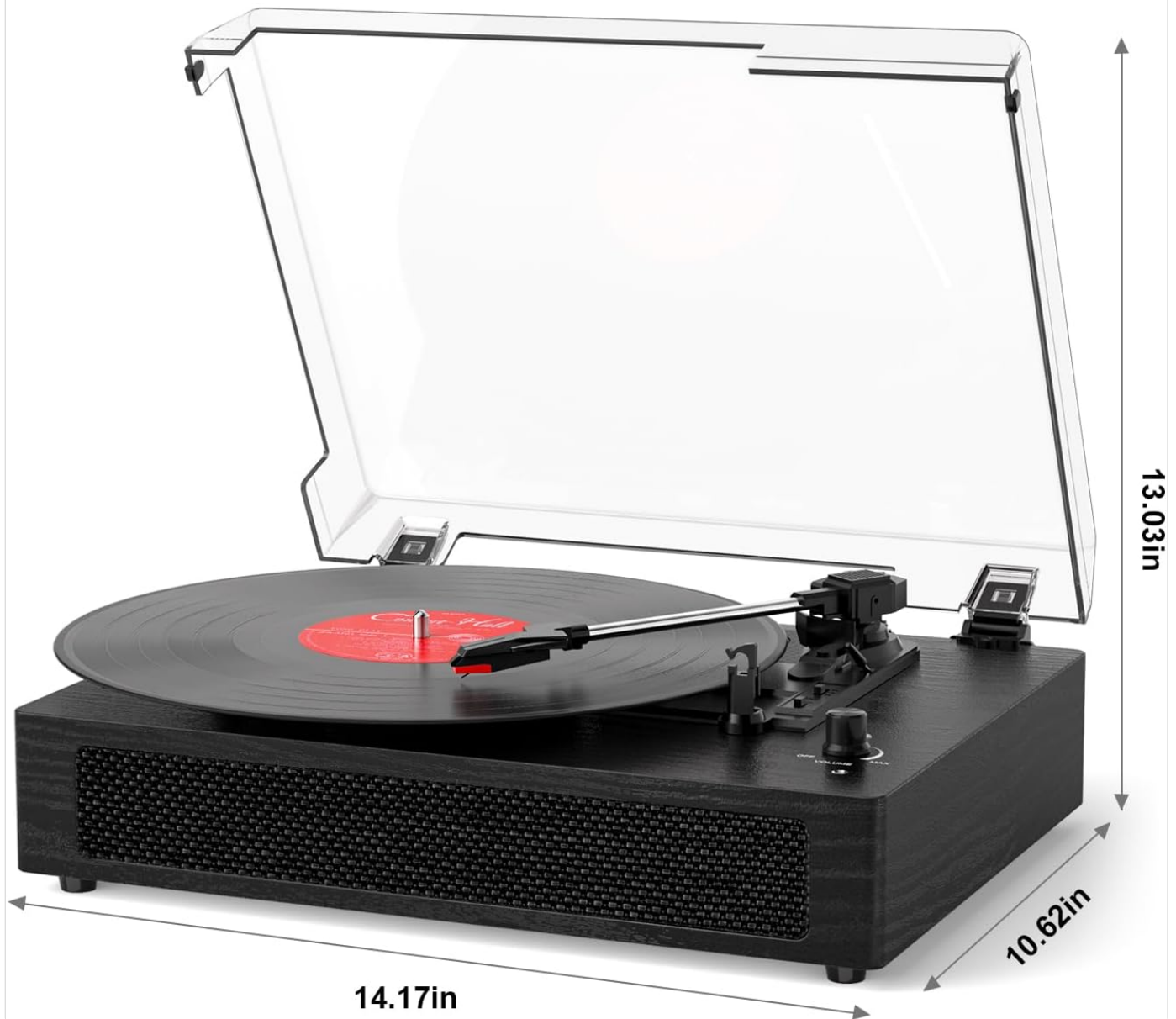
Image: The dimensions of the TANLANIN TE-2019A-BK-TA turntable are displayed, showing 14.17 inches length, 10.62 inches width, and 13.03 inches height with the dust cover open.

Easy setup, fits all spaces—sound never compromised.