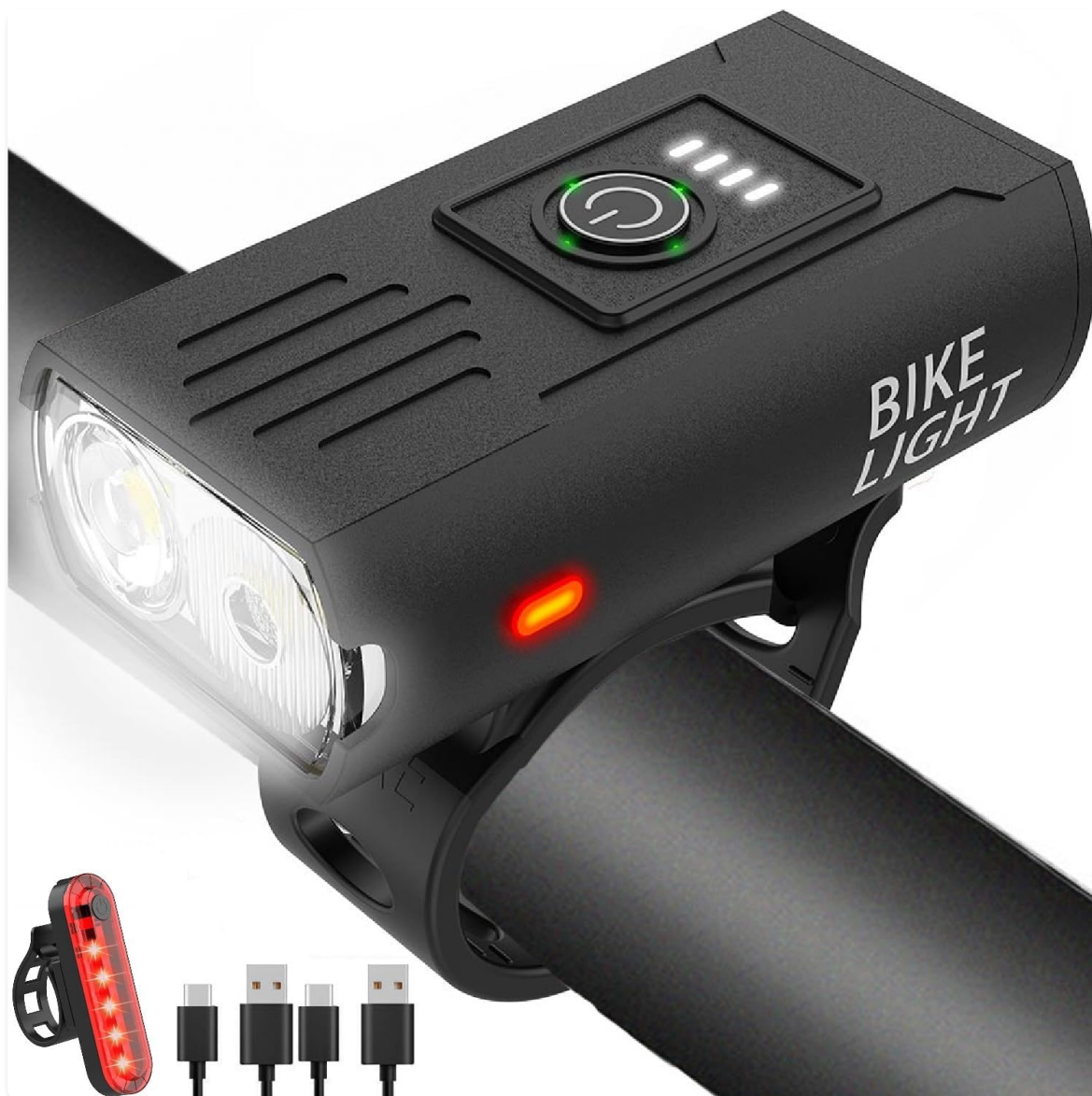
Image: Victoper Bike Light and Taillight Set, showing the front light mounted on handlebars and the rear light with charging cables.