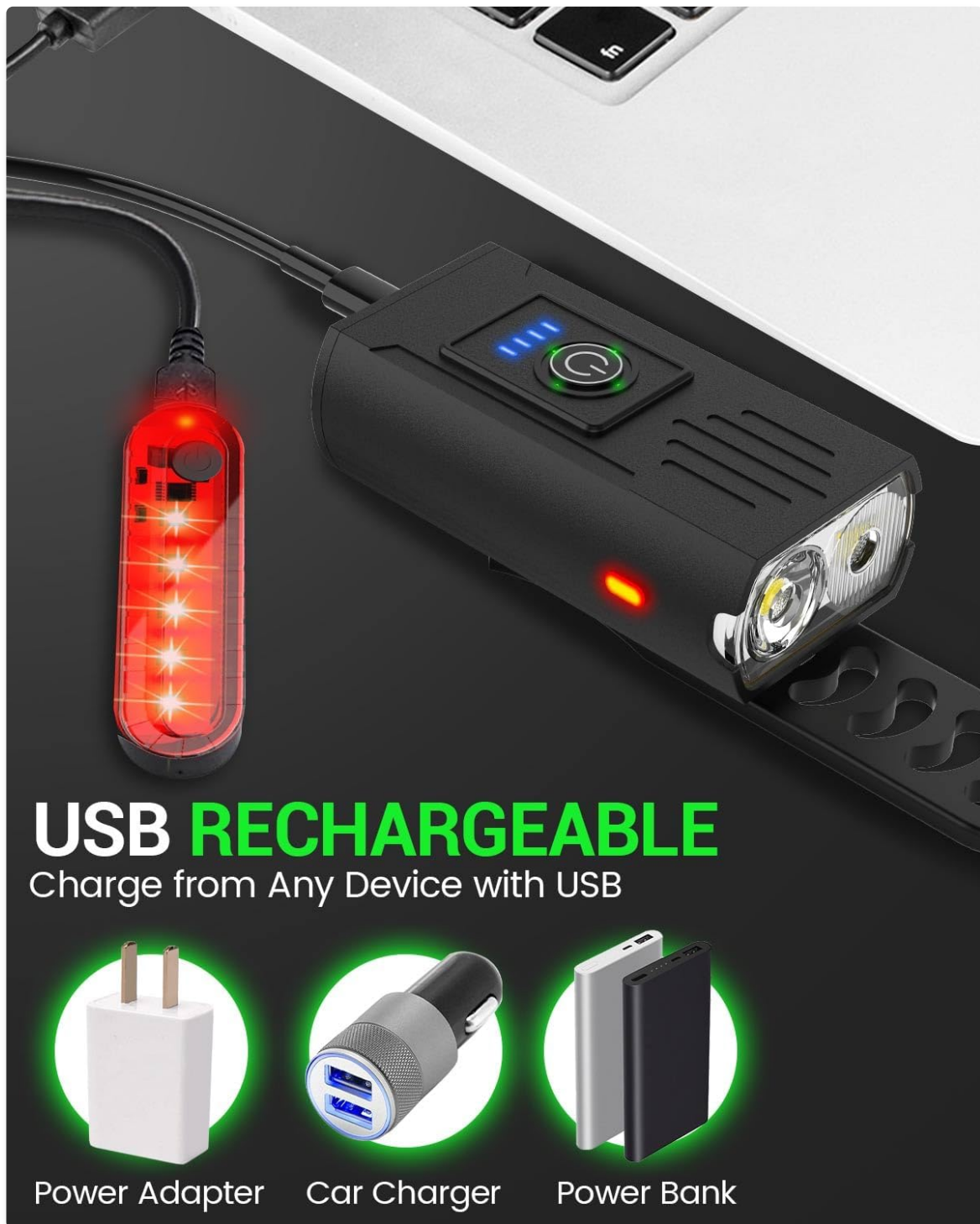
Image: The bike lights connected to USB charging cables, demonstrating compatibility with various USB power sources like power adapters, car chargers, and power banks.

The front light features battery indicator lights (blue LEDs) to show the remaining charge. Ensure both lights are fully charged before use for optimal performance.