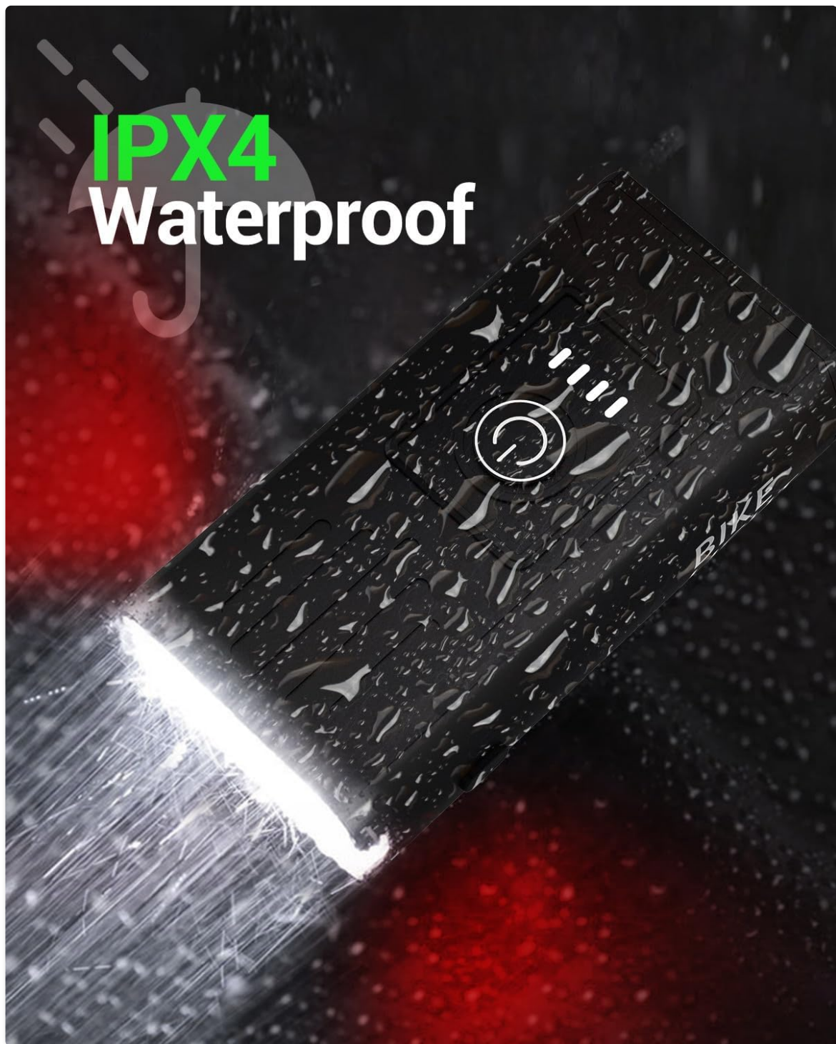
Image: The bike light being splashed with water, demonstrating its IPX4 waterproof rating and durability in wet conditions.

Your browser does not support the video tag.